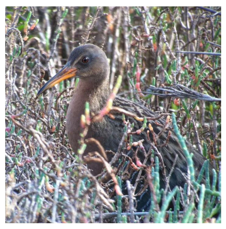
Ridgway's Rail

Beach, Santee. Our schedule on this day will depend in part on what we did or didn't see on our first day. However, it will likely include a variety of stops along the edge of San Diego Bay and around the town of Imperial Beach. Redthroated Loon, Western and Clark's grebes, Surf Scoter, Ridgway's Rail (a recent split from Clapper Rail), and the distinctive Belding's race of Savannah Sparrow are all possible. In addition, the San Diego area plays host to wintering rarities every year and time permitting, we will seek them out where possible. In the afternoon, we will work our way back inland to the suburb of Santee. A series of manmade lakes in this area provides great birding with Wood Duck, Ringnecked Duck, Green Heron, Red-shouldered Hawk, Nuttall's Woodpecker, Cassin's Kingbird, Western Bluebird, Townsend's Warbler, and the declining Tricolored Blackbird among the possibilities. We will also be on the lookout for the introduced, but now countable, Scalybreasted Munia which occurs in some numbers in San Diego County.