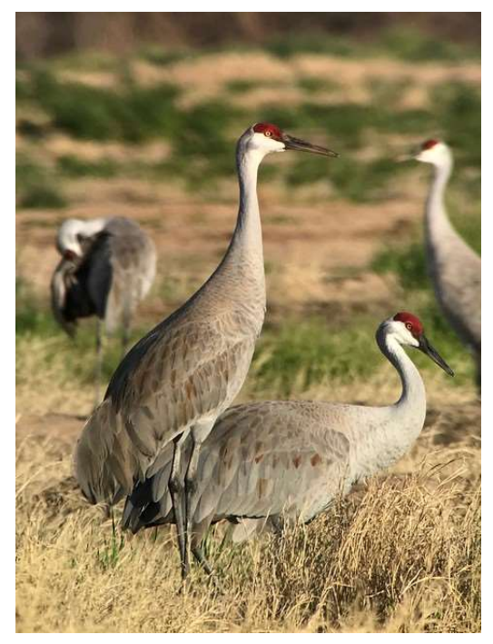
Sandhill Cranes

Cranes. Other birds to look for as we head into El Centro include White-faced Ibis, Mountain Plover, Long-billed Curlew, and Burrowing Owl.