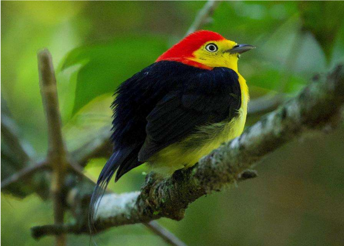
Wire-tailed Manakin, Pipra filicauda .

Now that you have visited the impressive ecosystems surrounding the Inirida River, please consider joining me in other destinations, hosting a unique flora and fauna. Some of these tours are: