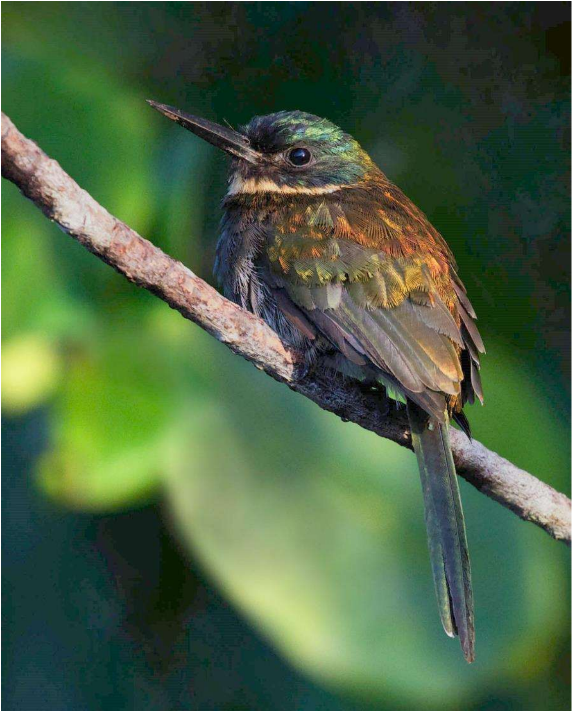
Bronzy Jacamar, Galbula leucogastra .