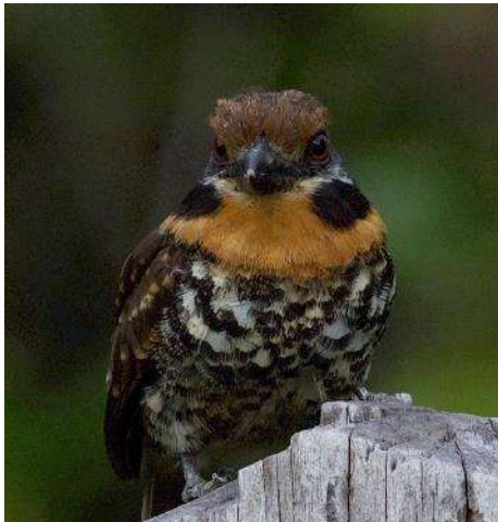
Spotted Puffbird, Bucco tamatia .

to enjoy the beauty of the male Pompadour Cotinga. Also, we were touched by the soft calls and pretensions of the much smaller White-browed Purpletuft. After midmorning, outside in the grassland, the temperature had increased dramatically, and we could not understand how a bird with a black mantle such as the Swallow-winged Puffbird could tolerate the exposure in the heat while spending much of the day perched on a bare branch.