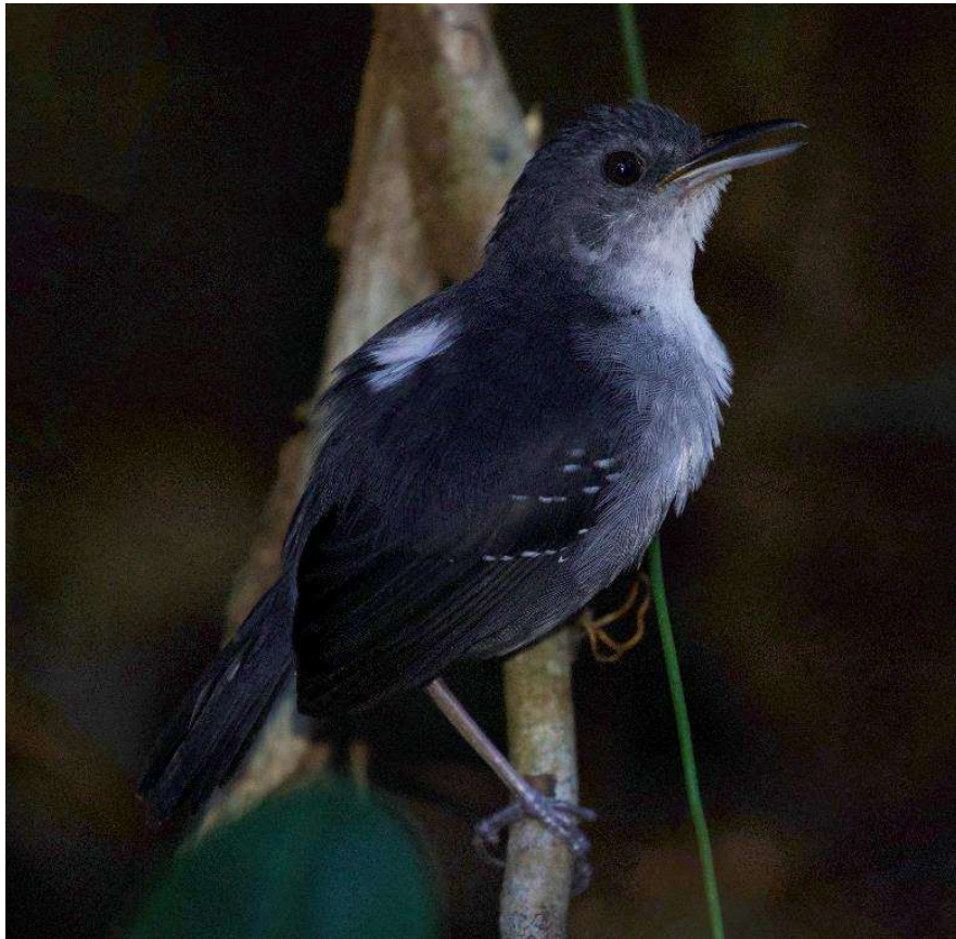
Yapacana Antbird ( Aprositornis disjuncta).