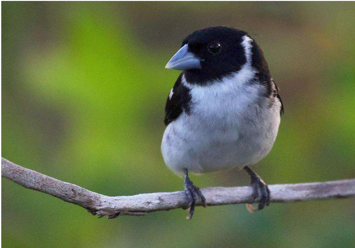
White-naped Seedeater, Sporophila fringiloides .

in another department, Vichada), where we were rewarded with views of Chestnut-backed Antshrike, Plain-crowned Spinetail, and Orange-headed Tanager.