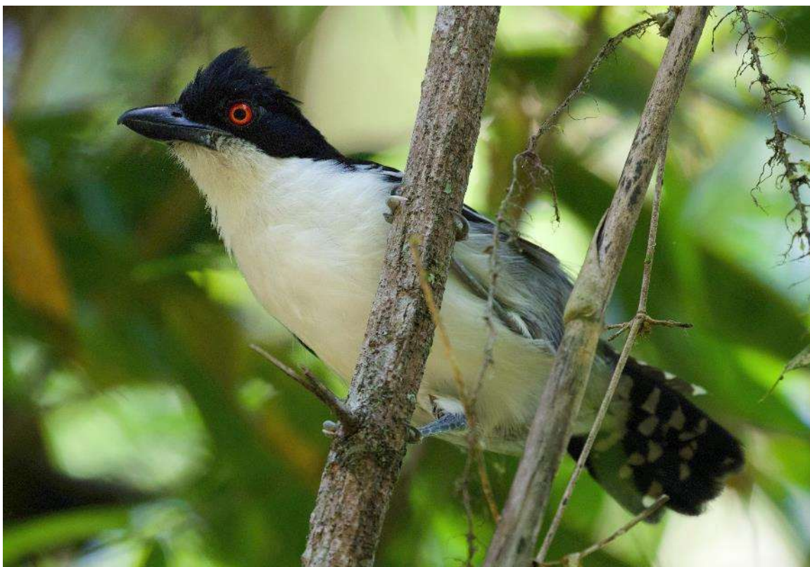
Great Antshrike, Taraba major .

time we raised our heads in search of a bird. The forest understory was also occupied by other species such as the Blackish-gray Antshrike, Common Scale-backed Antbird, and Green-tailed Jacamar. Some birds were difficult to see, while others came nicely to the forest edge. One example was a male Giant Antshrike that appeared completely in the open allowing superb views.