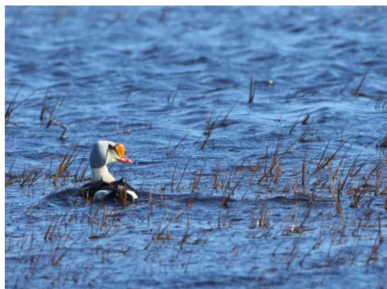
A drake King Eider on a sunny Arctic day

The birds are represented by a dazzling array of waterfowl, shorebirds, and cliff-nesting alcids. Arctic Loons, Common and King eiders, Pink-footed and Barnacle geese, Dovekies and Thick-billed Murres, and even Ivory Gulls are among the highlights, alongside the spectacle of thousands of nesting birds.