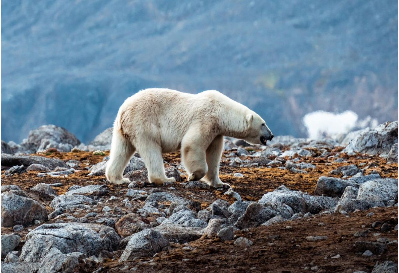
A polar bear on the hunt in Svalbard

In the north of Norway, only 600 miles from the North Pole, lies the Svalbard Archipelago, a polar wonderland of dramatic landscapes and seascapes, immense icebergs, calving glaciers, sheets of pack ice, snow-blanketed mountains, sheer fjords, and flower-spangled tundra.