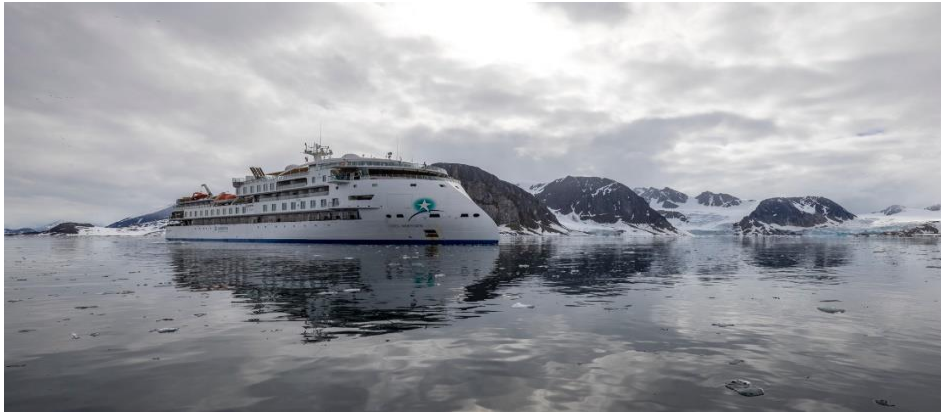
Greg Mortimer

The Ship – The Greg Mortimer can accommodate 132 guests per voyage in 76 cozy, comfortable cabins. All cabins have a view of the ocean, and 85% of the cabins have their own balcony. The ship also features a modern lecture lounge, multiple observation areas, zodiac launching platforms, a restaurant serving excellent meals, a gym and wellness center, Jacuzzis, a mudroom, and many other amenities. A fleet of Zodiac landing craft permits landings anywhere nature or curiosity dictates.