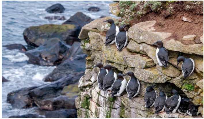
Thick-billed Murres on their perilous nesting ledges

After a mandatory final health screening and Covid test, we will enjoy a sightseeing excursion through Longyearbyen, the gubernatorial capital of Svalbard and the northernmost city of more than 1,000 inhabitants in the world. Founded early in the twentieth century by an American coal magnate, Longyearbyen is now a center of education, tourism, and research. Some 2,400 people live here, above the 80th parallel; each year, more than 40,000 visitors arrive at the airport to begin their exploration of Svalbard.