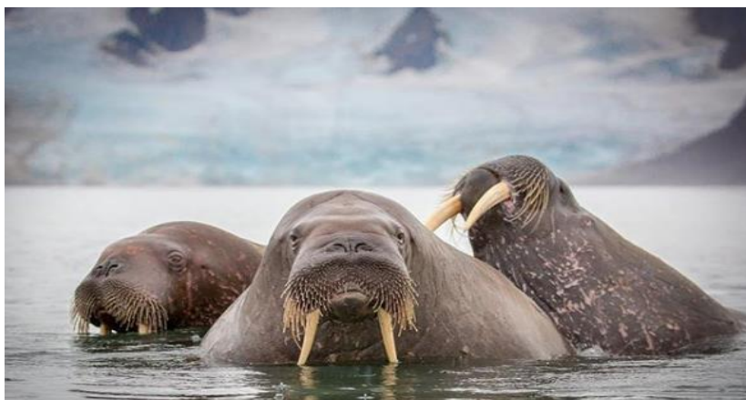
Walrus in Svalbard

TOUR SIZE: This tour is limited to 16 VENT participants.