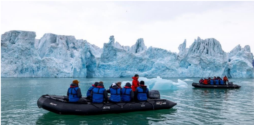
Svalbard by Zodiac

June 21-29, Days 4-12: Svalbard. This is the Arctic at its wildest, with spectacular fjords, magnificent mountains, and even a fossil-rich polar desert. Each day, our expedition team will rely on experience gathered over countless journeys to plan our excursions, selecting our localities based on weather, sea ice, and the daily and seasonal movements of the wildlife.