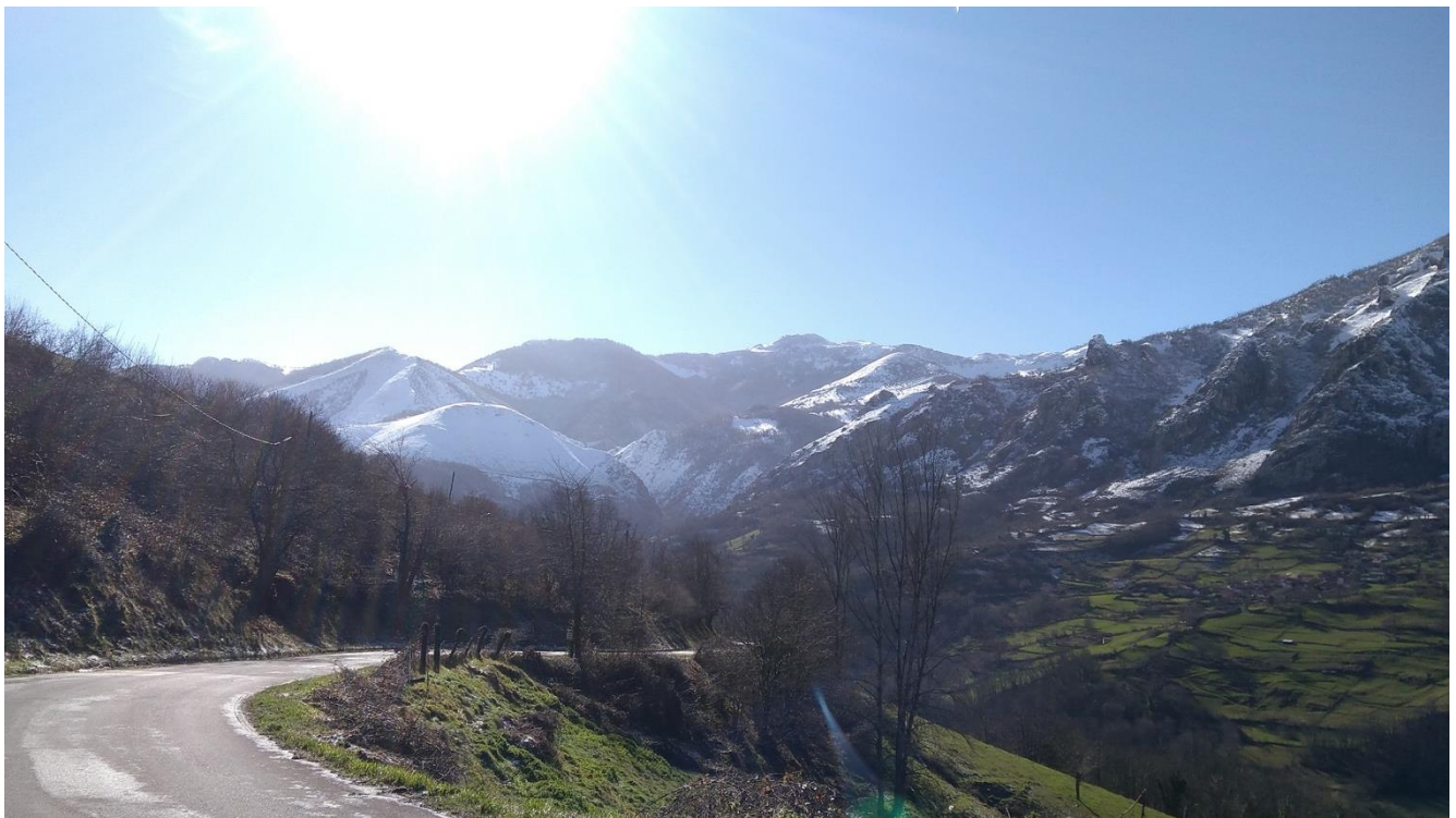
Near Ubiñas

The Principality of Asturias, an autonomous province in northernmost Spain, bills itself today as Spain's Natural Paradise, with wild rocky coasts, placid beaches, and some of the highest, most rugged mountains on the continent. This is also one of Europe's most culturally complex regions, continuously inhabited since the dawn of the Paleolithic, and it was in the caves of northern Spain some thirty thousand years ago that western art was born.