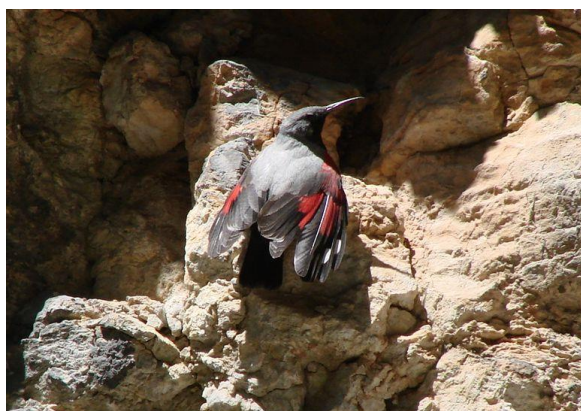
Everywhere scarce, everywhere unpredictable: the Wallcreeper.

September 2, Monday, Day 6: The Picos de Europa. The spectacularly rugged mountains of the Picos de Europa National Park cover more than 250 square miles in Asturias, Cantabria, and Castilla and León. The highest peaks here tower more than 8,000 feet above the sea, their bare, windswept tops the home of Griffon and Egyptian