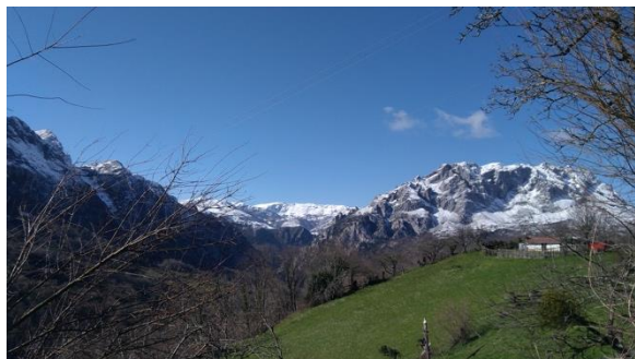
The sublime landscapes of Ubiñas.

September 4, Wednesday, Day 8: Parque Natural de las Ubiñas-la Mesa. Most famous as a stronghold of the Wolf and the Brown Bear, this vast park in southern Asturias also offers excellent birding opportunities. An hour's drive from Oviedo, Las Ubiñas-la Mesa is home to low densities of resident Citril Finch, Yellowhammer, and