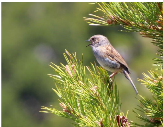
A Dunnock greets the day.

If the birding is good, as it so often is, we may spend most of the morning in a leisurely stroll through these 250 acres. Afterwards we will take a relaxed guided walking tour of Oviedo's historic center, capital of the Asturian kings from the early ninth century on. The city's cathedral is a gem of the Iberian Gothic; the south tower, with its delicate octagonal steeple, is justly world-famous, and the recently restored choir stalls, carved in walnut in the 1490s, are a priceless visual encyclopedia of late medieval life.