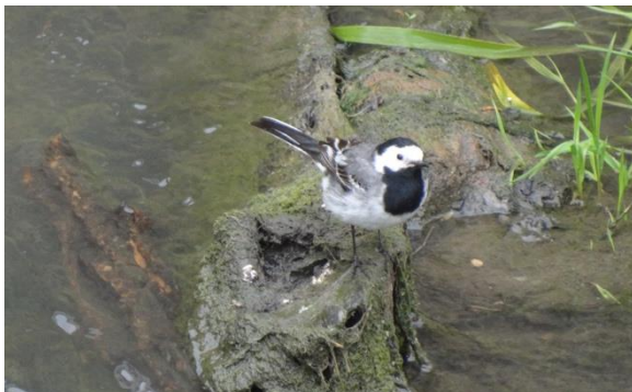
The irresistible and often common White Wagtail

August 29, Thursday, Day 2: Arrival in Oviedo. We will assemble at 6:30 p.m. in the lobby of our Oviedo hotel for introductions and our first dinner together, a chance to get to know one another and to discuss our plans for the days to come.