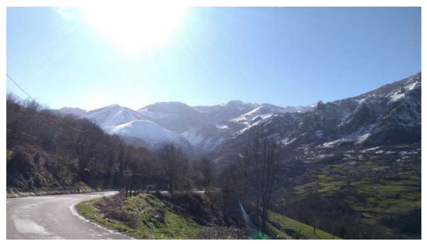
Near Ubiñas

The Principality of Asturias, an autonomous province in northernmost Spain, bills itself today as Spain's Natural Paradise, with wild rocky coasts, placid beaches, and some of the highest, most rugged mountains on the continent. This is also one of Europe's most culturally complex regions, continuously inhabited since the dawn of the Paleolithic, and it is in the caves of Northern Spain some thirty thousand years ago that western art was born.