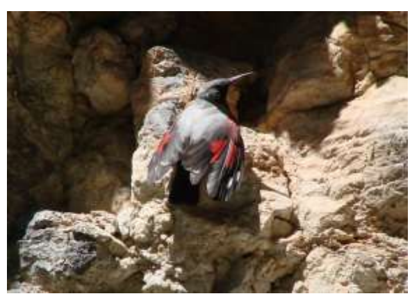
Everywhere scarce, everywhere unpredictable: the Wallcreeper.

We'll maximize our chances by leaving early this morning, arriving in the mountains at sunrise (ca. 8:00 am at this season). Our precise destinations will depend on the weather—it can be quite cool and damp at high elevations, especially in the morning—but we will plan on taking short walks from a series of parking pull-outs.