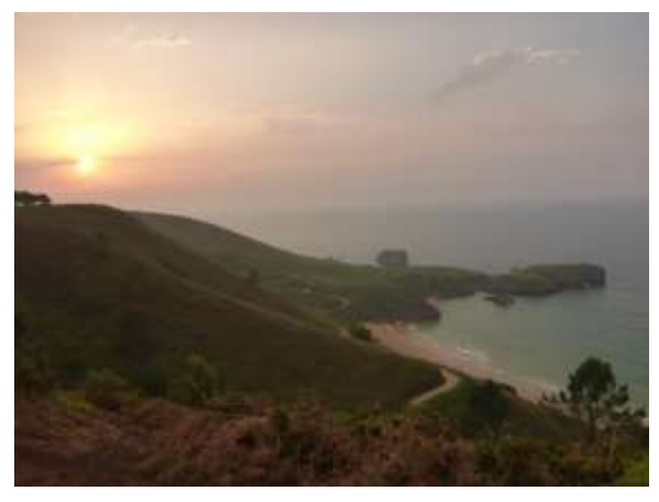
The coast at Ribadesella.

Perched at the mouth of the Sella River, the pleasant town of Ribadesella, an hour from Oviedo, is surrounded by low-lying meadows that attract a good variety of waterfowl, herons, and migrant passerines. We will take a short walk along the banks of the river here in search of Tufted Duck, Purple Heron, and Eurasian Spoonbill. The real draw here, though, is Tito Bustillo, a 2,000-foot-long cave inhabited by early humans as long as 33,000 years ago. This World Heritage Site, discovered in 1968, preserves one of the most extensive series of paleolithic wall art known, depicting horses, deer, a whale, and human figures in more than 100 paintings and incised images. Admission to the cave is strictly timed, so our birding activities will shift depending on the hour we are assigned. Officially, the hour-long tour is offered only in Spanish, but many guides are willing to accommodate English-speaking