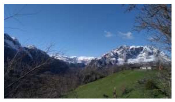
The sublime landscapes of Ubiñas.

September 12, Day 6: Parque Natural de las Ubiñas-la Mesa. Most famous as a stronghold of the Wolf and the Brown Bear, this vast park in southern Asturias also offers excellent birding opportunities. An hour's drive from Oviedo, Las Ubiñas-la Mesa is home to low densities of resident Citril Finch, Yellowhammer, and Rock Bunting. Migrants can include European Honey Buzzard and Ortolan Bunting, and autumn sometimes sees such sought-after high-elevation species as Wallcreeper, Rufous-tailed Rock Thrush, and Ring Ouzel descending from their mountain fastnesses. As always, mountain birding is unpredictable, but whatever the day's bird list, the landscapes will be more than memorable. While we are unlikely to see the area's bears or wolves, we have a better chance of spotting other, less secretive mammals, including Chamois, Red Deer, and Roe Deer.