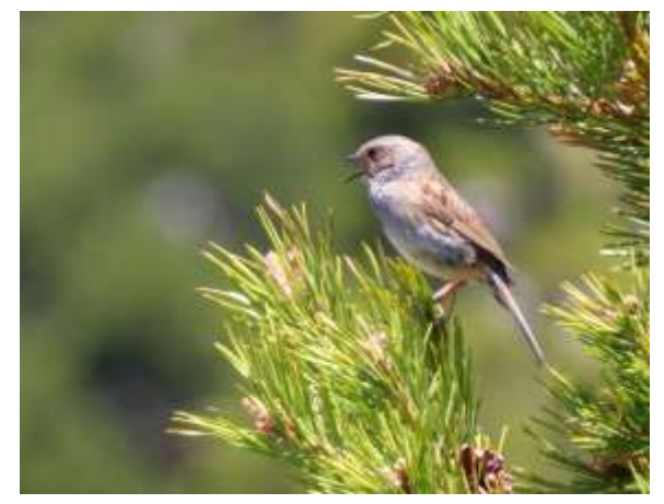
A Dunnock greets the day.

September 9, Day 3: Oviedo. The sun rises late here at the western edge of the Central European time zone, making it easy for us to get an "early" start in our exploration of the Campo de San Francisco, one of the largest urban parks in northern Spain. Tracing its origins to the thirteenth-century orchards and gardens of the local Franciscan monastery here, the park was redesigned two hundred years ago on the informal, English model, with paths and avenues winding through stands of dense vegetation beneath towering trees. Migrant and resident birds gather here among the sculptures and monuments to Asturia's richly varied past—among them the Romanesque portal of the otherwise vanished Franciscan church. Our slow walk may produce good views of common