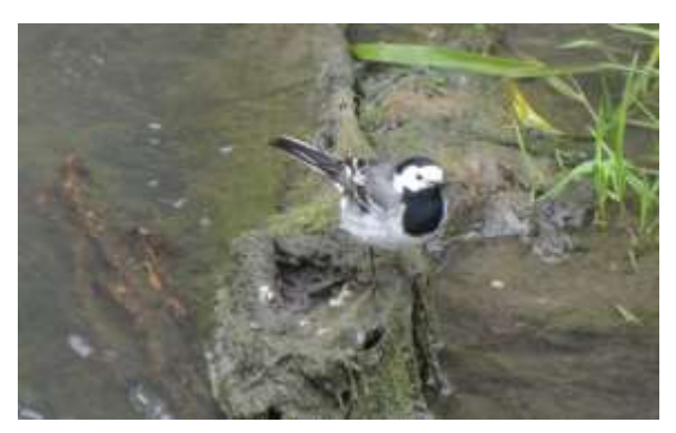
The irresistible and often common White Wagtail

breeders such as the White Wagtail, Short-toed Treecreeper, Dunnock, or Song Thrush, and like urban oases the world over, San Francisco serves as an excellent migrant trap.