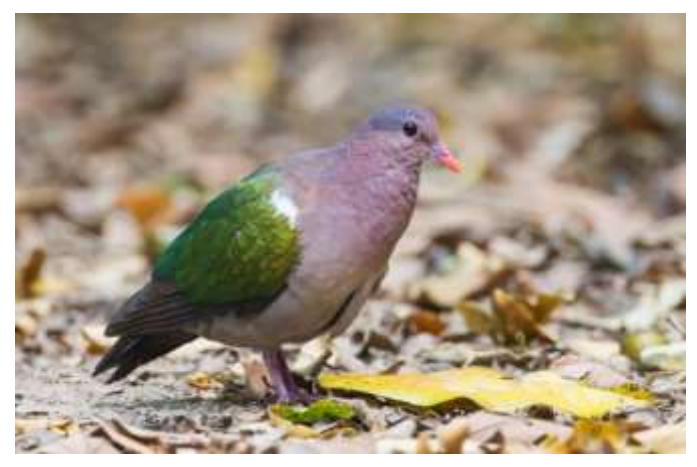
Pacific Emerald Dove

August 27, Day 6: Fly to Taveuni via Nadi. Today we will depart New Caledonia for Fiji. It is a roughly two-hour flight between the two islands. We will depart Noumea on flight (subject to change), arriving in the Fijian capitol of Nadi, before transferring to the outer island of Taveuni via another short flight. We should have a chance to explore our beautiful resort near the southern tip of Taveuni in the late afternoon.