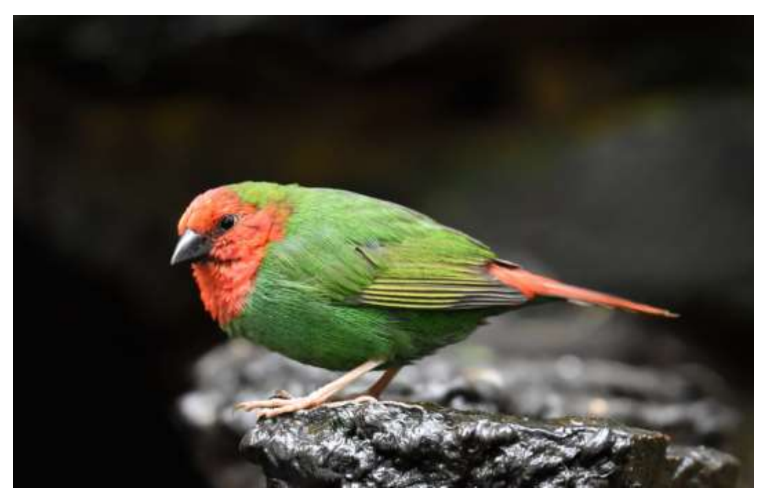
Red-throated Parrotfinch

August 25, Day 4: Birding at Parc de la Rivière Bleue (Blue River NP). There is of course one very special bird we have in mind for our first full day, but alongside the infamous Kagu, there is also a fantastic supporting cast to be found in the protected forests of Blue River National Park. Amongst the dry rainforest, dominated by houp and araucaria trees, we will search for the gorgeous Cloven-feathered Dove, New Caledonian Imperial-Pigeon, "New Caledonian" Shining Bronze-Cuckoo, the striking New Caledonian Goshawk, Horned and New Caledonian Parakeets, the rare Crow Honeyeater, Barred Honeyeater, New Caledonian Streaked Fantail, New Caledonian Cuckooshrike, the strange Southern Shrikebill, Melanesian Flycatcher, New Caledonian Whistler, cute Yellow-bellied Flyrobin, Green-backed White-eye, scarce Striated Starling, and the beautiful Red-throated Parrotfinch.