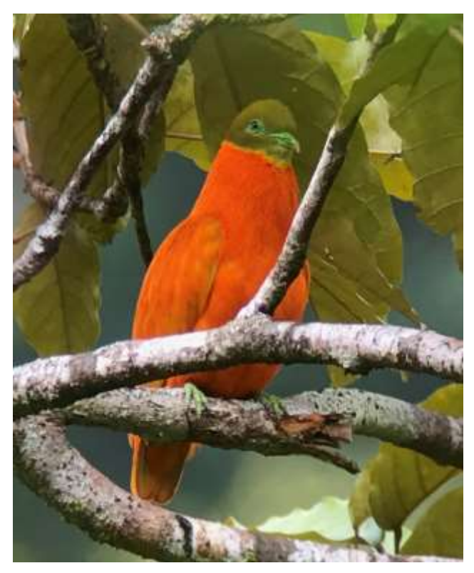
Orange Dove

We will start our island odyssey on the main island of New Caledonia, Grand Terre. The remarkable Kagu will be high on our list of targets, but there are many more beautiful and little-known endemics to enjoy in New Caledonia. The rare and strange Crow Honeyeater, Horned Parakeet, stunning Cloven-feathered Dove, tool-using New Caledonian Crow, and the scarce New Caledonian Grassbird are just some of the great birds on offer. We will stay at fine lodgings on Grand Terre, where French cuisine is served with a tropical backdrop.