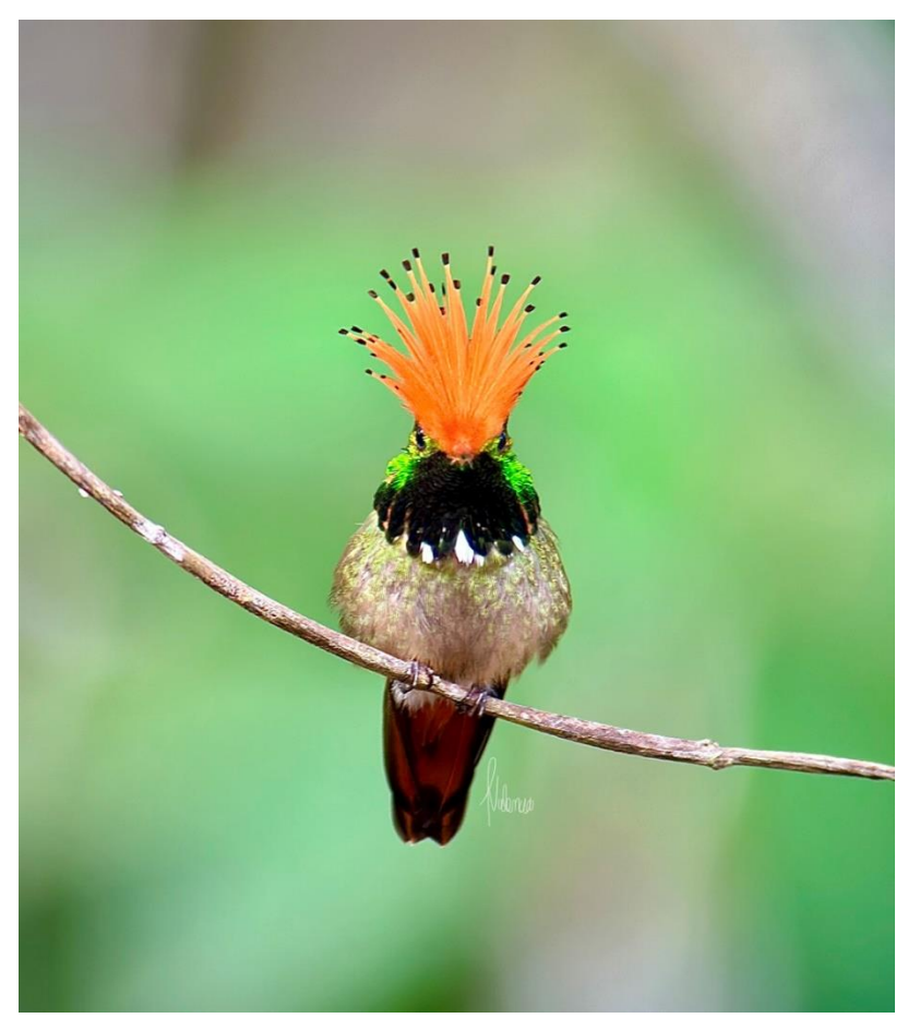
Rufous-crested Coquette

Each day at the biological station concludes with an experience of culinary delight, with meals tailored to individual preferences.