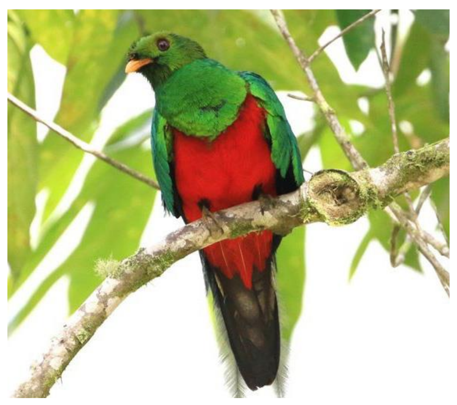
Golden-headed Quetzal

and orchids. We have two days to delve into the richness of this unique environment, teeming with natural wonders. Our birding here is along roads and serene trails, offering the ideal vantage points for a myriad of avian species. The meticulously tended lodge gardens are a haven for an array of hummingbirds, including beauties such as Violet-fronted Brilliant, the endemic Peruvian Piedtail, the timid Green Hermit, and the Many-spotted and Speckled hummingbirds. Feeding stations attract vividly hued tanagers such as the Golden, Silver-beaked, and Golden-eared, as well as Orange-bellied and Thick-billed euphonias and even the striking Versicolored Barbet. A real highlight is the elaborate mating ritual of the fabulous Andean Cock-of-the-rock, an impressive member of the cotinga family. We will visit the lek to witness the early morning gathering of the brilliantly colored males as they perform their finest displays in a bid to attract a female.