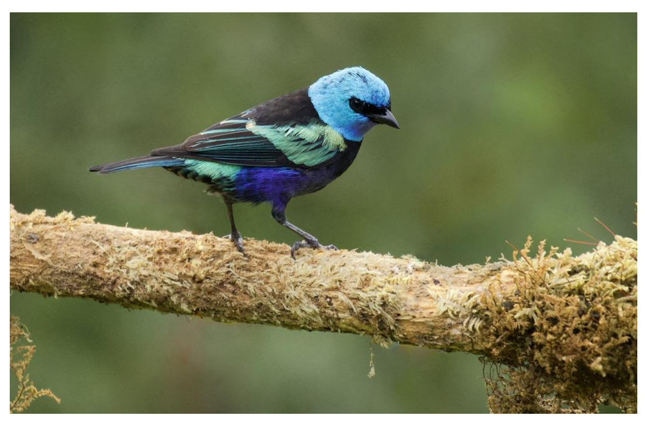
Blue-necked Tanager

As the day winds down, a delightful dinner awaits in the main building, which has a nice library and a cozy fireplace. Dinner at the station is a wonderful opportunity to meet researchers working on projects in ornithology, biodiversity, ecology, conservation, and more. Their work contributes significantly to our understanding of the complex dynamics of these forests.