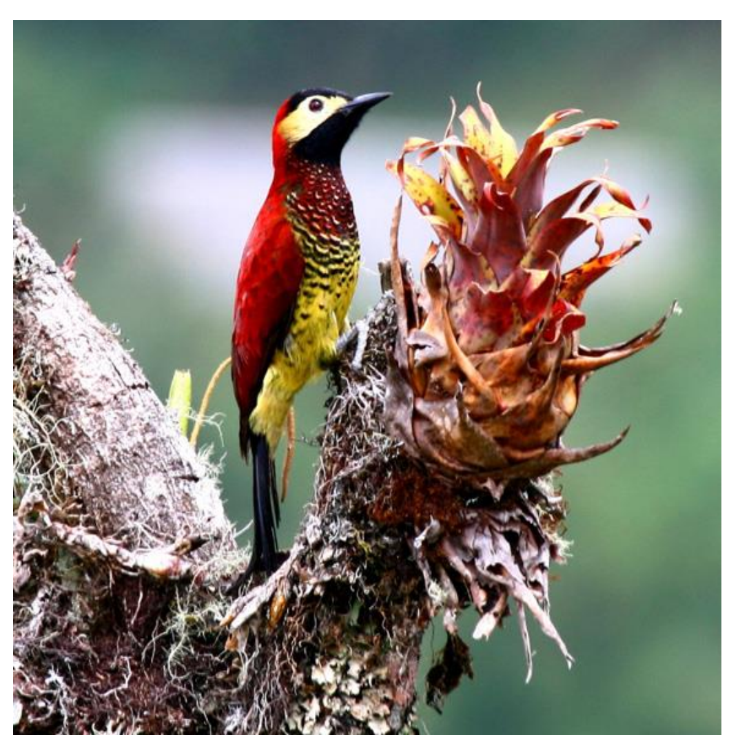
Crimson-mantled Woodpecker