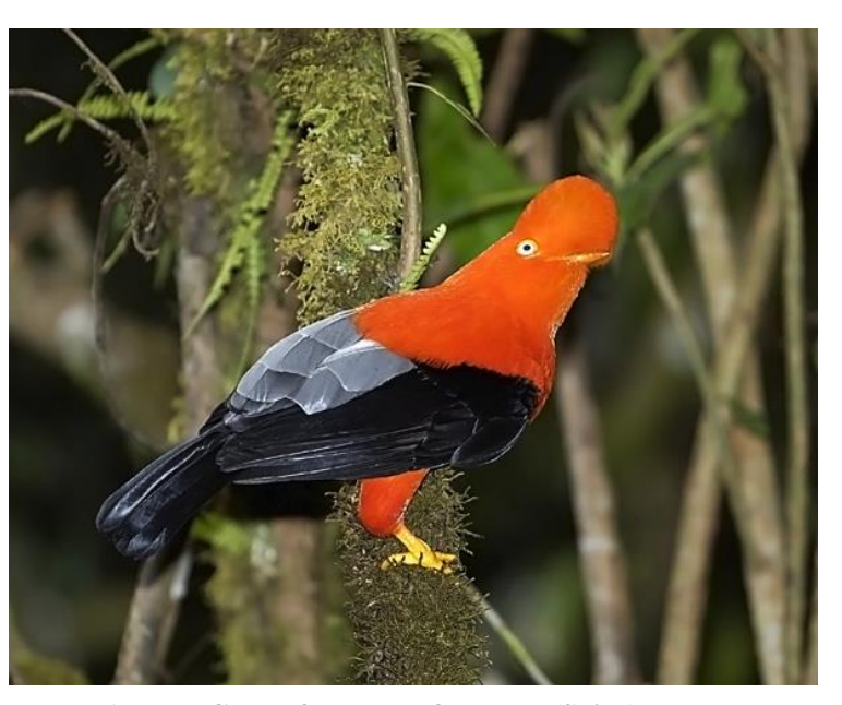
Andean Cock-of-the-rock @ Robert (Spike) Baker

In the cloud forest, we'll delight in a tapestry of colorful hummingbirds and tanagers and stunning Andean Cocksof-the-rock at their morning mating rituals. Other prizes here include Blackand-chestnut Eagle, Andean Motmot, Lyre-tailed Nightjar, and Crimsonmantled Woodpecker. We'll search the lush lowland forest for tinamous, woodpeckers, trogons, barbets. honeycreepers, and local celebrities such as the bizarre Hoatzin, King Vulture, Amazonian Antpitta, and Rufous-crested Coquette. We will also visit feeding stations and hummingbird gardens where a dozen or more species are possible at once, affording extraordinary photographic opportunities.