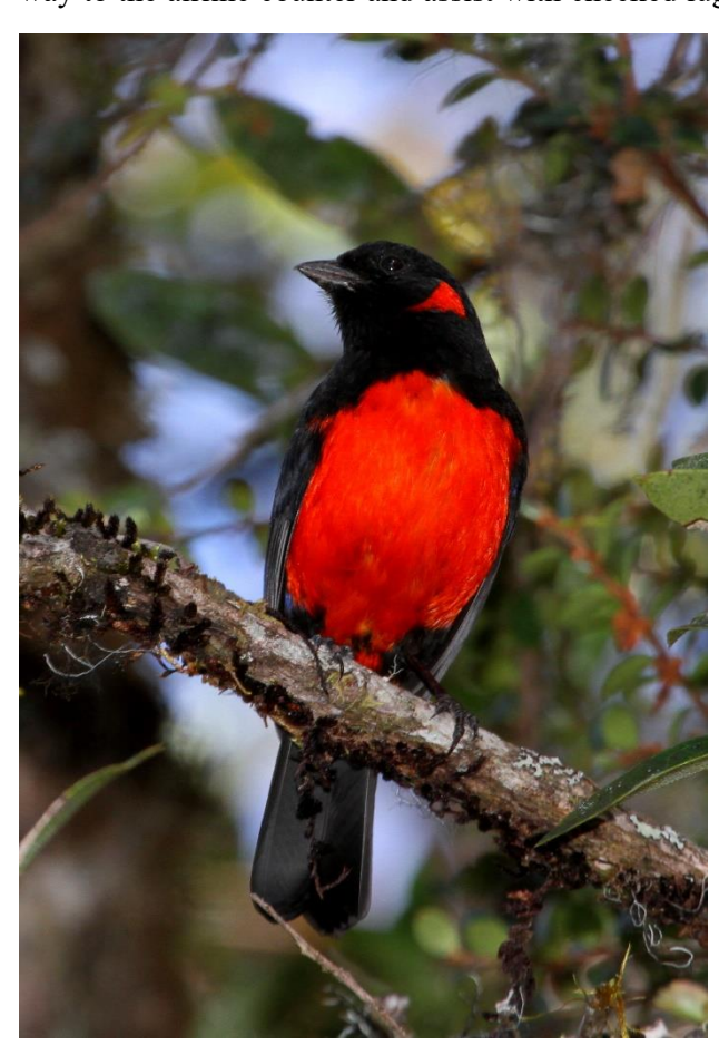
Scarlet-bellied Mountain-Tanager

October 2, Day 2: Flight to Cusco; Laguna Huacarpay and the Manu Road. A VENT representative will meet everyone in the lobby approximately an hour and a half prior to the departure of your domestic flight, to lead the way to the airline counter and assist with checked luggage delivery to the airline. A 90-minute flight from Lima