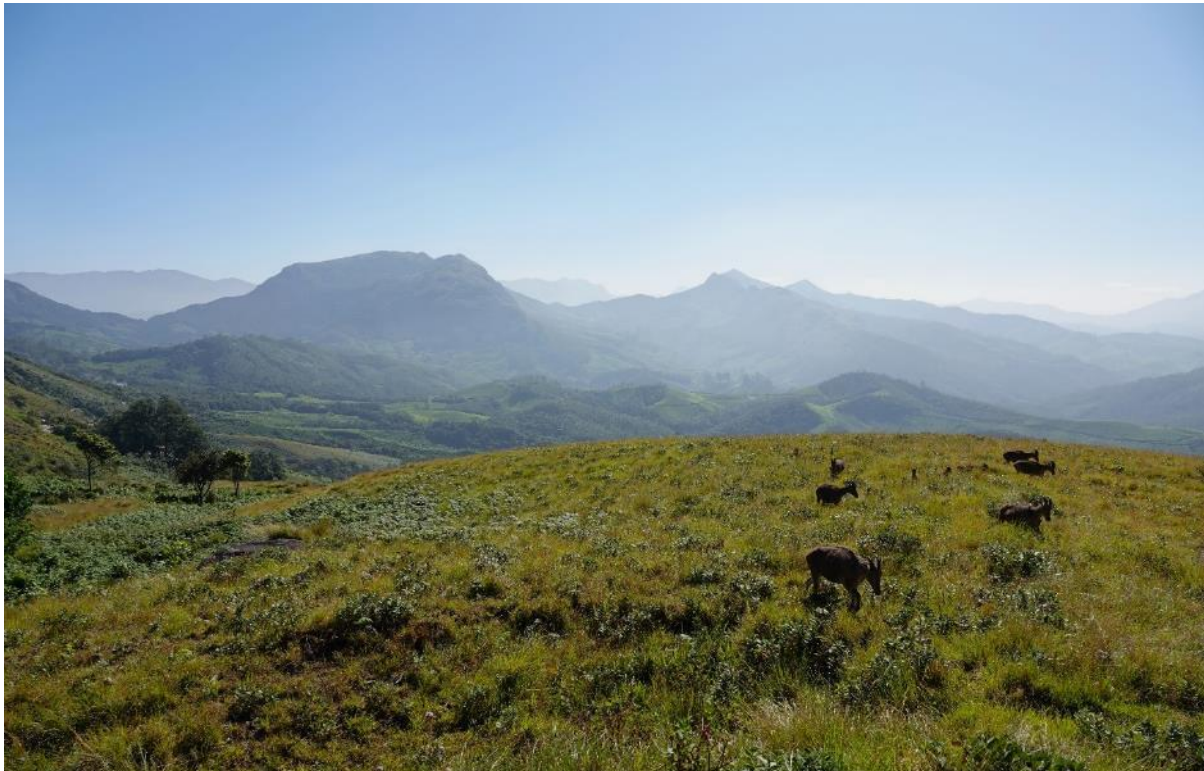
An endangered species of mountain goat, Nilgiri Tahr, graze amongst the native grasslands of Eravikulam NP near Munnar

Making our way even further downhill from Kumily, we soon found ourselves on the banks of the Periyar River in the humid backwaters of Thattekad. We had a birdy afternoon and morning in the local area, enjoying many of the species we had become familiar with over the past fortnight, plus several new ones, even at this late stage of the trip. On our final night we enjoyed the fantastic sights and calls of Great Eared and Jerdon's nightjars.