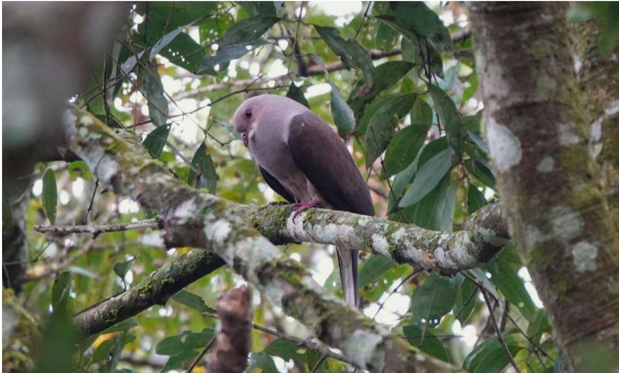
The recently split Malabar Imperial-Pigeon responded beautifully in Periyar NP