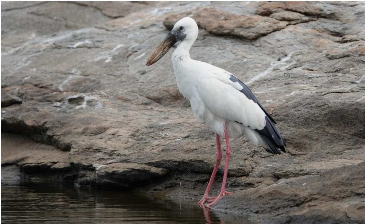
One of many Asian Openbill seen at Ranganathittu near Mysore – the diet of this species consists almost entirely of aquatic snails. The unique bill shape allows it to discard snail shells easily