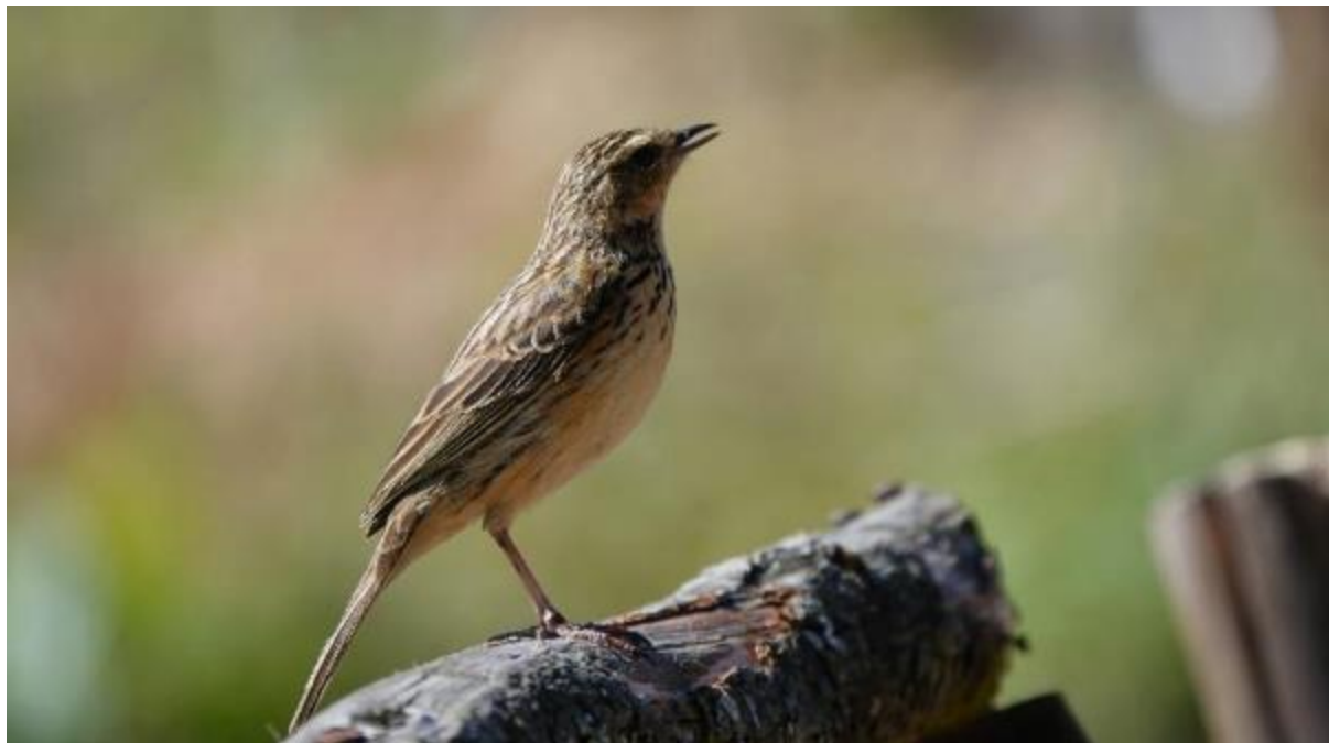
The often tricky Nilgiri Pipit proved surprisingly confiding this year