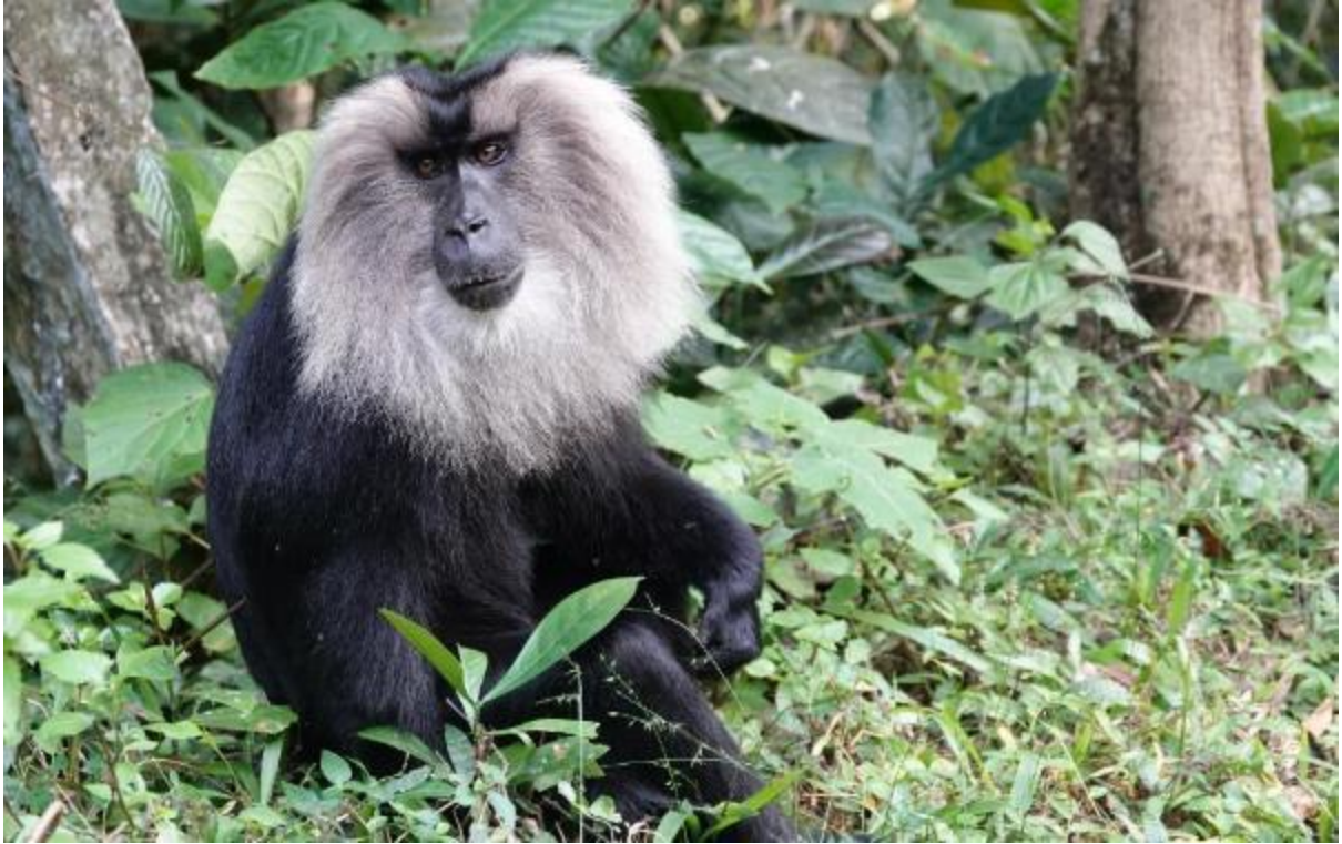
Lion-tailed Macaque from Valparai © Max Breckenridge

Bengal [Indian] Monitor ( Varanus bengalensis ) – A couple of individuals observed at Bokkapuram.