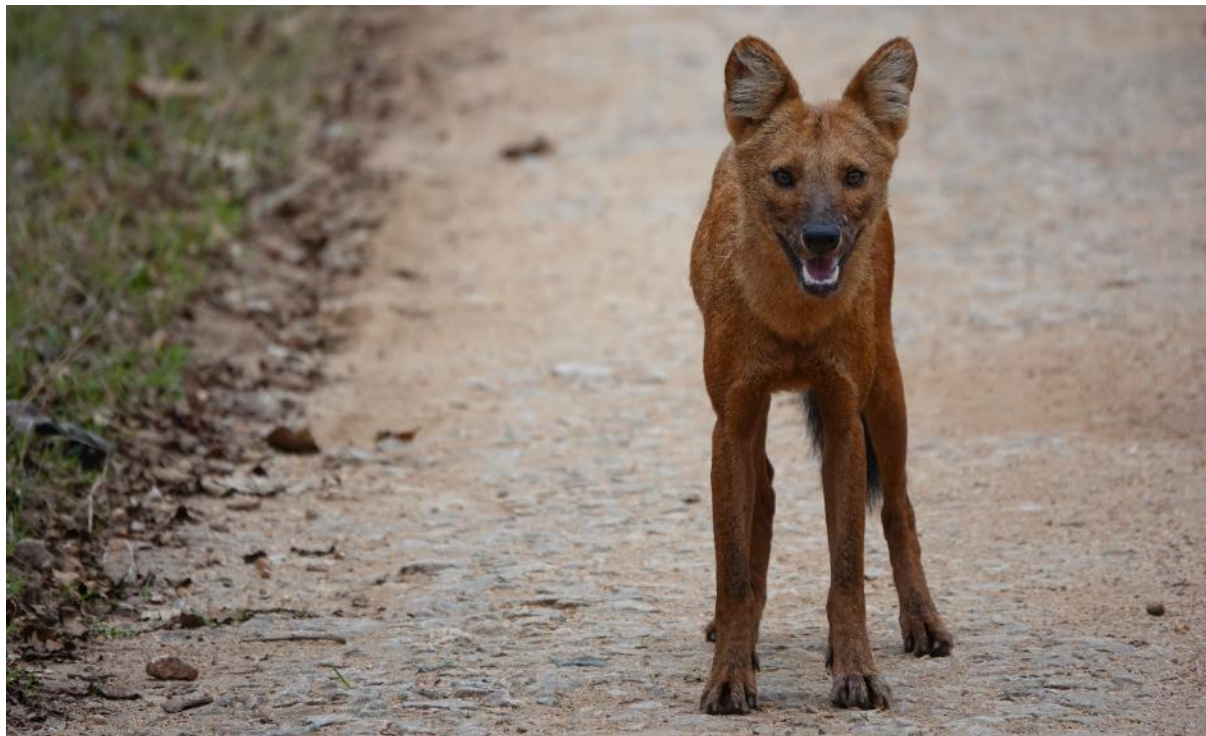
One of several Dhole (Indian Wild Dog) we encountered during our time in Nagarahole NP

From Mysore, it was a short drive (by Indian standards) to our base for the next four nights at Kabini, situated adjacent to the excellent Nagarahole National Park. It proved to be another fantastic stay at Kabini, with jeep safaris each day in Nagarahole and a very pleasant boat trip on the Kabini Reservoir. Highlights were many and varied but included Sloth Bear, Malabar Pied Hornbill, Malabar Trogon, Brown Fish-Owl, numerous Asian Elephants, several encounters with Dhole, Smooth-coated Otters, Blue-faced Malkoha, Blue-bearded Bee-eater, excellent looks at three species of vultures, Indian Spotted Eagle, White-bellied Woodpecker, Indian Nuthatch, and Mottled Wood-Owl at our accommodation.