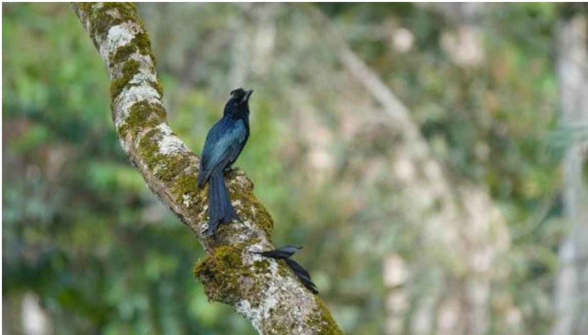
Greater Racket-tailed Drongo is a common but no less spectacular feature of the forests in Southern India