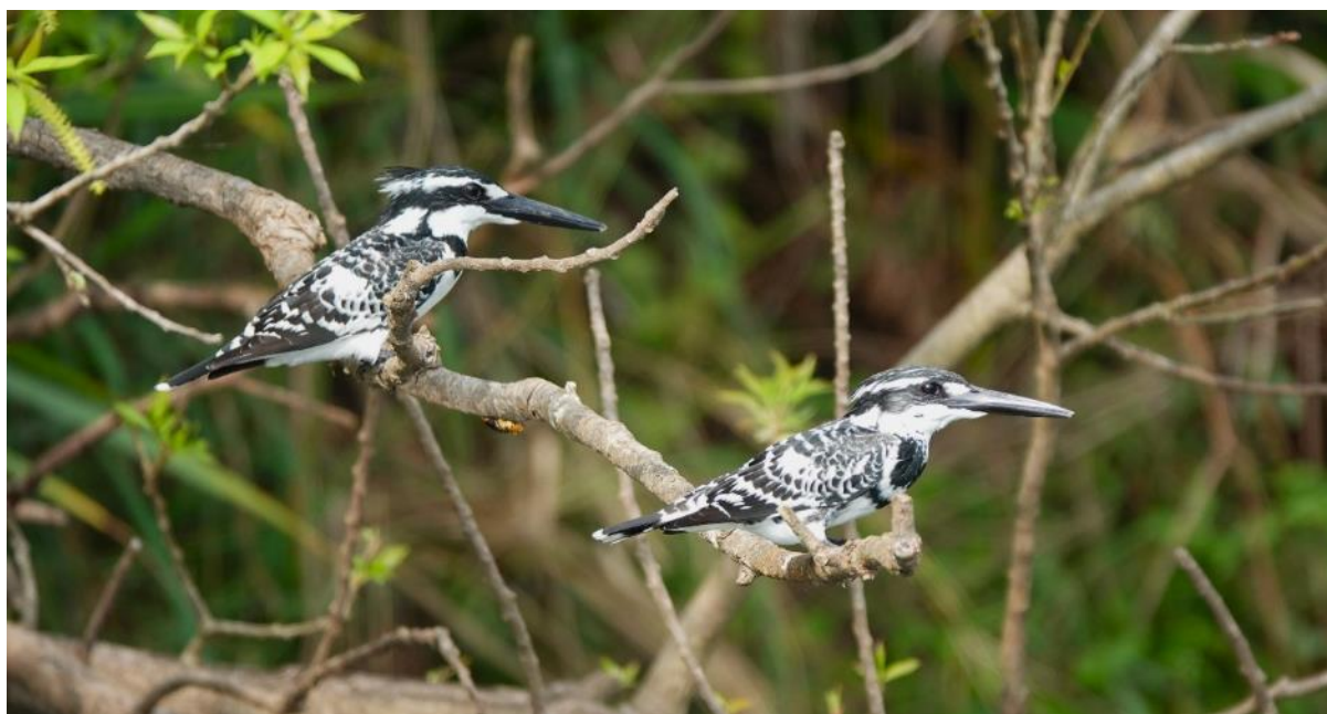
A nesting pair of Pied Kingfisher from Ranganathittu near Mysore