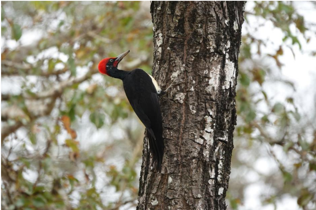
White-bellied Woodpecker showed especially well in Nagarahole NP this year