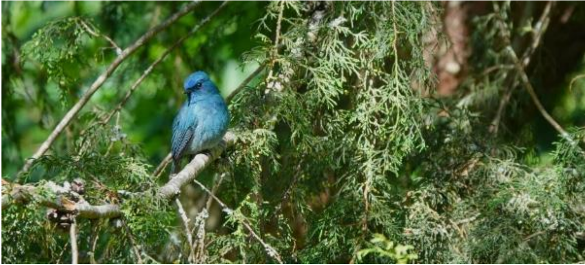
A gorgeous Nilgiri Flycatcher in the Ooty Botanical Gardens