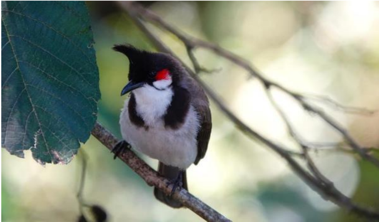
Red-whiskered Bulbul was seen every day of the trip © Max Breckenridge