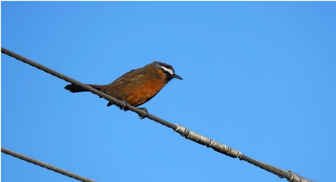
Nilgiri Laughingthrush were seen very well on a beautiful morning in Ooty

The cooler climes of Ooty beckoned, and we happily obliged, with some wonderful birding here based out of the excellent Savoy Hotel for two nights. The scarce and highly localized Nilgiri Sholakili was practically our first bird during our full day around town. The gorgeous Black-and-orange Flycatcher, Nilgiri Laughingthrush, and Nilgiri Wood-Pigeon all proved remarkably confiding this year. We also did well with the warblers—locating Greenish, Tickell’s, Tytler’s, Large-billed, and even Western Crowned Warbler—all wintering here from northern parts of India and Central Asia.