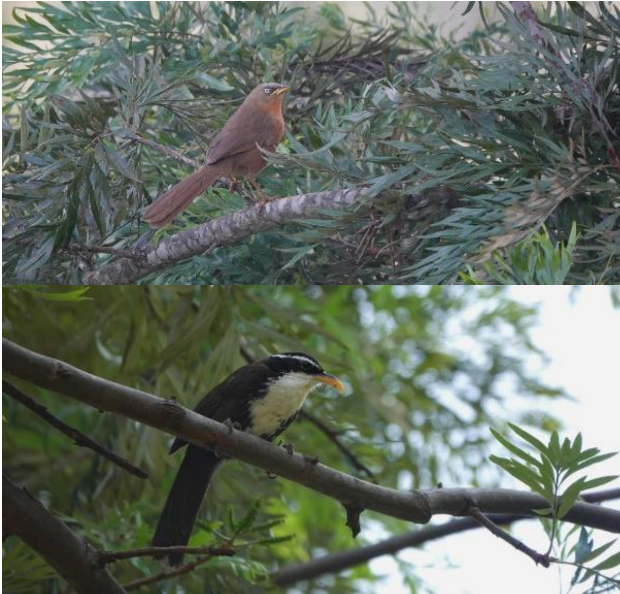
Rufous Babbler (above) and Indian Scimitar-Babbler (below) both showed well this year