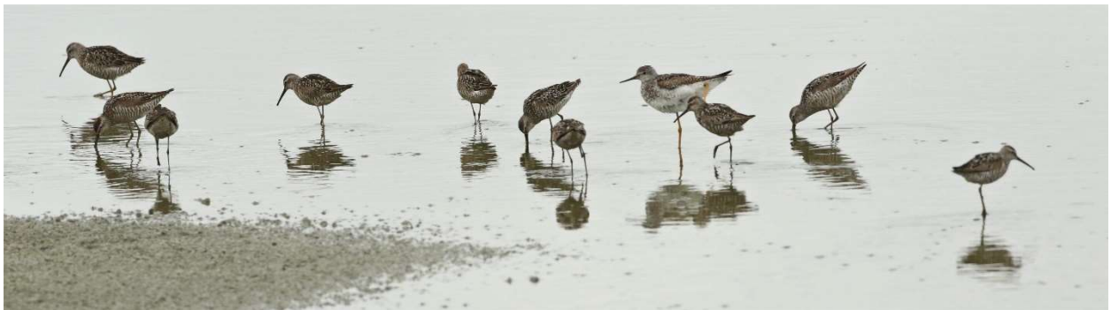
Stilt Sandpipers and a Lesser Yellowlegs at Willcox after the rain

Our final morning dawned overcast with an ominous forecast. I was hoping we could round up a Red-faced Warbler before the skies opened up with much-needed rain. It wasn't to be, and our entire journey up and over the mountains and out to Willcox was in the rain.