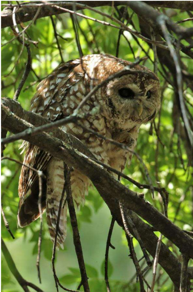
Adult Spotted Owl keeping a watchful, if rather somnolent eye, on the fledgling