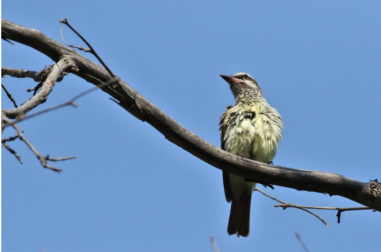
Sulphur-bellied Flycatcher in Cave Creek Canyon