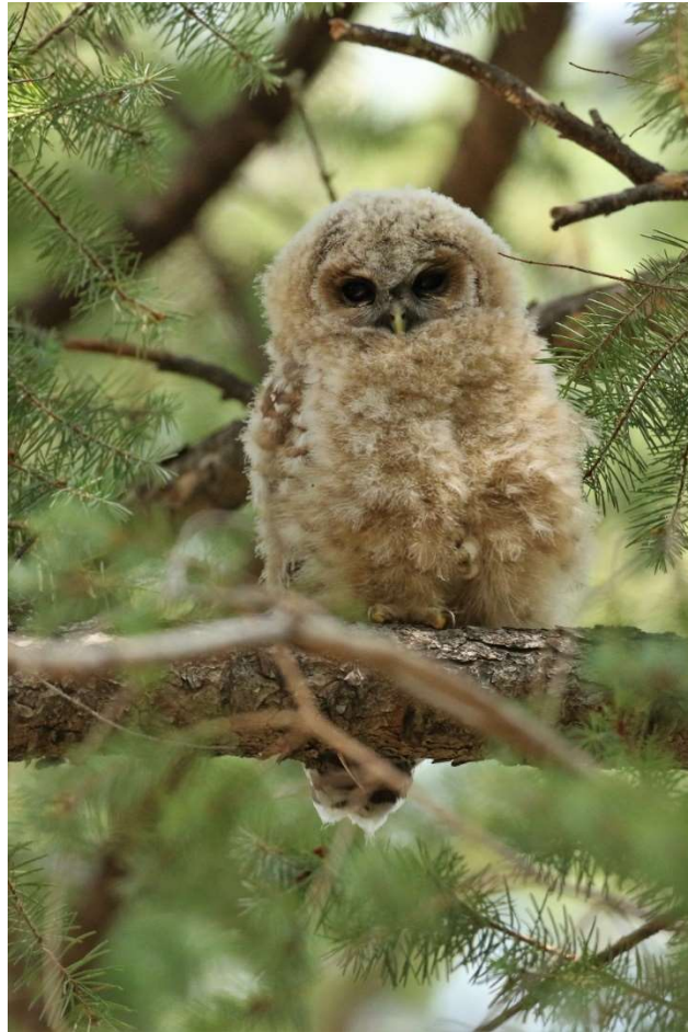
Owl fledgling that led our group to christen the Spotted Owl as the bird of the trip

LEADERS: BRIAN GIBBONS & GLENN KLINGLER LIST COMPILED BY: BRIAN GIBBONS