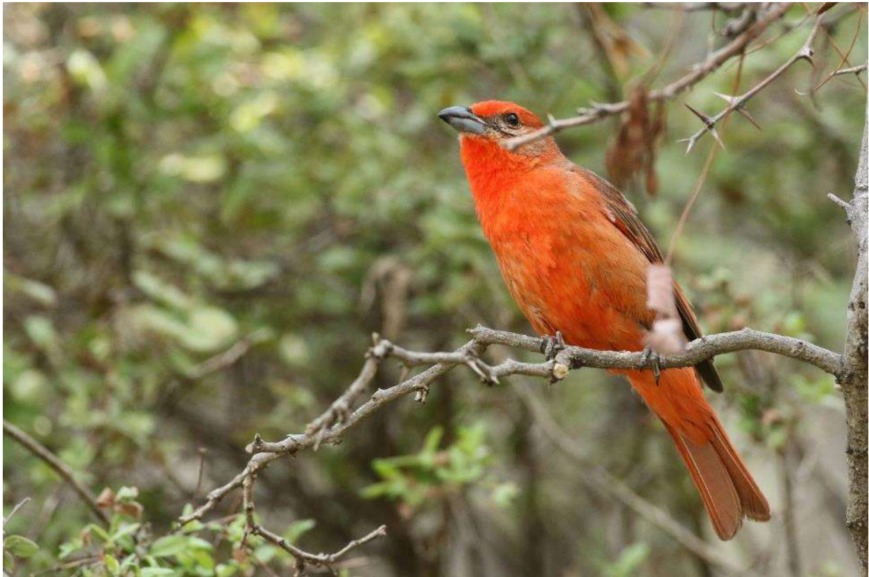
Male Hepatic Tanager that entertained us along the road

Blue Grosbeak, and Ash-throated Flycatcher. Our sojourn through the grasslands farther south failed to turn up the hoped-for Burrowing Owl. Amazingly, the Sky Island Grill patio hosted a nesting Roadrunner, tucked in above the I-beams! In the afternoon we returned to the cool oak canyons to take in some feeder activity. The local Blue-throat was a little too aggressive to allow great studies of the rare Violet-crowned Hummingbird, but we saw it!