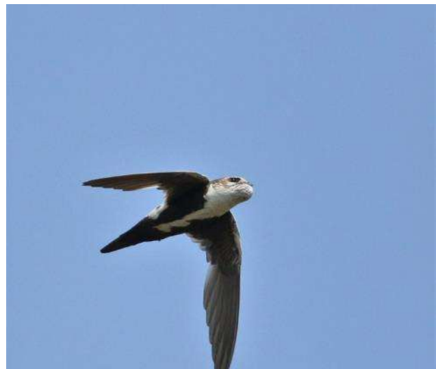
White-throated Swift carrying an insect bolus for feeding nestlings

Painted Redstart, Scott's Oriole, Mexican Jay, and others. We then wound our way up the mountain and over Onion Saddle, where we watched White-throated Swifts and Violet-green Swallows swooping up insects to feed their young. We then descended to Pinery Canyon, where among the pine Douglas Fir and oaks we found a somnolent Spotted Owl adult that seemed to keep one eye on a fuzzball fledgling that was nearby. This sighting, voted the bird of the tour—a range-restricted species that we were able to study at length in the scope—was indeed very rewarding. We met Jackie, our caterer in Barfoot Park where we enjoyed the weather and lunch before abandoning our picnic tables in the pursuit of Mexican