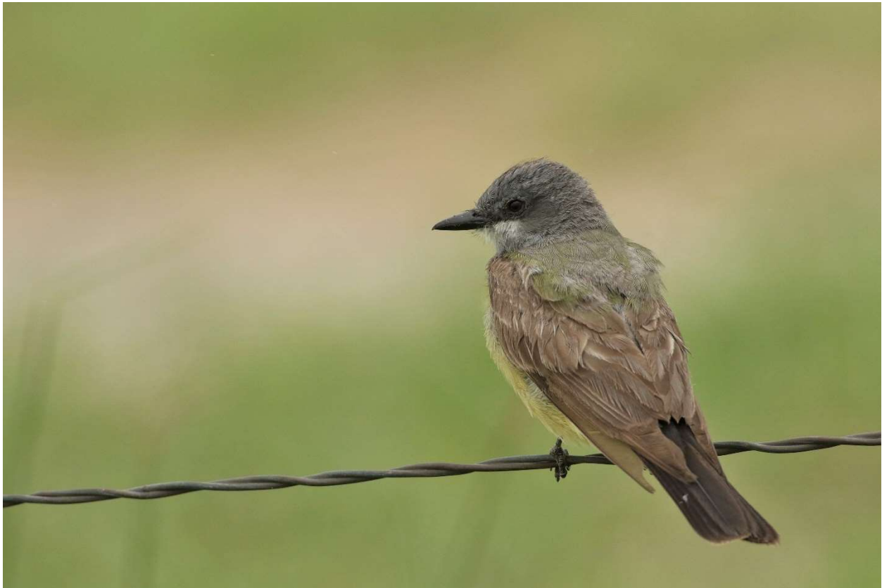
Cassin's Kingbird in Willcox, after the rain

Fortunately, the rain stopped, and we enjoyed good bird activity around the golf course and ponds near Willcox. Shorebirds were plentiful, and land birds were out and about after the rain. Scaled Quail, a transient Black Tern, Mexican Duck, Baird's and Stilt sandpipers, Cassin's Kingbird, Eastern Meadowlark, Ruddy Ducks, and a few American Coots rounded out our list for the week.