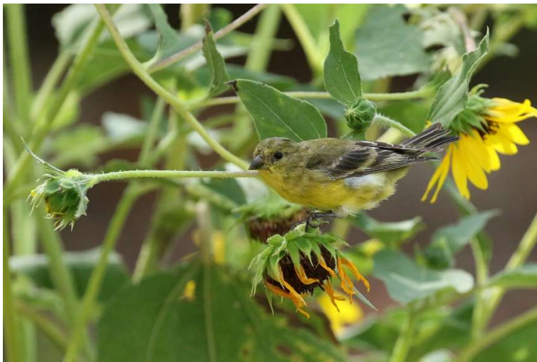
Lesser Goldfinch feeding on sunflower

displays of native animals. Zebra-tailed Lizard, Hooded Orioles, and Phainopeplas all brightened our visit to the museum. After being thoroughly steamed for a couple of hours while meandering through the Saguaros and newly greened desert courtesy of the record monsoons, we headed to lunch and east to the Chiricahua Mountains.