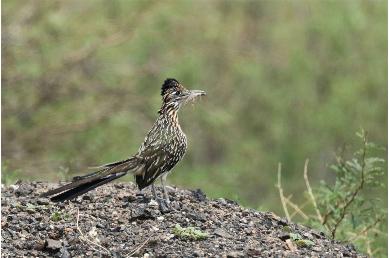
Greater Roadrunner with a lizard snack near Rodeo, New Mexico

good comparisons. Hooded Oriole, Cactus Wren, Black-headed Grosbeak, and a few hummers were all easily seen in Dave's yard near Portal.