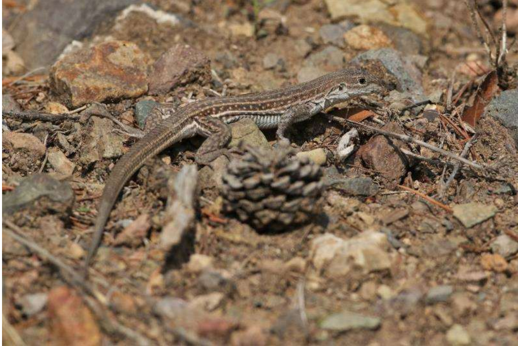
Chihuahuan Spotted Whiptails were seen scurrying in the woodland

common hummers were the stunning Broad-billed Hummingbird and the huge Blue-throated Mountain-gem. From our comfortable base at the Ranch in Cave Creek Canyon we ranged into the desert and grasslands below Portal and into the heart of the oak canyons and pine and fir forest that host the birds for which the Chiricahuas are famous.