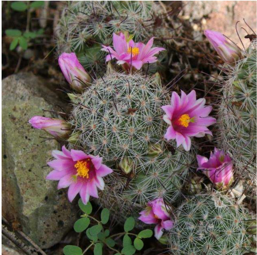
Mammillaria cactus were in bloom on the museum grounds in response to the ample summer rains.

We started our exploration of Southeast Arizona on a steamy morning. The rugged Tucson Mountains at Gate's Pass and the famous Arizona Sonora Desert Museum all came after an excellent breakfast at Snooze in Tucson. Before we made it to the Arizona Sonora Desert Museum, we cruised through Tucson Mountain Park and Ironwood Picnic Area to track down a few desert birds. While we encountered a few Gilded Flickers, they were flighty. Finally, in the museum, we found a few migrants and our hoped-for Costa's Hummingbird. The grounds of the museum integrate the natural surroundings beautifully into