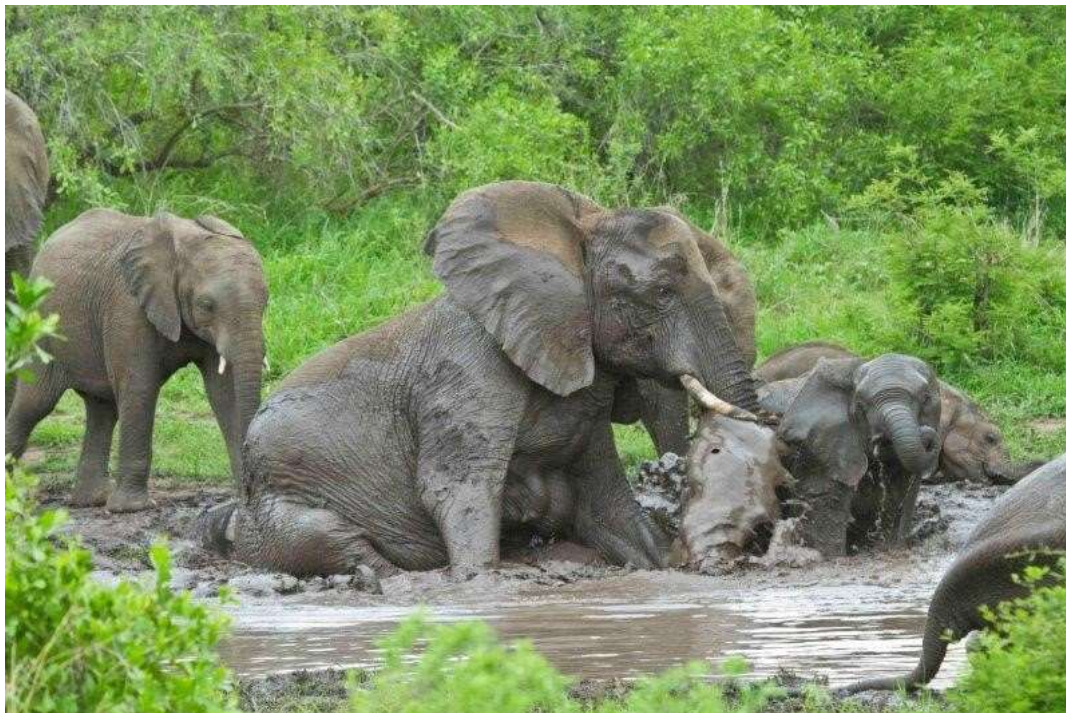
Elephants at waterhole

Mammals and birds will be present in large numbers, with African elephant, Cape buffalo, impala, greater kudu, and giraffe coming down to the water to drink in the late afternoon. Exposed sand banks will be good places to watch for hippopotamus and Nile crocodile as well as storks and herons.