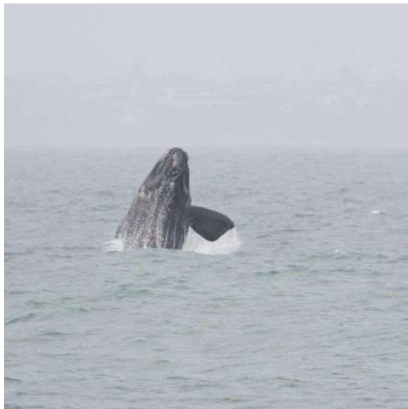
Southern right whale

We will spend a couple of hours motoring around the conservation area searching for cetaceans and other marine life. Obtaining close views of southern right whale is a goal of the endeavor, but we'll also hope for sightings of Bryde's whale, long-beaked common dolphin, and Cape fur seal.