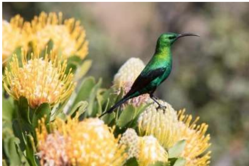
Malachite Sunbird

On the mammal front, we will search for the once critically endangered bontebok, an antelope similar in size to white-tailed deer, as well as eland, Africa's largest antelope. Chacma baboons are readily apparent as well. Marine mammals are represented by Cape fur seal at the Cape of Good Hope, and possibly a southern right whale or humpback whale, both of which are sometimes seen in False Bay or along the Atlantic coast beyond the outer reefs.