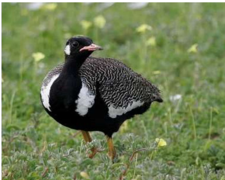
Black Bustard

At day’s end, we will check into our accommodation, the historic Farmhouse Hotel in Langebaan, with dinner at a restaurant overlooking the tidal lagoon.