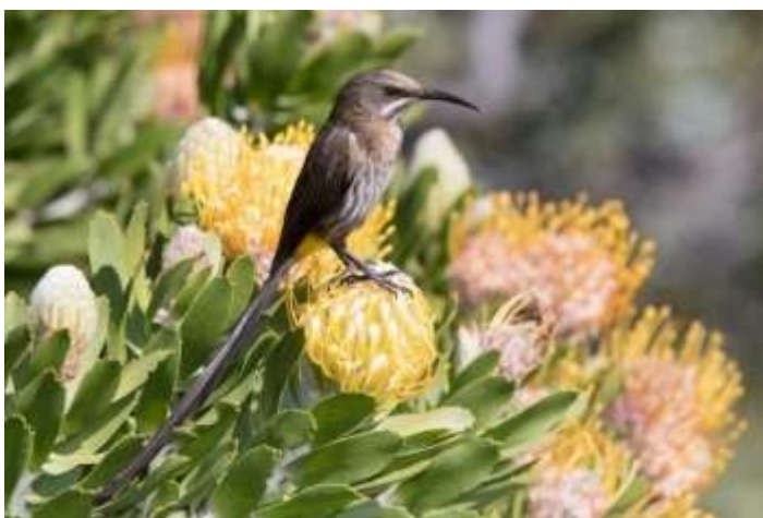
Cape Sugarbird

Returning to the lower cableway station, we will drive to the lookout point on Signal Hill below the towering peak of Lion's Head before visiting a number of cultural sites within the City Bowl, including the Malay Slave Quarter, Mount Nelson Hotel, St. Georges Cathedral, City Gardens, and the Castle before returning to the hotel at day's end.