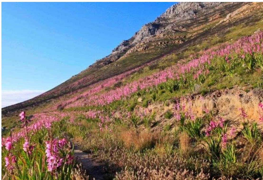
South Africa is famous for its springtime floral abundance

After an early breakfast and check-out from the hotel, we'll travel north to the national park along a route that parallels the coastline. Upon arrival, we'll head to a restricted area of the park known for its abundant floral splendor. Our time of arrival is scheduled to coincide with the best time of the day to enjoy the floral displays around us. We'll have a picnic lunch in the field to maximize our time for viewing and photography.