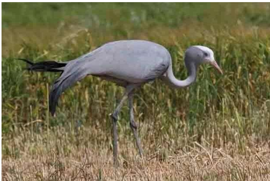
The elegant Blue Crane

Following a mid-morning check-out—and a final round of shopping for those so inclined—we will head out over the Franschhoek Pass and Villiersdorp Mountains for the Bot River. A goal for the morning is to spot the elegant Blue Crane. Once in serious decline due to excessive pesticide use by the farming community, the crane population in the Bot River valley is on the rise again, thanks to a focused conservation-orientated program that promotes the responsible use of pesticides and herbicides within the agricultural sector.