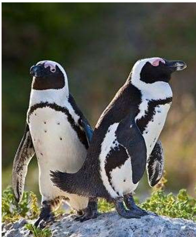
African Penguins