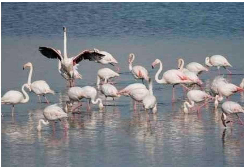
Greater Flamingos

Water levels between the pans fluctuate continuously, with exposed sand banks providing day roosts and feeding sites for a variety of shorebirds and gull species as well as pelicans and the occasional stork. Waterbirds we typically would expect to see include African (Black) Oystercatcher, Blacksmith Lapwing, Kittlitz's and Three-banded Plovers, Ruff, Little Stint and Common Greenshank, Gray-hooded and Hartlaub's Gulls, Great White Pelican, and flocks of Kelp Gull and Sacred Ibis circling about.