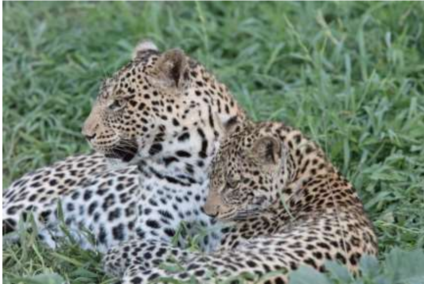
Leopard with cub

Back at Skukuza, we will transfer overland to Notten's Bush Camp, situated in the heart of the Sabi Sand Conservancy, arriving in time for a late lunch ahead of an afternoon game drive. Riding in an open 4x4 safari vehicle in the company of a tracker and a ranger, we will go into the bush, now with rhinoceros and leopard high on our "wish list."