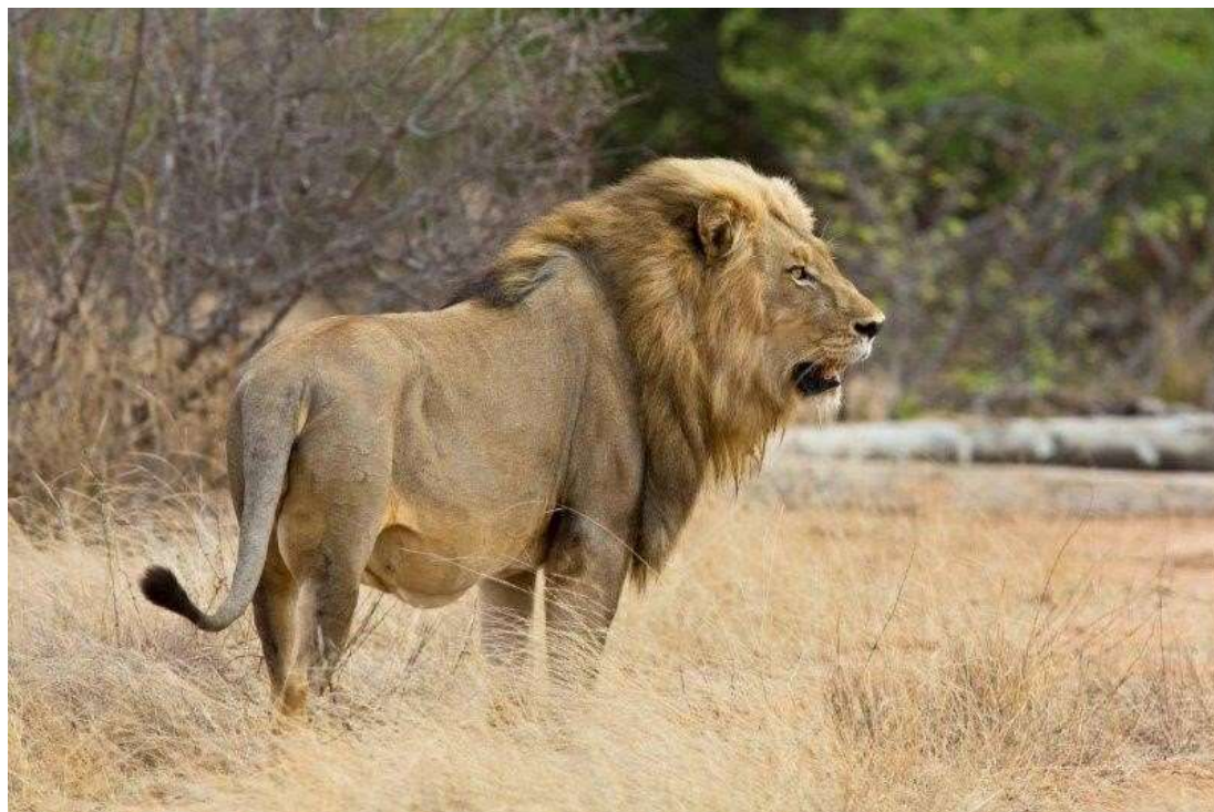
Male lion, Greater Kruger Conservancy Area

Nelson Mandela spent 27 years in imprisonment; and a tour of Cape Town's historic City Bowl. As one would expect, birdwatching and wildlife-viewing are paramount in importance, and beyond our natural history successes in Cape Town, we'll strike gold in Kruger. Three days in the Greater Kruger Conservancy area include safari-style game drives that will yield sightings of most of the iconic animals we most closely identify with wild Africa including lion, cheetah, leopard, rhinoceros, elephant, and Cape buffalo, along with a fascinating assortment of birds large and small, from Ostrich and Martial Eagle to an array of waterfowl, cranes, storks and more. Our trip concludes with a grand finale visit to the Apartheid Museum in Johannesburg and a tour of Soweto township.