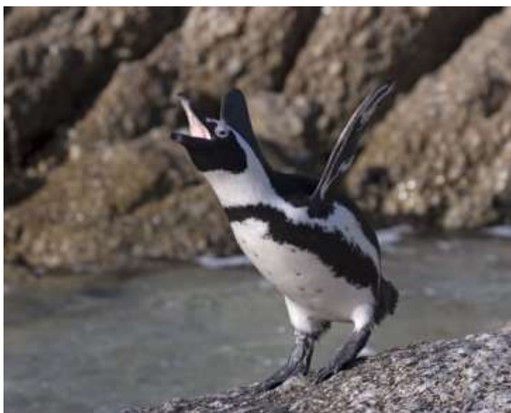
African Penguin

Lunch will be at a restaurant overlooking the naval complex. Afterward we'll pay a visit to the quiet and less tourist-oriented section of the Boulders Coastal Park to view African Penguins coming ashore and preening themselves meticulously before making their way to the breeding area within the rookery. Here, we will walk along the main boardwalk and nearby Burgher's Walk to obtain close-up views of these endearing and now highly endangered penguins. Once much more numerous, this species