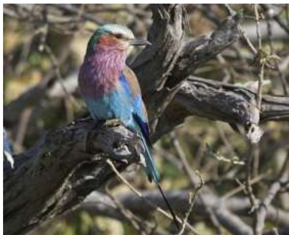
Lilac-breasted Roller

Birds are super-abundant throughout the Kruger area, and we can expect to see a variety of spectacular birds of prey including Bateleur, Wahlberg’s Eagle, Martial Eagle, African Hawk-Eagle, and African Fish-Eagle in addition to Southern Ground-Hornbill, Southern Red-billed and Southern Yellow-billed Hornbills, Saddle-billed and Yellow-billed Storks, Goliath and Gray Herons, Pied and Malachite Kingfishers, Lilac-breasted Roller, Burchell’s and Greater Blue-eared Starlings, and many more bright and colorful birds.