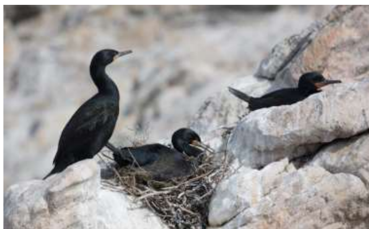
Nesting Cape Cormorants

After lunch at a restaurant overlooking the harbor, we will visit a variety of locations in an attempt to see a suite of rare and localized birds. We will visit the Harold Porter National Botanical Garden at Betty's Bay. Situated directly below the coastal mountains rising above, this well-maintained and compact botanical garden is home to a variety of localized bird species found in relict native forest. Rameron (African Olive) Pigeon, Cape Batis, Fork-tailed Drongo, African Paradise-Flycatcher, African-brown (African Dusky) Flycatcher, Cape Rock-Thrush, Cape Bulbul, Malachite and Southern Double-collared Sunbirds, Brimstone and Cape Canaries, Cape Siskin, and Sweet Waxbill all occur here.