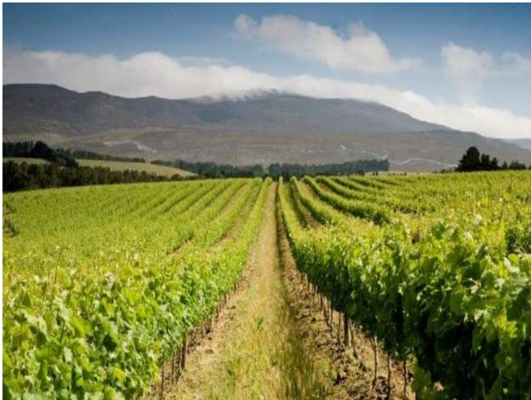
A vineyard in the Stellenbosch region

September 17, Day 9: A Day in the Winelands of Stellenbosch and the Franschhoek Valley. Today we will take our leave of Cape Town and head inland to the scenic university town of Stellenbosch, situated in the very heart of the winelands for which South Africa is so well known. The focus for the day will be on culture and the historical past, dating to the mid-seventeenth century, with enough time to explore the shops and arcades at leisure.