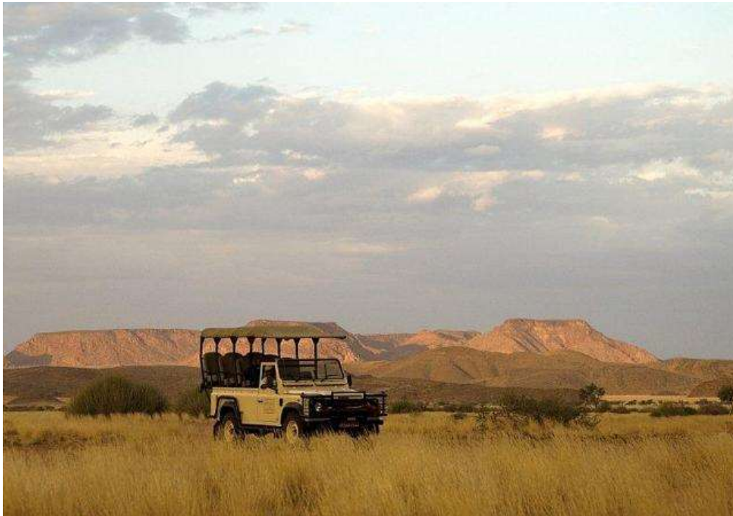
On safari in the bush

As the sun sets above the distant Drakensberg Mountains, we will pause to take in the splendor of the moment with a refreshment and a snack in hand before working our way back to camp by spotlight, scanning the surrounding woodland for nocturnal mammals and birds such as jackal, hyena, nightjars and owls.