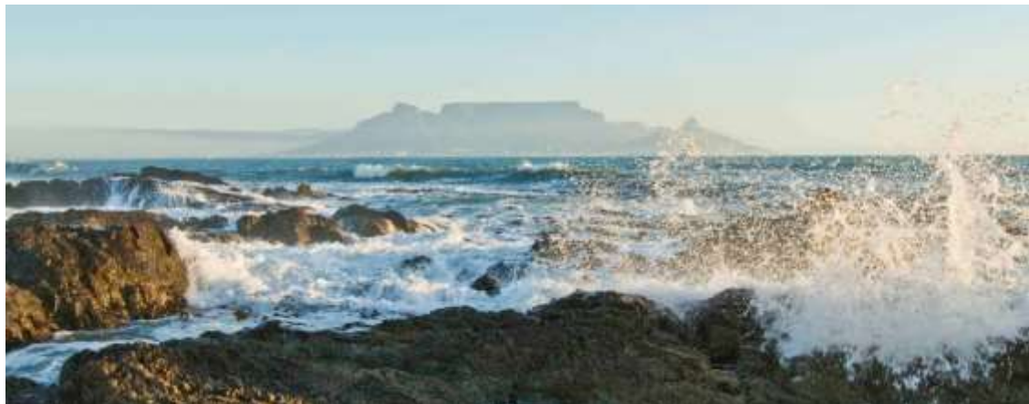
False Bay with Table Mountain in the distance

Our route now follows the False Bay coastline north by northwest, back toward Cape Town, providing scenic views over the bay toward Table Mountain far in the distance to the west. Our destination is a hotel next to the international airport, where we will have dinner and spend the night.