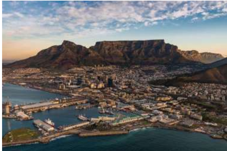
Cape Town and Table Mountain

The isolated and scenically iconic block of sandstone that forms Table Mountain is one of the natural wonders of the world. Towering more than 3,000 feet above the city, the mountain is visible on a clear day from 60 miles away. The views in all directions are impressive as we wander about the labyrinth of well-marked trails in search of crag lizards and rock hyrax—the latter a mammal similar in appearance to the marmot family of North America. The diversity of birds is limited atop Table Mountain; nevertheless, our exploration of the summit area could produce sightings of Peregrine Falcon, Rock Kestrel, Sentinel Rock Thrush, Familiar Chat, Orange-breasted Sunbird, Red-winged Starling, and Cape Bunting.