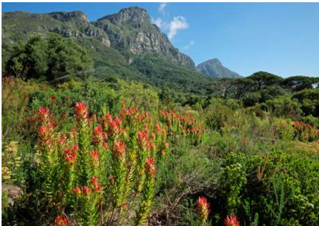
Kirstenbosch National Botanical Garden

The garden is especially famous for its collection of plants from the Cape floral kingdom. Known in botanical terms as the fynbos , the name is of Dutch origin and literally means fine-leaved flora, due to the small leathery leaves that characterize members of this kingdom, an adaptation that renders plants capable of withstanding the hot and dry austral summer and gale force winds that blow relentlessly across the Cape Peninsula at that time of the year.