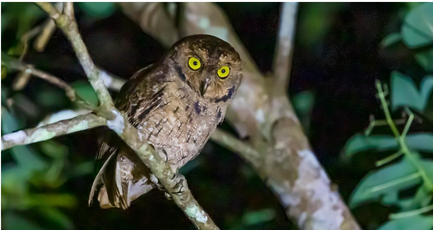
The Seychelles Scops Owl

We will have lunch in the best Creole restaurant on the island: Marie Antoinette . The restaurant was named after the last Queen of France, who presumably visited the restaurant centuries ago. The restaurant building is now a national monument.