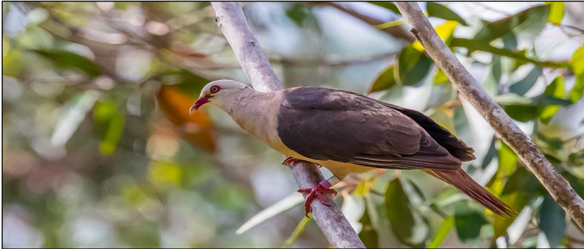
One of the world's rarest pigeons, the Pink Pigeon

NIGHT: Villa Caroline, Flic en Flac, Mauritius