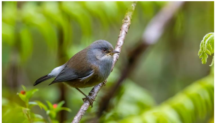
Reunion Gray White-eye

September 24, Days 14: Round Island boat excursion; afternoon flight to Reunion. In the morning, we board our private charter to set sails for Round Island and Serpent Island. These two small tropical islands off the coast of Mauritius have an enigmatic population of Pterodroma petrels, known as 'Round Island Petrels.' These petrels have been a source of much taxonomic confusion, with several different color morphs first identified as Trindade Petrels. Still, current studies show that the population is a mixed hybridizing group with at least two additional species, the interesting Kermadec and Herald Petrels. We will spend most of the day studying the birds before returning to our hotel then transfer to the airport where we will take a short flight to Reunion.