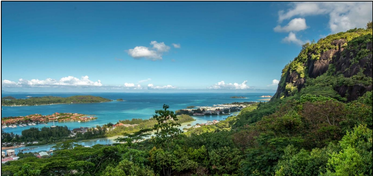
The tropical scenery of Mahe Island

This very first venture of VENT to Seychelles and the Mascarene Islands in the Indian Ocean promises to bring the very best these tiny Indian Ocean islands have to offer. Birding in this earthly paradise is nothing but spectacular and mind-boggling. We visit four different countries, each of them holding a treasure full of avifaunal and mammalian delights. These islands have been isolated for millions of years since breaking away from the African and Indian continents, developing a unique flora and fauna, bountiful with endemism wherever we go.