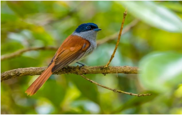
The Mascarene Paradise-Flycatcher

September 22-23, Days 12-13: Black River Gorges National Park. Our next two full days on Mauritius prove to be spectacular with a fresh bunch of endemics waiting for us. We are after the elusive Pink Pigeon, Echo Parakeet, and Mauritius Kestrel. They are mostly quickly found, albeit they are amongst the rarest birds on the globe. All three are pleasingly looking, but the Pink Pigeon is probably the most attractive one with a pale pinkish head, neck, and breast plus a broad russet tail to finish it off. The remaining set of endemics will need some work. We are after Mauritius Cuckooshrike, Mauritius Bulbul, Mascarene Paradise-Flycatcher, Mauritius Gray White-eye, Mauritius Olive White-eye, and Mauritius Fody. Most of them are still declining, especially the Olive White-eye is struck by the