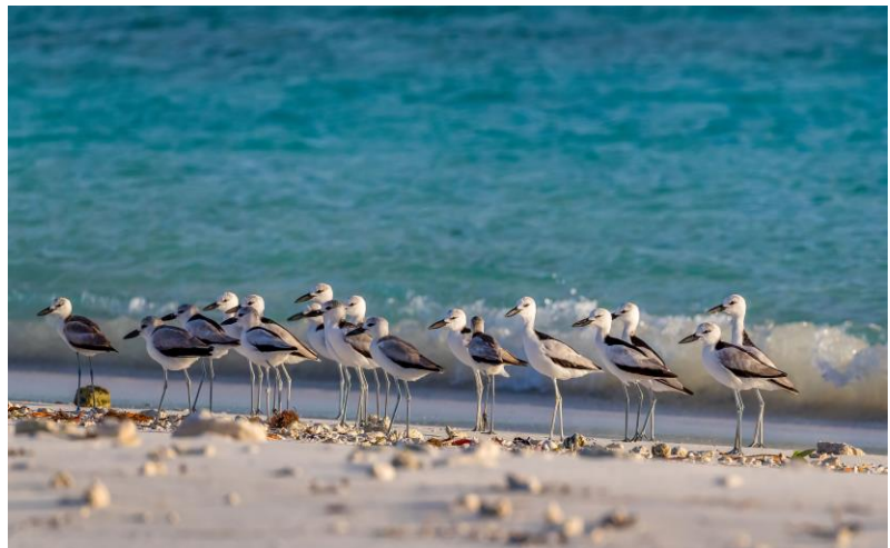
Small group of migrating Crab Plovers are found on Bird Island © B. Stenhenson. Eco-vista

In the evening, the Sooty terns return from foraging on the sea, and we will be standing between thousands of attractive black-and-white terns that pass us closely. On the beach, we search for Lesser and Greater Sand Plovers, Whimbrel, Great Crested Tern, and, if lucky, a few Saunders's Tern. In the air, Greater and Lesser Frigatebirds are patrolling. In the forest, we will find the nests of White Tern and White-tailed Tropicbirds, a spectacular sight.