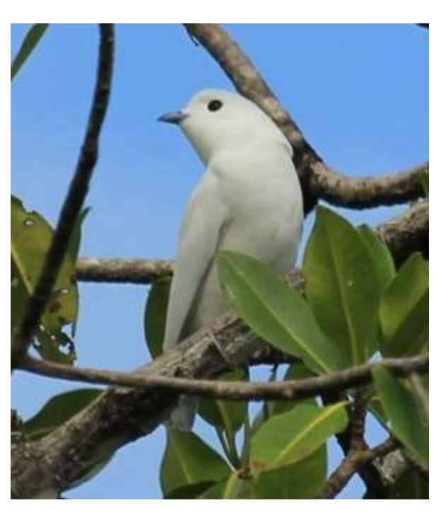
Snowy Cotinga

NIGHT: Tranquilo Bay Eco Adventure Lodge, Isla Bastimentos