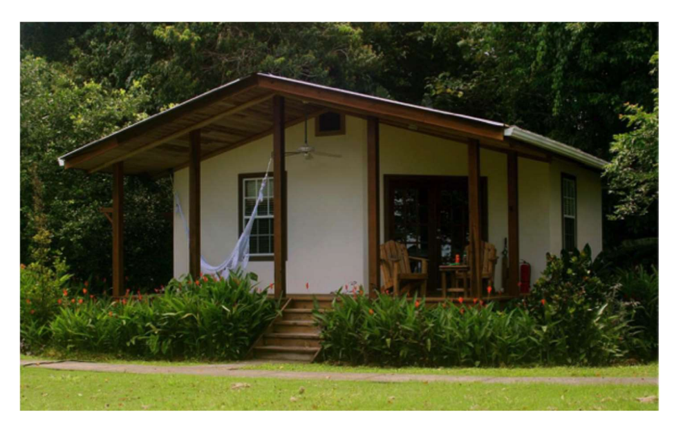
One of four cabanas near the open field and six-story tall observation tower

March 27, Day 2: Flight to Bocas del Toro on Isla Colón; Transfer to Tranquilo Bay Eco Adventure Lodge. We will take an early flight to Bocas del Toro on Isla Colón and transfer to Isla Bastimentos by motorboat. Upon arrival at Tranquilo Bay Eco Adventure Lodge, we'll enjoy a delicious breakfast in the main lodge, be shown to our cabanas, and be given time to unpack.