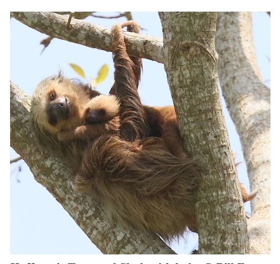
Hoffman's Two-toed Sloth with baby

March 31, Day 6: Return to Punta Robalo and Oleoducto Road. Today we will visit any areas that we did not get to on Day 3 and revisit some of the best areas we did visit to look for endemic and specialty birds that we