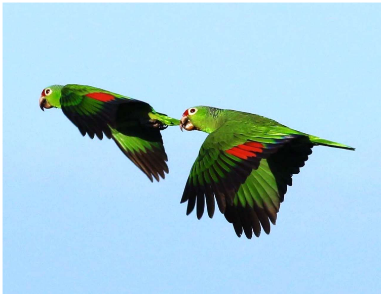
Red-lored Parrots from tower

Every evening, a half-hour before our three to four course dinner, we will meet in the main lodge to enjoy hors d'oeuvres and fresh fruit juices, sodas, ice water or open bar beer, wine or mixed drinks. The hors d'oeuvres are different every night we are there. After dinner, we complete the day's checklist and head to our cabanas, hoping to encounter an owl or night mammal along the way.