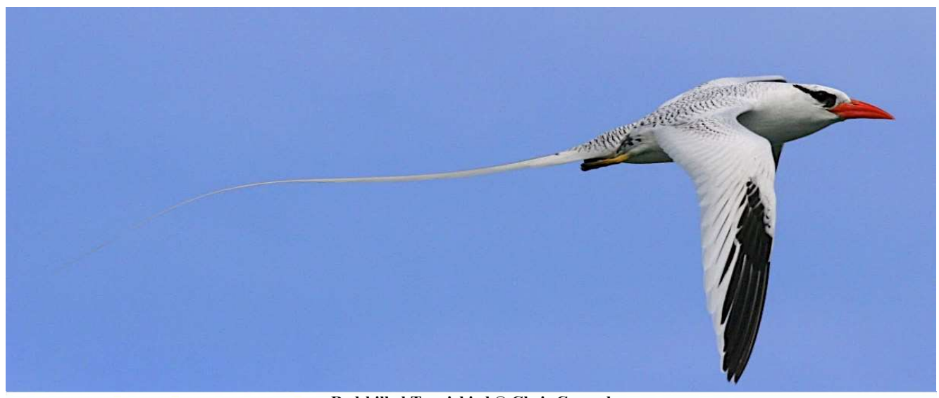
Red-billed Tropicbird