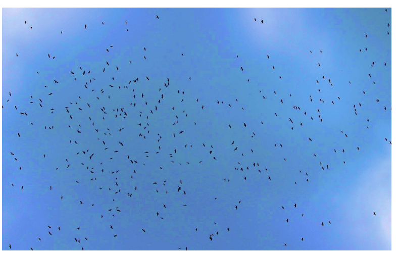
Raptor -filled sky in migration