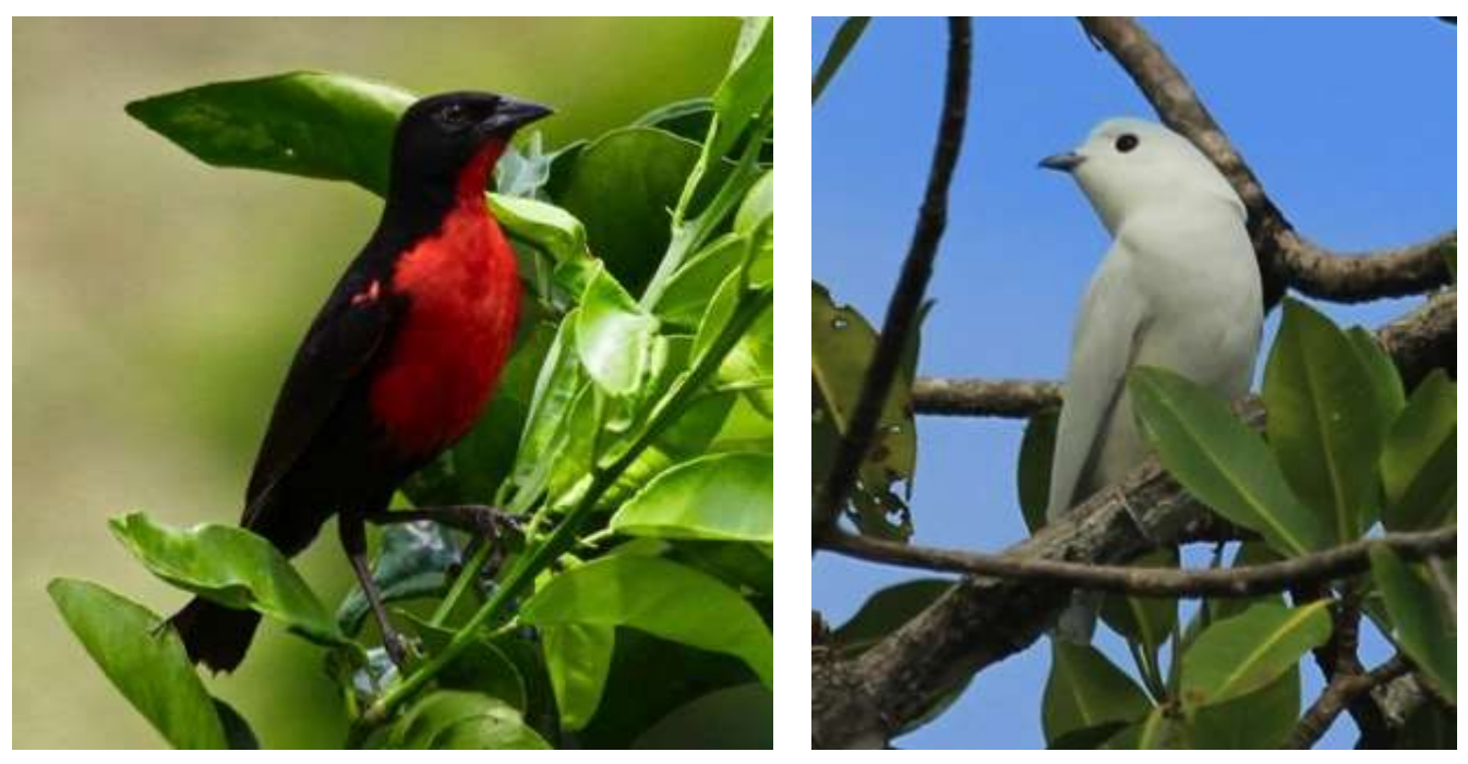
Red-breasted Blackbird

March 31, Day 7: Almirante to Valle Risco, La Gloria, and Junquito. After an early breakfast, we will travel by motorboat to Almirante. This is one of the main banana-exporting towns and is surrounded by huge banana plantations, some of which we will drive past on our way to the first major stop on an unpaved side road to Valle Risco. This road gets almost no traffic and provides wonderful views of the hillside and valley below us. An out-of-range Green Thorntail was found here in 2014. We will bird this downhill road until almost noon and then drive to an overlook with a roof and chairs to enjoy our picnic lunch. After lunch we will bird a little used side road to La Gloria and then another to Junquito. We will be on the lookout for both Great and Little tinamous, Black Hawk-Eagle, Great Antshrike, and Red-breasted Blackbird.