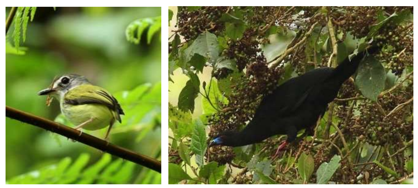
Black-capped Pygmy-Tyrant