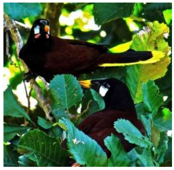
Montezuma Oropendolas