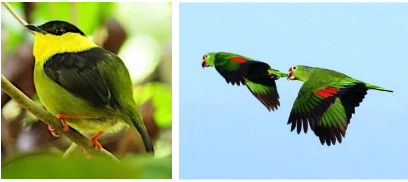
Golden-collared Manakin

Golden-collared Manakin lek and one forest trail leads to a pool where one can sit on benches and watch birds come to bathe. We will plan to be up on the deck of the six-story high observation tower near our cabanas by 5:00 p.m. this afternoon. This structure provides us with a view of the treetops in the surrounding forest as well as the mangroves and Caribbean Sea. Small birds feeding in the canopy of adjacent tall trees are much easier to see from up here. Some of the Red-lored Parrots going to roost often fly so close we could almost touch them.