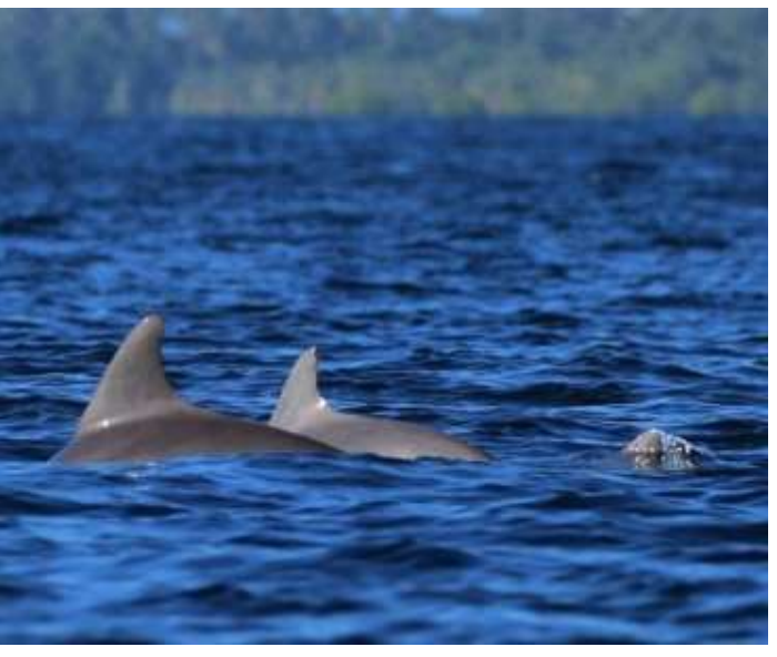
Bottlenose Dolphins

Golden-collared Manakin lek and one forest trail leads to a pool where one can sit on benches and watch birds come to bathe. We will plan to be up on the deck of the six-story high observation tower near our cabanas by 5:00 p.m. this afternoon. This structure provides us with a view of the treetops in the surrounding forest as well as the mangroves and Caribbean Sea. Small birds feeding in the canopy of adjacent tall trees are much easier to see from up here. Some of the Red-lored Parrots going to roost often fly so close we could almost touch them.