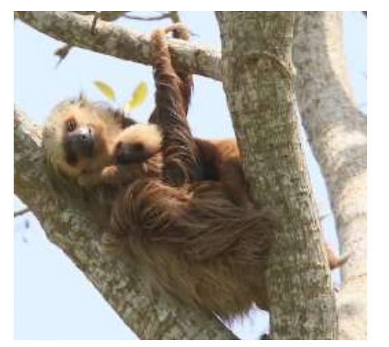
Hoffman's Two-toed Sloth with baby

March 30, Day 6: Return to Punta Robalo and Oleoducto Road. Today we will visit any areas that we did not get to on Day 3 and revisit some of the best areas we did visit to look for endemic and specialty birds that we