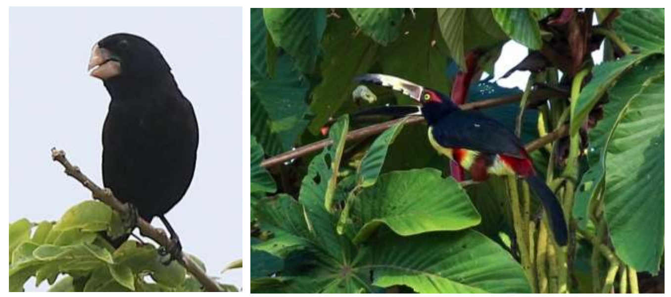
Nicaraguan Seed-Finch