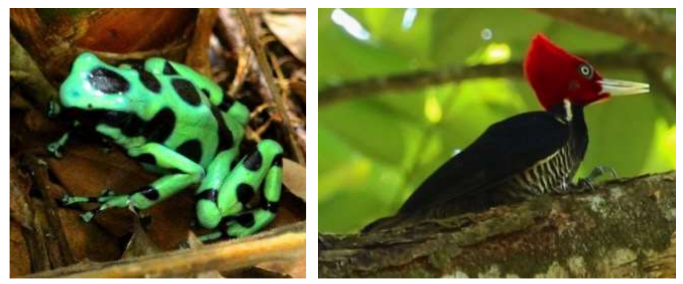
Green-and-black Poison Dart Frog

offering great birding potential. The overstory trees that shade the cacao trees are very tall and old, creating great habitat for birds like large woodpeckers, trogons, jays, oropendolas, orioles, etc. We should have time to visit the chocolate factory and an opportunity to purchase some of their wonderful chocolate. This is the best location to photograph the Green-and-black Poison Dart Frog.