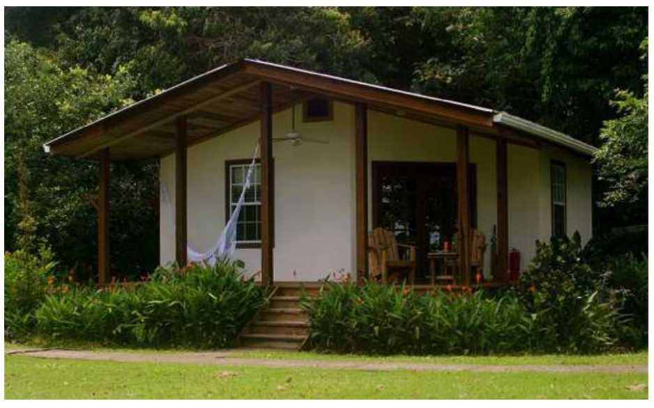
One of four cabanas near the open field and six-story tall observation tower

We will take an early flight to Bocas del Toro on Isla Colón and transfer to Isla Bastimentos by motorboat. Upon arrival at Tranquilo Bay Eco Adventure Lodge, we'll enjoy a delicious breakfast in the main lodge, be shown to our cabanas, and be given time to unpack.