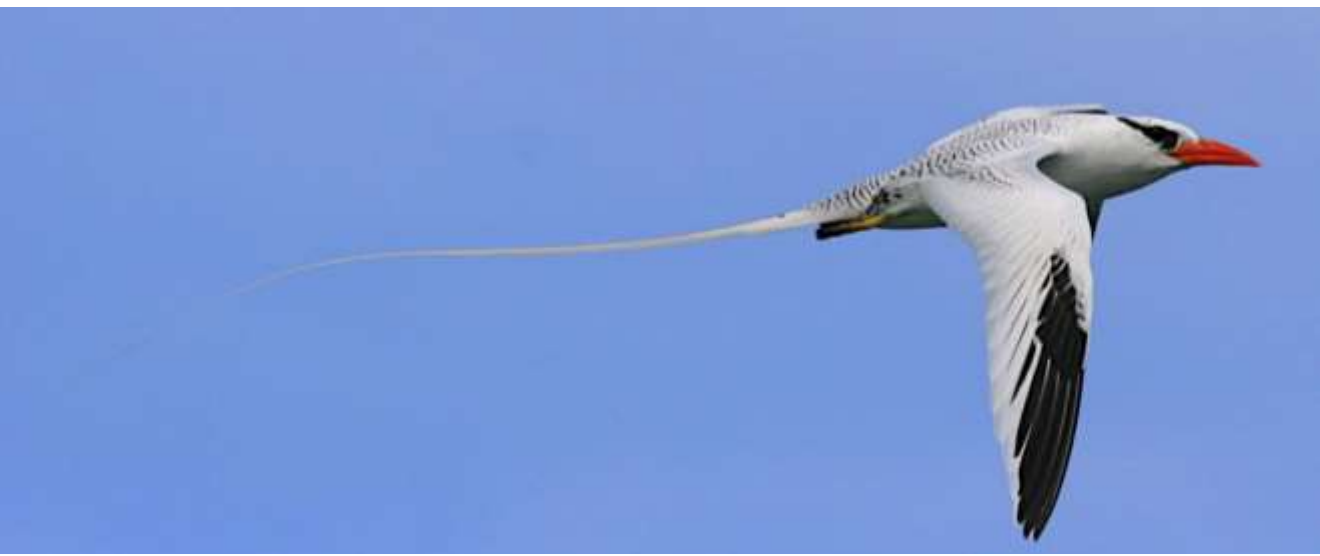
NIGHT: Tranquilo Bay Eco Adventure Lodge, Isla Bastimentos

As we exit Soropta Canal in mid-afternoon, we will go directly to Swan's Cay, a tiny, picturesque island 1.6 km off the north coast of Isla Colón. Small alcoves and crevices provide nesting habitat between September and March for Brown Boobies and 50-75 pairs of Red-billed Tropicbirds. We cannot land on Swan's Cay, but will circle the area to see the spectacular Red-billed Tropicbirds with their long tails swaying in the breeze as they fly past us.