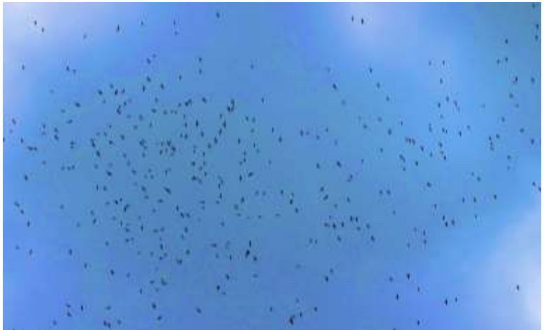
Raptor -filled sky in migration

missed. One of the great highlights on our visits to this road has been the Swallow-tailed Kites and thousands of migrating Swainson's Hawks and fewer Broad-winged Hawks and Turkey Vultures. On at least one of the visits