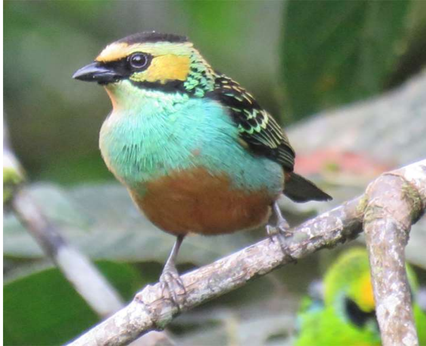
Golden-eared Tanager (Wildsumaco Lodge)

This tour is one in our series of Relaxed & Easy (R&E) tours. These tours are appropriate for participants who want a slower paced tour, with somewhat fewer hours in the field and light physical activity. They are ideal for persons who prefer a somewhat later start in the morning (typically 7:00 a.m.), a break after lunch and a shorter afternoon outing. They involve only short walks, usually not more than a half mile, and avoid difficult terrain.