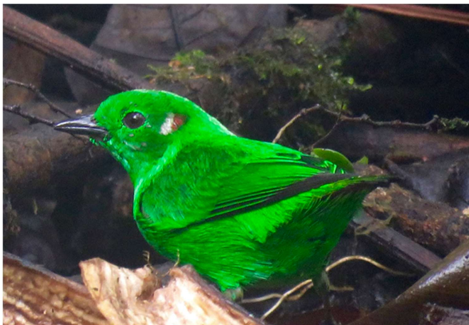
Glistening-green Tanager

March 20, Day 10: Departure for Home. A transfer will be provided to the Quito Airport in time for all departures.