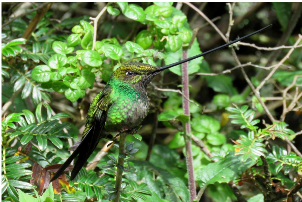
Sword-billed Hummingbird

Sunbeam are all possible here as are Andean Guan; and Scarlet-bellied, Hooded and Black-chested mountain-tanagers—all seeable at point-blank! We may want to enjoy our field-lunch here (depending on the weather and timing); we will then depart and continue on our way downslope along the Paseo del Quinde EcoRoute (translated as “Hummingbird Drive”), where we will make a key stop at Bellavista Cloud Forest Lodge, perched on a forested knife-sharp ridge that overlooks the beautiful Tandayapa Valley. Here, a battery of nectar feeders bring us face-to-face with yet another swarm of hummers, including Collared Inca; White-booted Racket-tail; and Gorgeted Sunangel, along with periodic visits by a few Blue-winged Mountain-Tanagers. We will have to pry ourselves from this frenzy to continue to our west-slope destination and ‘center of operations’ for the next few days, but we will be on constant watch for the eventual mixed-species foraging flocks that could hold Blue-capped; Grass-green & Blue-and-black tanagers; along with the iconic Plate-billed Mountain-Toucan, among other species.