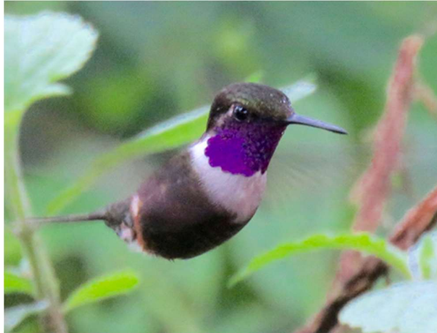
Purple-throated Woodstar

March 15, Day 5: Return to Quito via Amagusa-Mashpi Reserve and Alambi Cloud Forest Reserve. We will depart this morning after breakfast and initiate our return to Quito, but first by heading farther to the west the Amagusa-Mashpi Reserve, which is owned and managed by a local Ecuadorian couple. This is a special place where nectar and, especially, plantain banana feeders have been set up; targets here include Glistening-green, Rufous-throated and Moss-backed tanagers; along with Golden-collared Honeycreeper. The incredible Chocó regional cloud forest in this area is quite amazing and we will also take some time to look for special endemics like Pacific Tuftedcheek; Uniform Treehunter; Black Solitaire; Orange-breasted Fruiteater; and Indigo Flowerpiercer; among the many possibilities. After most of the morning here, we will then return eastward to visit a local friend at Alambi Cloud Forest Reserve to check out his unbelievably active nectar and fruit feeders. This is an impressive site that offers mind-boggling activity and good photo ops, if we haven't had enough already! We will then initiate our final push to the big city and the finale to Part I of our Extravaganza.