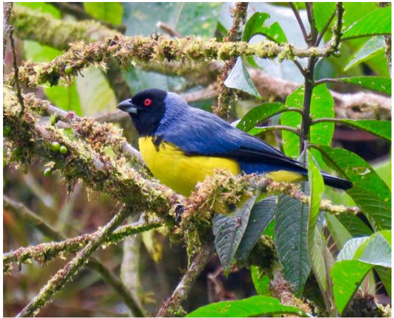
Hooded Mountain-Tanager

Woodcreeper; Streaked Tuftedcheek; Pearled Treerunner; Dusky Piha; White-banded Tyrannulet; Turquoise Jay; Slaty Brushfinch; Mountain Cacique; Spectacled Redstart (Whitestart); Black-capped Hemispingus (actually, a bonafide member of the tanager family); Hooded Mountain-Tanager; Grass-green and Blue-and-black tanagers; Blue-backed and Capped conebills; Masked Flowerpiercer; and Gray-hooded Bush Tanager. We will pull ourselves away from this incredible show to continue our journey onward downslope and then over the Guacamayos Ridge and then descending again to eventually reach our destination—Wildsumaco Lodge—which is nestled along a heavily forested ridge in the Amazonian foothills. As we advance, we will make a couple of stops to break-up the drive a bit and to, of course, see more species. A few more possibilities could include: Speckled Chachalaca; Black-throated Brilliant; Violet-headed Hummingbird; Glittering-throated Emerald; Fasciated Tiger-Heron; Swallow-tailed and Plumbeous kites; Yellow-throated (Black-mandibled) Toucan; Yellow-tufted and Crimson-crested woodpeckers; Black-Caracara; Military Macaw; Lined Antshrike; Cliff Flycatcher; Violaceous Jay; Slate-throated Redstart (Whitestart); Blue-winged Mountain-Tanager (among several additional tanagers), along with other specialties. We should arrive with plenty of time to settle in and even get to sample some great birding from the lodge deck—hummingbirds and who knows what else!