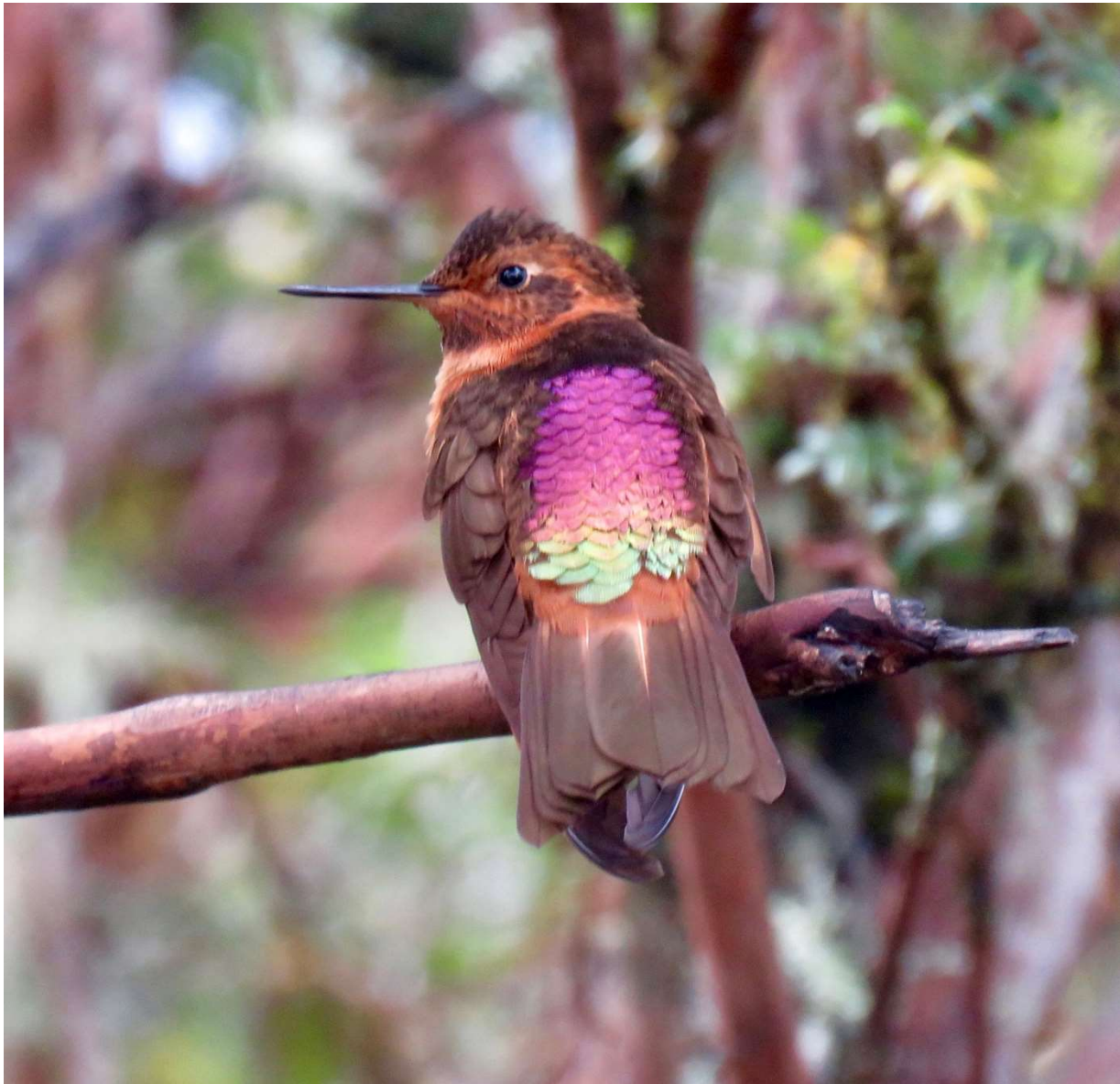
Shining Sunbeam