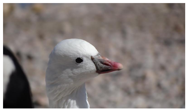
A quizzical Ross's Goose watches its watchers

NIGHT: Fairfield Inn and Suites, Kearney, Nebraska