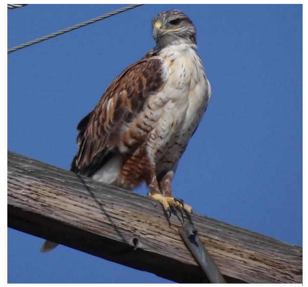
A Ferruginous Hawk takes advantage of a rare elevated perch on the Nebraska prairies.

After witnessing this moving sight, we'll leave the Platte and its many thousands of cranes behind. As we move west and north toward the city of North Platte, we should run across more waterfowl and a good selection of raptors, sometimes including Ferruginous Hawk or Prairie Falcon among the common Red-tailed Hawks, Northern Harriers, and American Kestrels. Greater Prairie-Chickens are occasionally seen flying across the road, but we can hope for far better views of that species to come.