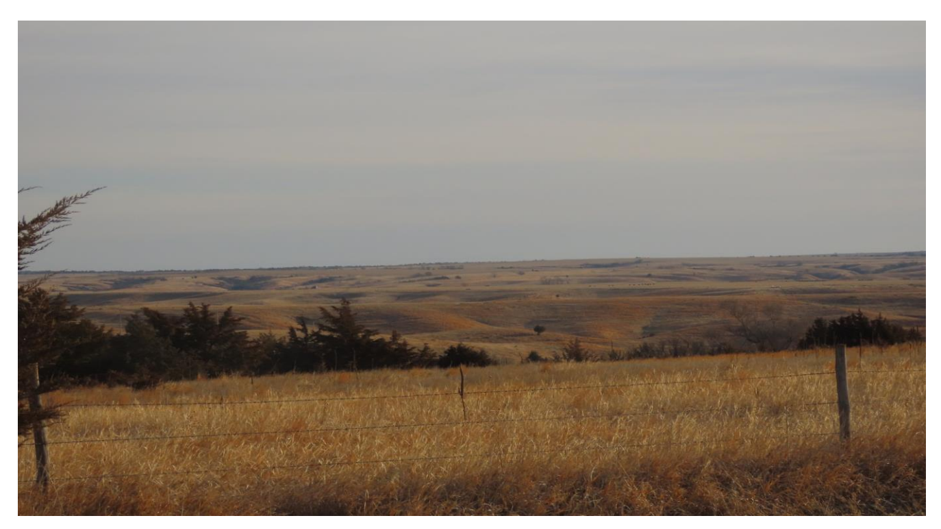
Approaching the Loess Canyons

March 21, Day 7: The Lower Platte and Return to the East. The migration of the Whooping Crane through central Nebraska typically begins in early April, but recent years have seen one or two birds appearing in the Grand Island area as early as mid-March. The return of the Whooping Crane is one of the great conservation stories of the past 100 years, the result of the unflagging efforts of talented scientists and responsible landowners. If one of these birds—or an even rarer Common Crane, an annually occurring needle in the big gray feathered haystack—has been reported, we will spend the morning in search of the rarity; otherwise, after breakfast, we will make the two-hour drive back to the Omaha area, with a stop, time permitting, at one of the most productive birding sites on the lower Platte River, Schramm Park.