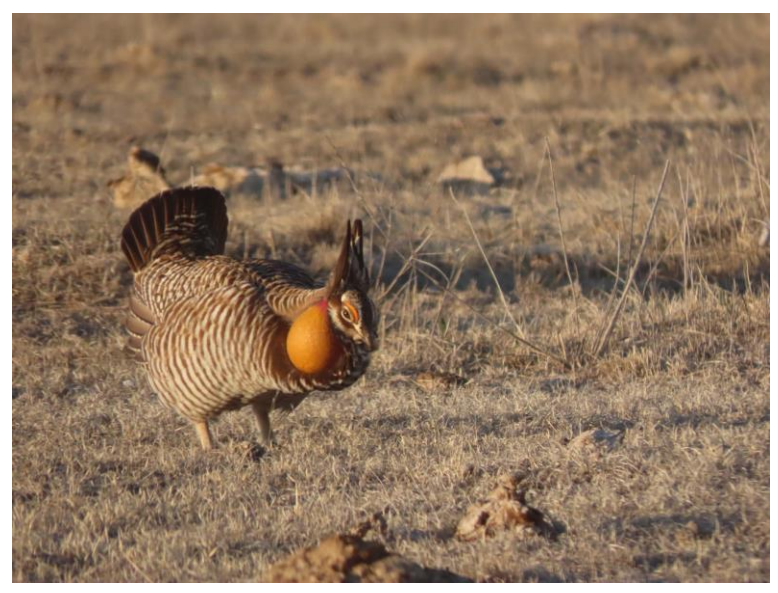
NIGHT: Holiday Inn Express, McCook, Nebraska

We will have lunch in North Platte, then turn south and bird our way to McCook, arriving there in the late afternoon. After checking in to our hotel, we will attend a short-illustrated presentation by a local rancher-naturalist about southwest Nebraska's grouse and their behavior, then have dinner in town.