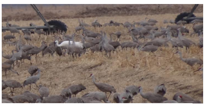
Whooping Crane

March 20, Day 6: Return to the Platte. We'll check out of our hotel this morning, then start our drive east to Grand Island, two and a half hours away. Weather permitting, our route this time will take us north and east into the Loess Canyons region, where hundreds of American Robins are often joined by smaller numbers of Townsend's and Eastern and Mountain Bluebirds feeding on the abundant eastern red cedar cones.