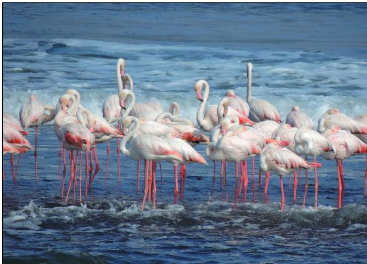
Greater Flamingos at Walvis Bay

August 11-12, Days 3-4: Swakopmund and Walvis Bay. We have two full days to bird the local area including Walvis Bay, the Kuiseb Delta, the two large salt works located on the coast, and the gravel plains north of Swakopmund. Our targets will include endemic and near endemics such as Cape, Crowned and Bank cormorants; African Oystercatcher; Hartlaub's Gull; South African Shelduck; and Damara Tern. Large tern roosts are often found in the area and we will search these for rarities such as Royal Tern amongst the more numerous Common, Arctic and Black terns. We can also expect numbers of Greater and Lesser flamingos and Great White Pelicans, as well as a host of shorebirds. Our trip coincides with the arrival of large numbers of waders from the northern hemisphere and Curlew Sandpiper, Ruddy Turnstone and Bar-tailed Godwit, amongst others, are all likely. The area is home to between 90 and 95% of the world population of the gorgeous Chestnut-banded Plovers and also regularly attracts vagrant shorebirds. Almost anything is possible, even familiar American species such as Baird's and White-rumped sandpipers. Away from the coast we will look for endemics such as Bokmakierie and Orange River White-eye—all species unlikely to be seen on the main tour.