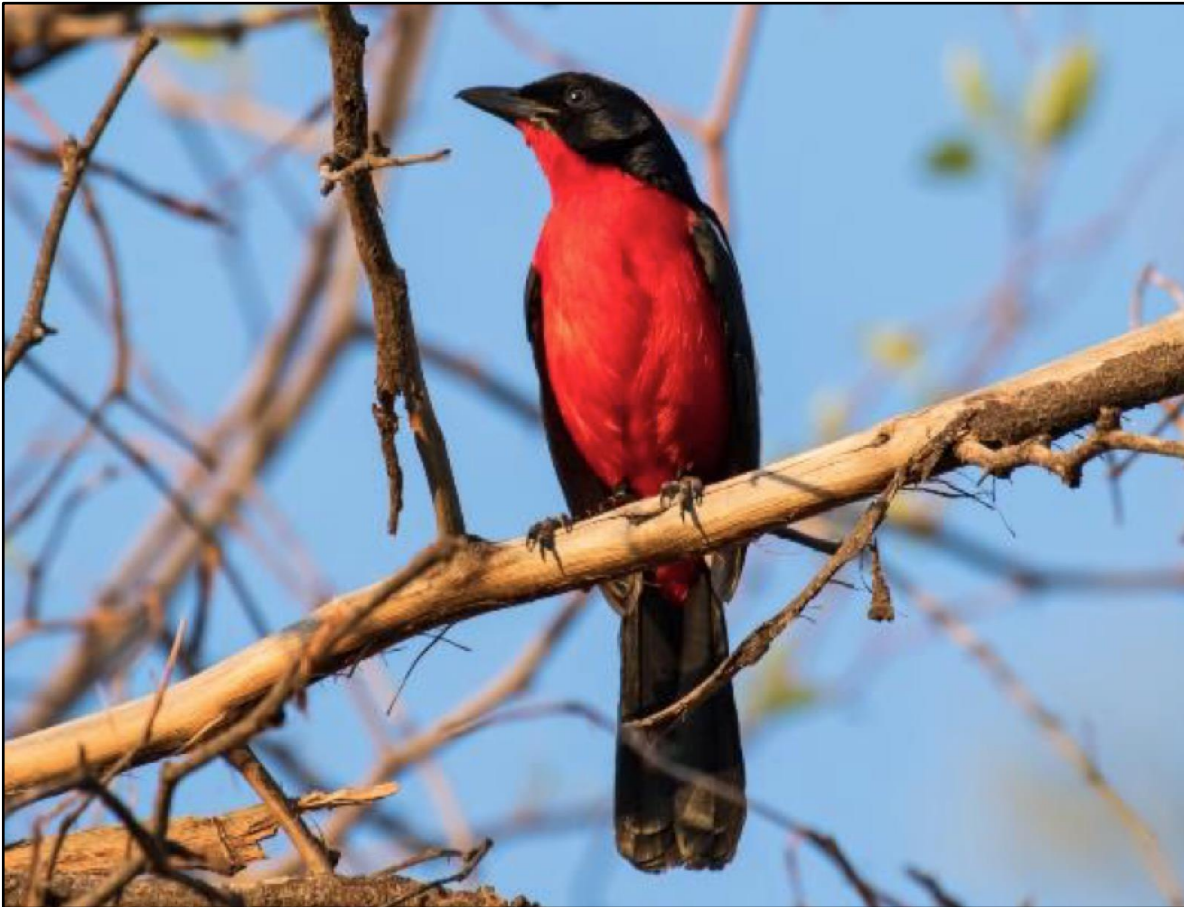
Crimson-breasted Gonolek

Namibia, Botswana, and Zambia—these little-known countries offer some of the greatest wildlife viewing on the African continent. They are huge in size and sparsely populated, with large areas little disturbed by man. We will divide our time between them, contrasting the arid hills and plains of Namibia with the lush swamps and woodland of Botswana's Okavango Delta region. We will focus on two major areas: Etosha National Park and the Okavango Delta. The tour ends in Livingstone, Zambia, affording participants the opportunity to see Victoria Falls, a roaring wall of water that is one of the great sights of Africa.