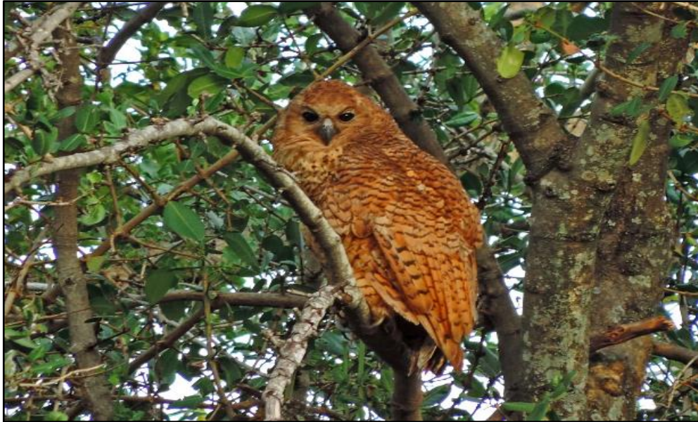
Pel's Fishing-Owl

for a suitable place to start excavating their nests. Hippos and crocodiles plunge into the river at our approach and late in the afternoon we may catch a glimpse of the strange Sitatunga, a swamp-dwelling antelope.