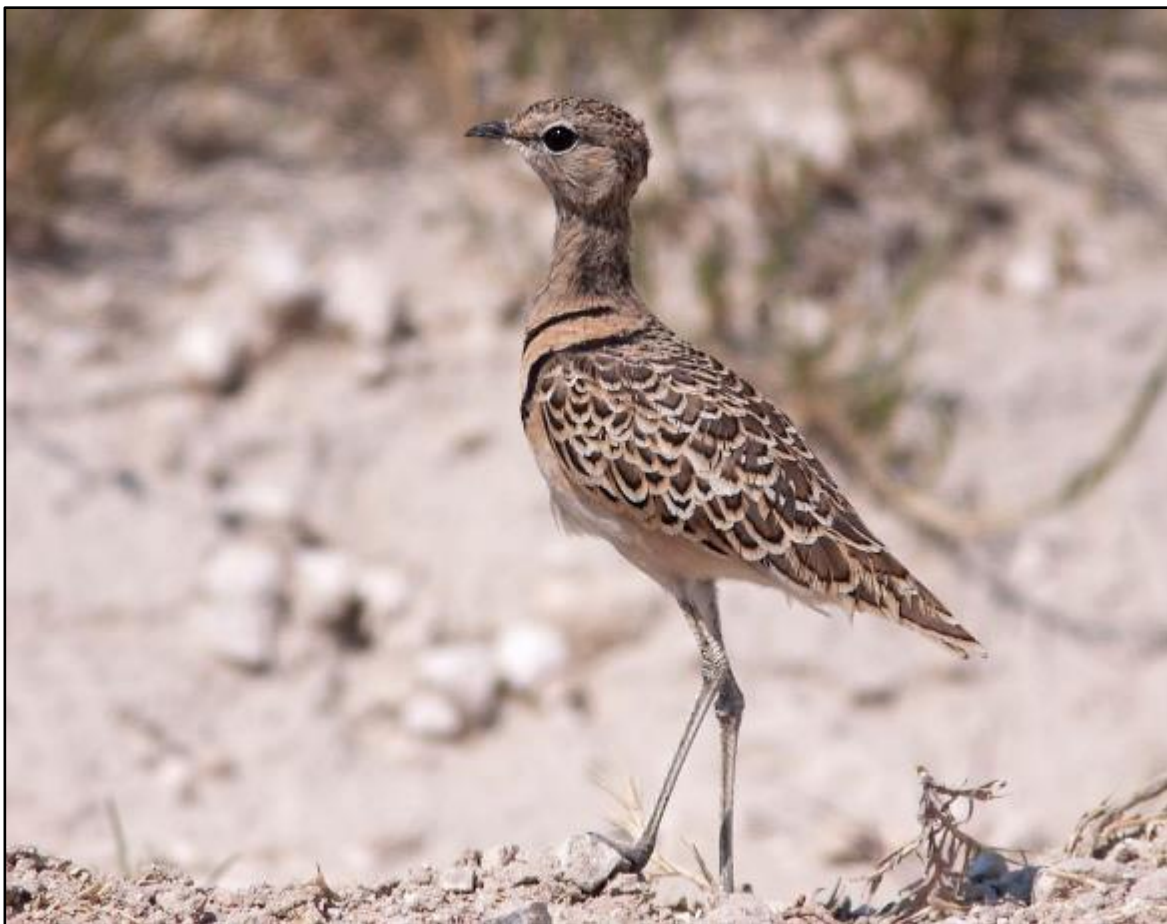
Double-banded Courser

August 17, Day 6: Western Side of Etosha National Park. We will spend the day continuing to explore the western side of Etosha, visiting a number of waterholes in search of the immense variety of birds and animals that occur in this region. Among the special birds on the plains are the Common Ostrich, Blue Crane (one of the most elegant members of that stately family), Kori Bustard, the handsome White-quilled Bustard (or Korhaan), Secretarybird, Greater Kestrel, Double-banded Courser, Namaqua Sandgrouse, Swallow-tailed Bee-eater, Cape Crow, Gray-backed Sparrow-Lark, Southern Anteater-Chat, and the gorgeous Violet-eared Waxbill. We have another chance to enjoy the variety of mammals coming in to drink at the floodlit waterhole on the edge of camp.