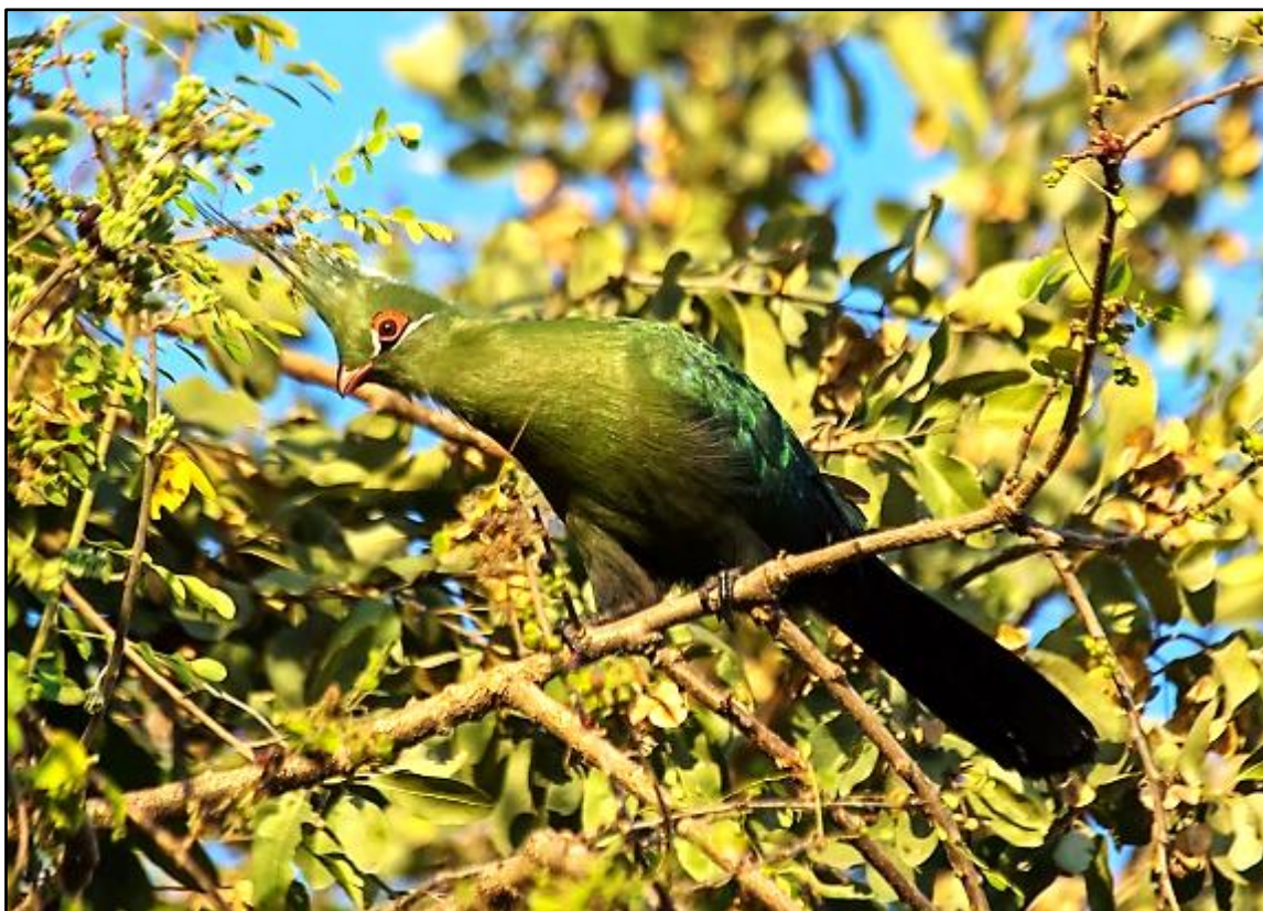
Schalow's Turaco