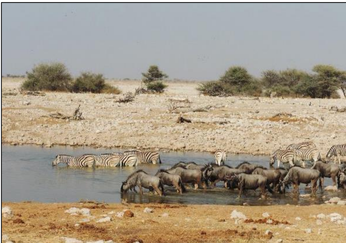
Common Zebra and Blue Wildebeest

“Just as we arrived a Lioness was walking away from the waterhole to join other members of her pride sleeping under a tree. A Tawny Eagle perched atop another tree and soon afterward forty guineafowl came to drink. Minutes later a herd of over a hundred Zebra appeared from our right. Soon the lead Zebra were up to their knees in the water as thirsty members of the herd pressed in from all sides. Suddenly, a Lanner Falcon swooped past and caught a dove. A little later Gemsbok, Wildebeest, and Black-faced Impala moved in to drink. Finally, a pair of Greater Kudu approached the water with extreme caution, but just as they started to drink, one of the Lions raised its head and the Kudu bolted.”