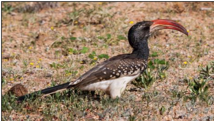
Monteiro's Hornbill

Upon our afternoon arrival, we will begin our exploration of the habitats around the lodge. Hobatere is located in an area of granite outcrops, mopane scrub and woodland, and dry riverbeds lined with large Ana trees, and we will search this area for a number of regional endemics—hoping for sightings of Rüppell's Parrot, Hartlaub's Spurfowl, White-tailed Shrike, Carp's Tit, Violet Wood-Hoopoe, Rosy-faced Lovebird, Chestnut Weaver, Rockrunner, Bradfield's Swift, Damara-, and Montiero's hornbills, and Bare-cheeked Babbler amongst others.