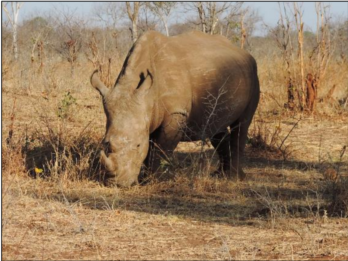
Square-lipped (or White) Rhinoceros