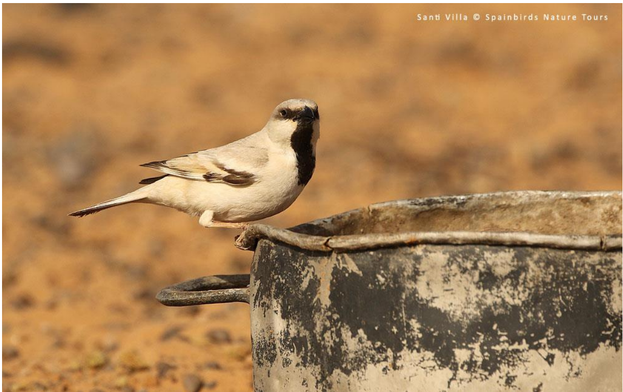
Desert Sparrow by Santi Villa © Spainbirds Nature Tours

This expedition to the Kingdom of Morocco promises the finest birding and natural history experience available in North Africa. March is the best time for birding in Morocco as Palearctic species that wintered in sub-Saharan Africa have started migrating north to their breeding grounds in Europe. Morocco is ideally located on this route and is very important as a stopover point for many species. Also, the many endemic resident species are in prime plumage and ready for breeding. This tour is designed to cover all the important habitat zones of the country. Combine the wildlife with the friendly laid-back atmosphere of the locals and you have the ingredients for an excellent travel destination. Traveling in Morocco is very safe and a real pleasure!