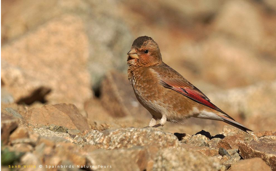
(African) Crimson-winged Finch

NIGHT: Hotel Aurocher Ourika, Atlas Mountains near Oukaimeden