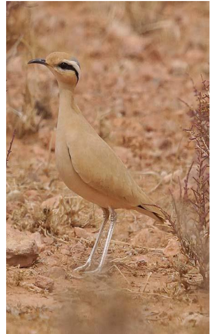
Cream-colored Courser by Santi Villa

March 8, Day 6: Agadir to Ouarzazate. Today we will be birding en-route to the city of Ouarzazate in central Morocco, stopping for anything of interest as we travel. One of the special pleasures of birding in Morocco is the many wadis the country contains. These little valleys are dry for most of the year and only contain water with heavy rainfall. The vegetation in the wadis is short and spread out but accommodates a lot of life. Specialized mammals, butterflies, and birds live in this habitat, a good example of which are the colourful Sylvia warblers. We are likely to see Sardinian, Subalpine and Spectacled warblers foraging here. With migration on its way, we expect to come across the first European-bound migrants of the season like Garden Warbler, Western Bonelli's Warbler, Common Chiffchaff, Spotted Flycatcher and Common Redstart. The stunning Woodchat Shrike will be a good addition to the list; we will look for it hunting from the tops of larger shrubs.