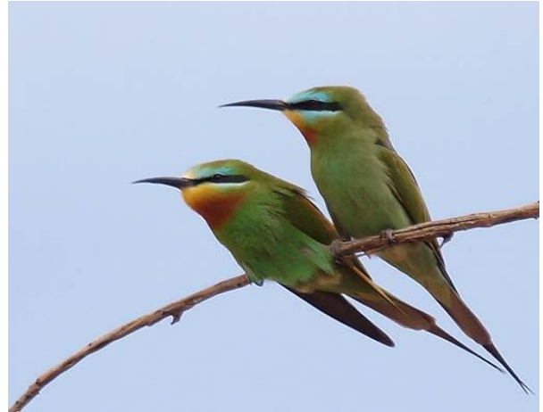
Blue-cheeked Bee-eater

Today we leave Boumalne behind and drive further east, with the Sahara Desert foremost on our minds. A stop at Tohdra Gorge will hopefully yield close views of huge Alpine Swifts, more Eurasian Crag-Martins, the gorgeous Blue Rock-Thrush, and the range-restricted House Bunting. In the palm plantations of the Tafilalt Valley, we will search for Blue-cheeked Bee-eater and the algeriensis subspecies of Great Gray Shrike, a truly impressive bird. After a stop for the enigmatic Scrub Warbler at one of the wadis while en route, we'll arrive in Erfoud—the gateway town to the sandy deserts of the Sahara! The Kasbah Hotel Tombouctou will be our home for the next three nights, located near the impressive Erg Chebbi Dunes, the largest sand dune complex in Morocco.