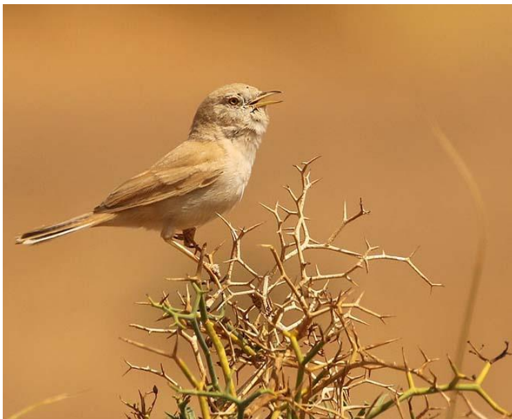
African Desert Warbler

March 12-13, Days 10-11: Erg Chebbi Sand Dunes and Rissani. Over the next two days, we'll explore the areas around Merzouga in search of memorable birds and landscapes. A small caravan of 4x4 vehicles will bring us to Erg Chebbi. The word Erg comes from the Arabic word Arg which, freely translated, means “dune field,” and that is precisely what lays in front of us—a massive area of desert with wind swept sands. This desert area, with aeolian