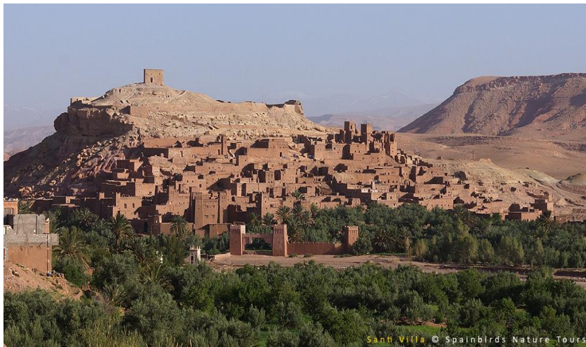
Kasbah Ait Ben-haddou

March 15, Day 13: Aït Benhaddou & transfer to Atlas Mountains. This morning we will visit the medieval fortified village (ighrem or ksar in Arabic) of Aït Benhaddou, which, centuries ago, was a small settlement on the caravan route from the Sahara Desert to the imperial city of Marrakech. Inside the walls of the ksar are half a dozen kasbahs or merchants' houses. This kasbah is a great example of earthen clay architecture, which has been