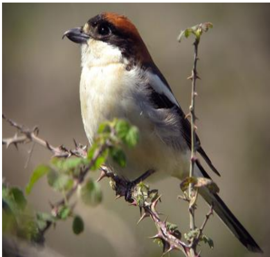
Woodchat Shrike

NIGHTS: Aboard aircraft in transit to Marrakech (March 3) Hotel Della Rosa, Marrakech (March 4)