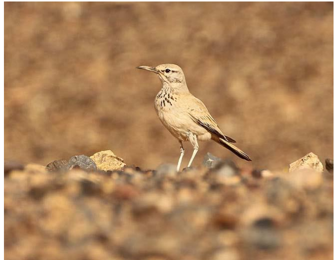
Greater Hoopoe-Lark

Flights to Marrakech from the United States will depart on March 3 for an overnight flight to a European airport, then connect to a flight to Marrakech. Participants wanting to avoid the risk of misconnecting with the group should consider arriving in Marrakech or your European gateway city on or before March 3 and spending the night. Upon request, VENT will be happy to assist with any additional lodging arrangements.