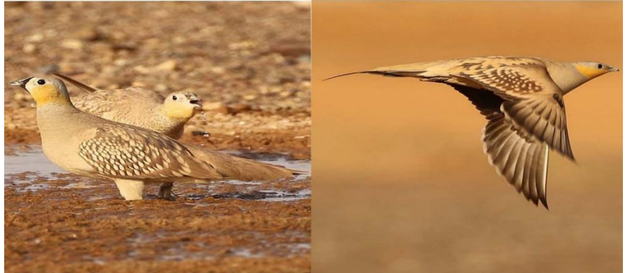
Crowned (L) & Spotted Sandgrouse (R)

On the second day we will focus on birds we might have missed in the Rissani area, and we will seek them out while paying attention to the local Berber culture as well. Here, there may even be an opportunity for a little shopping!