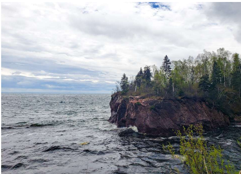
View from Tettegouche State Park

The next day of the tour was a full day at Sax-Zim Bog, where we covered a different tier of the bog. After birding throughout on-and-off rain showers over the past two days, our morning in the bog was a pleasant change of weather, with clear skies and refreshingly cool temps. An early morning Sharp-tailed Grouse was seen among