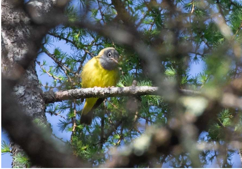
Connecticut Warbler

was! His song carried through the thicket of trees, “teepa teepa teepa!” After a wonderful Northwoods lunch at the Wilbert Café, we birded along a boardwalk that led us through sky-high spruces of years past and Hairy Woodpeckers actively feeding on these towering trees. Before we headed back to Duluth we birded Nichols Lake, where we enjoyed the sight of Common Loons on the lake, as well as a nearby active cavity of nesting Hairy Woodpeckers. We ended our day with a dinner in Duluth, savoring delicious wild