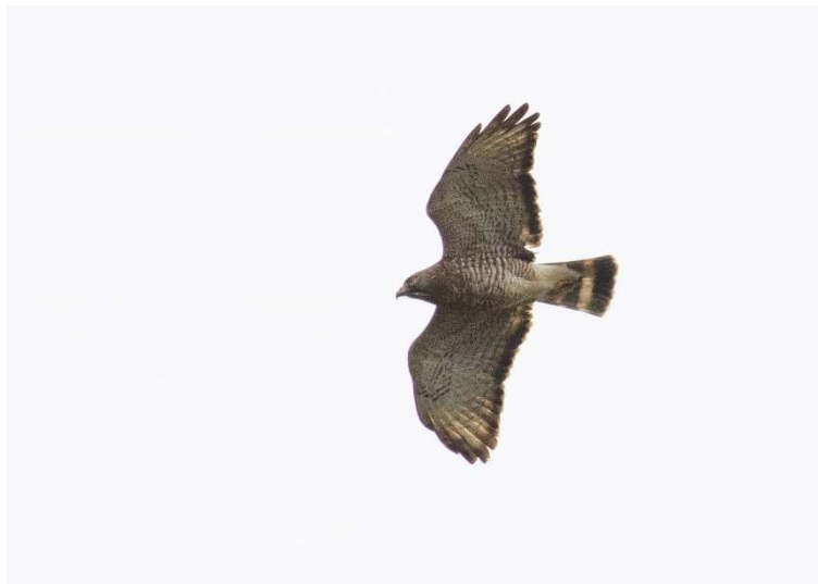
Adult Broad-winged Hawk

forth birds such as Northern Parula, Brown Creeper, and a sneaky Ovenbird. Along the Stoney River Road that followed, the changing ecosystem welcomed an array of exciting new birds. A Canada Warbler was a show-stealer, while we went for a short hike enjoying the geology and different micro-ecosystems around us. We had some stellar views of a singing Northern Waterthrush and Blackburnian Warbler, in addition to a beautiful adult Broad-winged Hawk. After a tasty lunch we explored Tettegouche State Park, where we had amazing experiences with up-close American Redstarts, a handsome