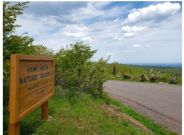
Birding at Hawk Ridge on the last day of the tour