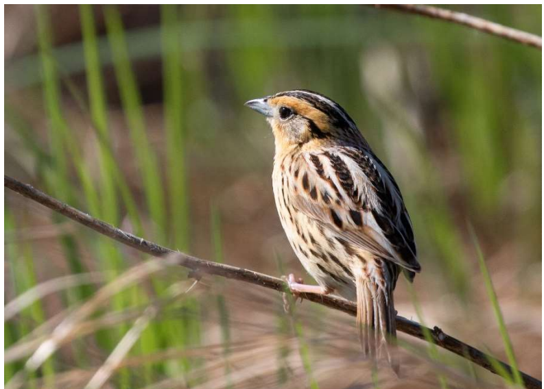
LeConte's Sparrow

On the last morning we headed back to Sax-Zim Bog, a spot that is hard to savor enough. There were still roads that we hadn’t explored yet. Especially when it comes to summer birding, the ‘bog has many days’ worth of birding adventures in store. A lucky catch from our eyes spotted both Moose tracks and Wolf tracks along the road we were driving on. While birding the central part of the bog we locked our sights on a dapper, out-in-the-open LeConte’s Sparrow, which is an uncommon treat to see, let alone when one is out in the open and up close! The views of this bird lasted several minutes. We saw him singing away, perched on blades of grass. His golden hues glowed against the nearby grasses. An obligatory visit to the Friends of Sax-Zim Bog Welcome Center was in order, as this is the headquarters for the conservation efforts and public outreach that takes place throughout Sax-Zim Bog. We enjoyed both the little store inside as well as the diverse property. A