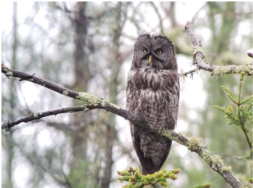
Soaking wet Great Gray Owl

We left early the next morning for Sax-Zim Bog. The chance of rain increased as we drew closer to Sax-Zim Bog. Once we were along the bog roads, the skies let loose with heavy rain showers, impressive lightning, and roars of distant thunder. We weren't about to have the elements rain on our birding parade, however. While scanning from inside the van, we got on our first bird of a day: a soaking wet Great Gray Owl! After a little while of watching this beautiful bird, the downpour turned into light rain, which turned into drizzle, which eventually halted entirely. The sheer experience and scope views of this bird were mesmerizing. The bird roused