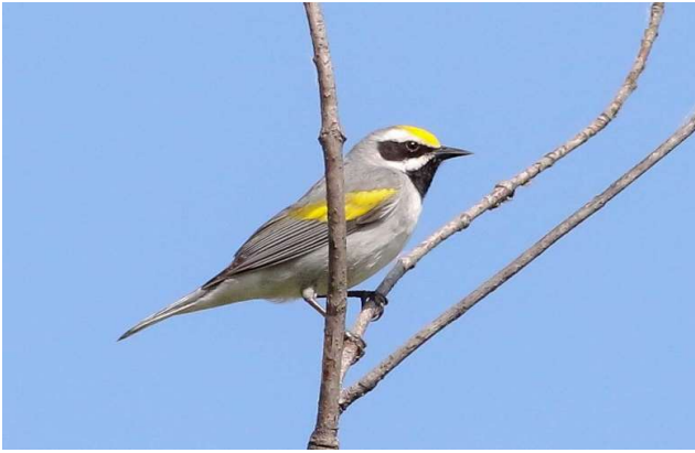
Golden-winged Warbler

As we explore the pine-barrens searching for Kirtland's Warblers, we will likely see a few other interesting species, such as Palm and Nashville warblers, Eastern Towhee, Clay-colored Sparrow, and perhaps even an Upland Sandpiper. In our travels, we will likely visit a boardwalk through boreal forest habitat and search for forest birds such as Ruffed Grouse, Barred Owl, Blue-headed Vireo, Winter Wren, and a long list of warblers, including Canada and Northern Waterthrush. No doubt one of our favorite destinations will be Tawas Point State Park on the shore of Lake Huron, and just minutes from our hotel. Although not as famous as Magee Marsh, Tawas Point can be equally outstanding as a concentration point for songbird migrants, and a frequent magnet for