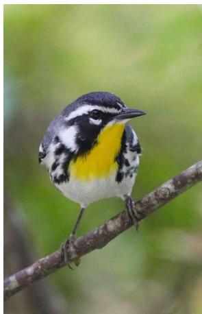
Yellow-throated Warbler

NIGHT: Holiday Inn Express, Cleveland Airport