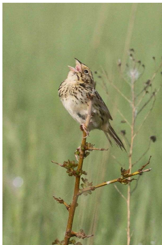
Henslow's Sparrow

We'll have parts of four days to explore the Drift Plains and Northern Lakes and Forest Region of Michigan's Lower Peninsula. Based in the town of Tawas City, we'll be close to many wonderful birding sites, particularly Huron-Manistee National Forest, where Kirtland's Warblers are numerous. We'll devote as much time as necessary to searching for this special bird, which nests exclusively in large, dense stands of young jack pines. A conservation success story, the Kirtland's Warbler was at the brink of extinction in the early 1970s, when populations were estimated to be around 400 individuals. Through intensive habitat management and cowbird control, the population reached 4000 by 2012, though the species' survival remains dependent on conservation efforts.