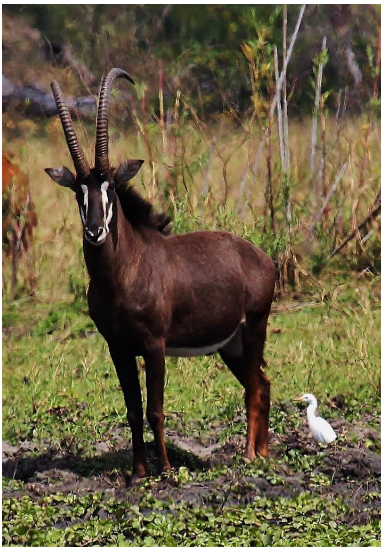
Sable Antelope © Dion Hobcroft