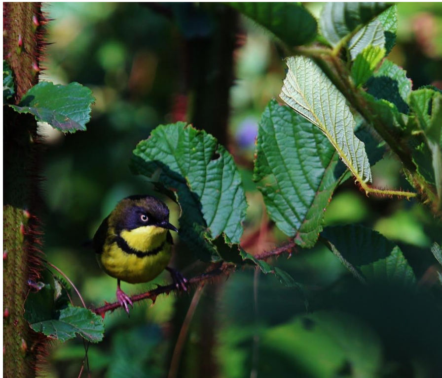
Yellow-throated Apalis, endemic to Zomba