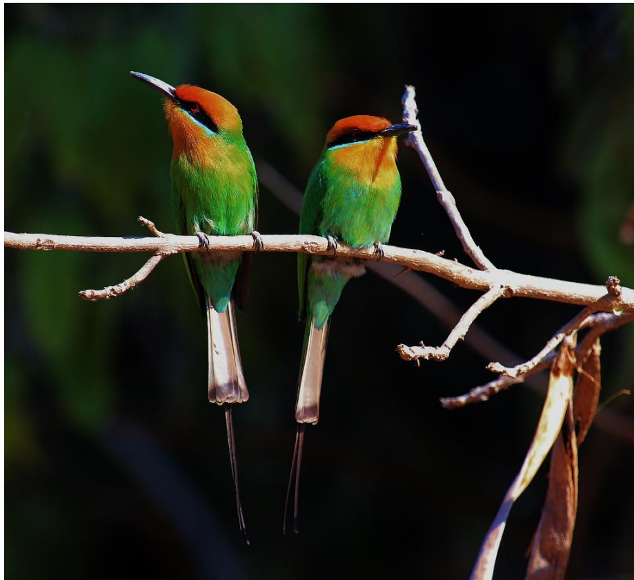
Bohm's Bee-eater at Liwonde

NIGHTS: Mvuu Lodge, Liwonde National Park