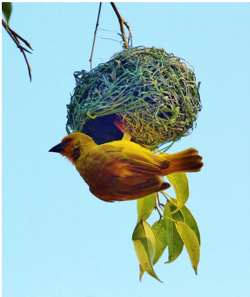
African Golden-Weaver at Chintheche

September 9, Day 9: Nyika National Park to Lake Malawi. After a final morning exploring Nyika National Park and hopefully tracking down anything we may have missed, we will move towards Lake Malawi for a two-night stay at Chintheche Inn. This hotel is set on a quite beautiful white sand beach on one of Africa's great lakes. Between Nyika and the Lake we will make stops to explore more patches of Miombo close to the area called Vwaza Marsh. This habitat is bird diverse and we can look for Miombo Pied Barbet (scarce), Bohm's Flycatcher, White-headed Black-Chat, Miombo Wren-Warbler, Orange-winged Pytilia, and Red-winged and Violet-backed starlings. With luck we will find the elusive Babbling Starling or localized Chestnut-backed Sparrow-Weaver. From Mzuzu we will descend down into the Southern Rift Valley to the considerably warmer area of Lake Malawi.