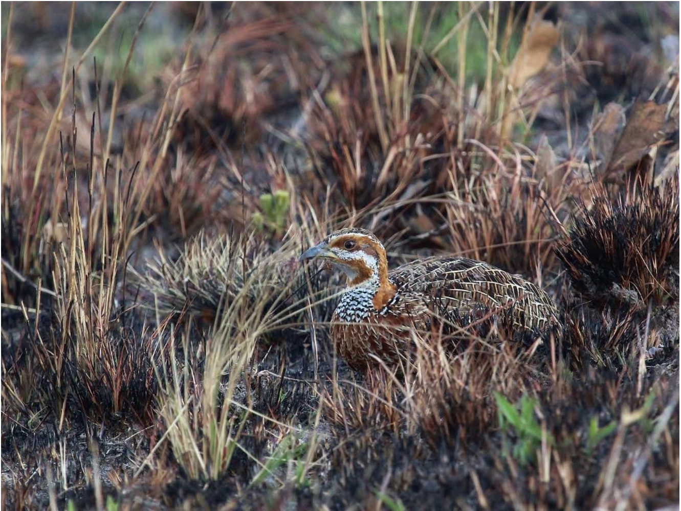
Red-winged Francolin at Nyika

September 7-8, Days 7-8: Nyika National Park. There is a varied assemblage of habitats to explore in this spectacular montane national park close to the border of Zambia. The park is dominated by moorlands, rocky outcrops and pockets of forest. The cool mountain air is delicious and at night we can recap our adventures next to a fire. As mentioned at Luwawa, it can be cold at night, especially if it is windy, so you will definitely need some warm clothes.