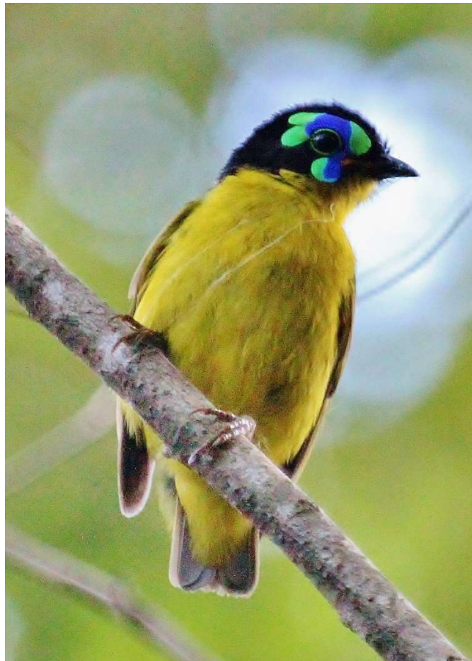
Male Schlegel's Asity

Of the birds, five entire families are endemic to the Madagascar region: the Mesites, Ground-rollers, Cuckoo-roller, Asities and Madagascar Warblers. Recently the previously endemic family of Vangas has expanded to include the Woodshrikes of Asia. The distinctive Vasa Parrots, (including a species from New Guinea) have been elevated to a new family within the parrot assemblage. An endemic subfamily of large cuckoos, the couas, forms an important part of the avifauna. Even more remarkable is the high degree of endemism among the land-birds. November is the