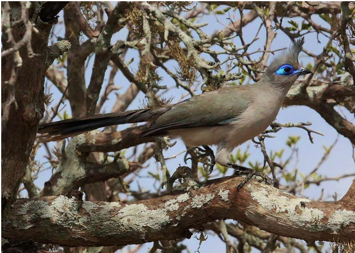
Verreaux's Coua--a challenging-to-find endemic

November 12, Day 7: Tsimanapetsotsa National Park. In 2016, we visited this remote national park and our visit was so successful we felt it would be great to include it in every tour. This large national park is centered on a giant brackish lake that supports a resident population of both Greater and Lesser Flamingos. The nearby escarpments of uplifted limestone have numerous sink holes and caves (complete with blind fish). The old growth woodlands of Baobabs and Elephant Foot trees support good populations of Verreaux's Coua and Lafresnaye's Vanga while Ring-tailed Lemurs can also be quite numerous. Giant Banyan figs grow into the sinkholes in a tangle of roots and shady canopy. Fruiting trees may attract Greater Vasa-Parrot, Madagascar Green-Pigeon while the nutritious leaves are food for the rare Radiated Tortoise. On the barren flats that cover the margins of the lake can be found quite good populations of the rare Madagascar Plover and small freshwater soaks will give us our best chance for the elusive Madagascar Sandgrouse.