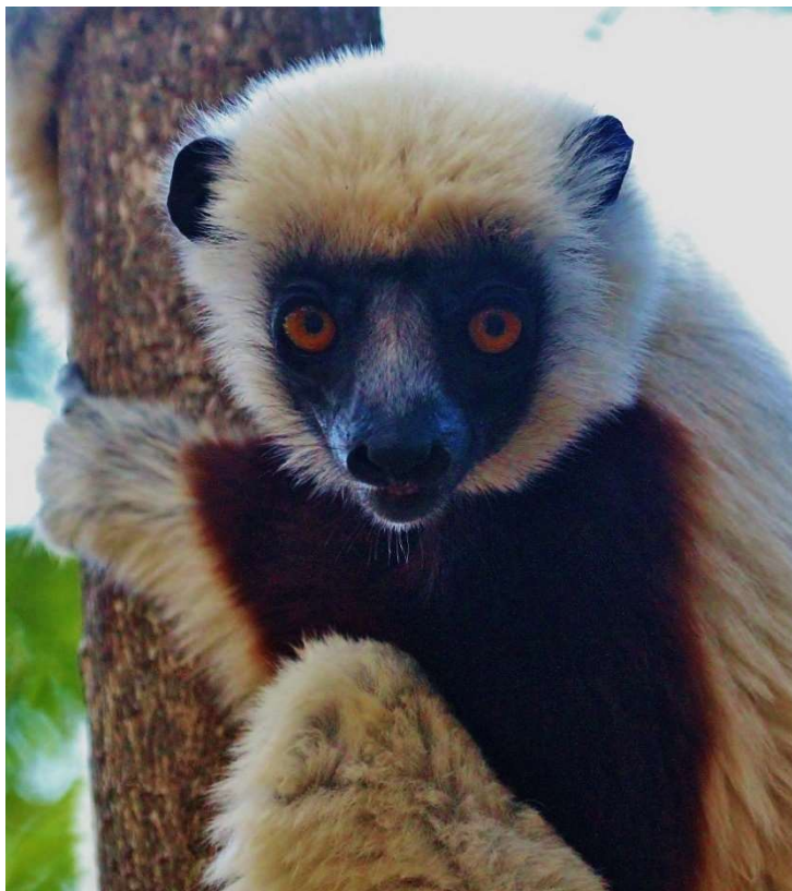
Coquerel's Sifaka