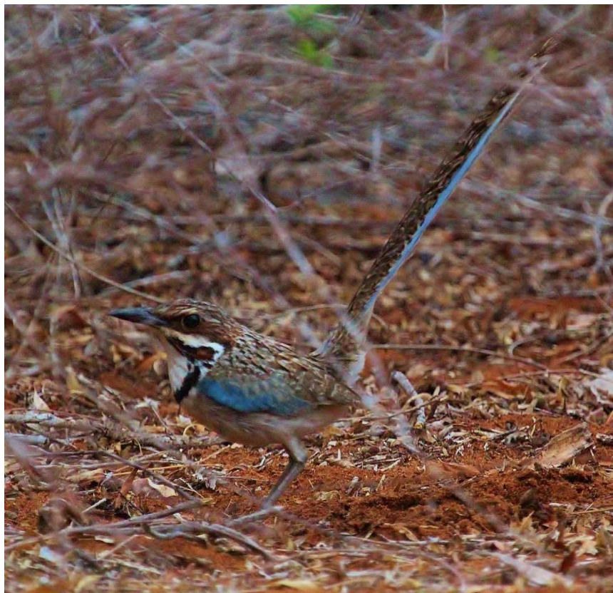
The enigmatic Long-tailed Ground-Roller

up, so too does reptile activity and with a bit of luck we should see the numerous Three-eyed Lizards or a Chameleon species or two. We may be lucky enough to find a beautiful Spider Tortoise, rare Dumeril's Boa or obscure mammals like Lesser Hedgehog Tenrec or day roosting Hubbard's Sportive-Lemur.