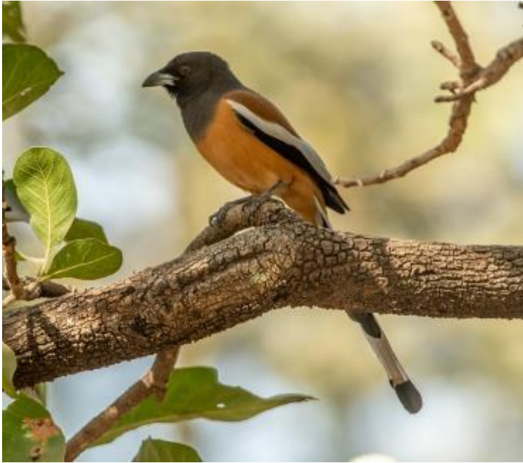
Rufous Treepie

Situated in southeast Rajasthan state, Ranthambore is one of the largest national parks in northern India and certainly one of the most important locations in the country's network of Tiger reserves. Encompassing 150 plus square miles of rocky hill and plateau country covered in dry deciduous jungle on the periphery of the Vindhya Range, the park protects a large stretch of land that once served as the private hunting ground of the Maharajas of Jaipur. Ranthambore sits amid a magnificent setting. An eleventh-century fortress dominates the headquarters area and a pretty lake nearby commands much of our attention. Although most famous as one of India's foremost Tiger sanctuaries, it is equally exciting for its birdlife.