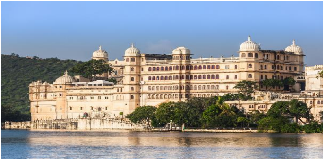
City Palace, Udaipur

February 5, Day 6: A day at Udaipur: Udaipur city tour or birding at Menar; travel to Jodhpur. This morning we will awake in the picturesque region of Mewar (a region of south-central Rajasthan state), one of the most popular and royal states of the Rajputana (a historic region of India that consisted mainly of the lands encompassed in the present-day Indian state of Rajasthan). We'll enjoy a leisurely breakfast aboard the train while admiring views of the Aravali Hills as the train arrives into the station at Udaipur.