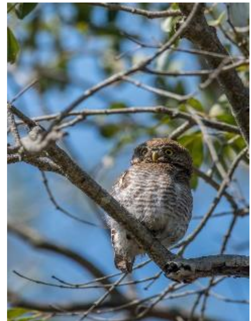
Jungle Owlet

Our chance of seeing a tiger is difficult to predict. Tigers have been seen on many past VENT tours to Kanha, but not all. Throughout our stay we will be in communication with local guides and park rangers for news on recent sightings.