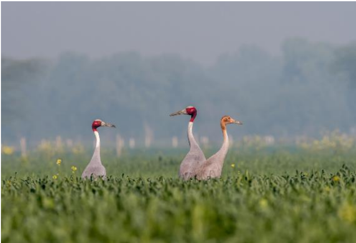
Sarus Cranes

Other species we may see include White-breasted Waterhen, Brown Crake, a variety of vultures (most of which have become quite rare) Black-winged Stilt, Pied Avocet, Greater Painted-Snipe, Pheasant-tailed and Bronze-winged jacanas, and White-throated and Pied kingfishers.