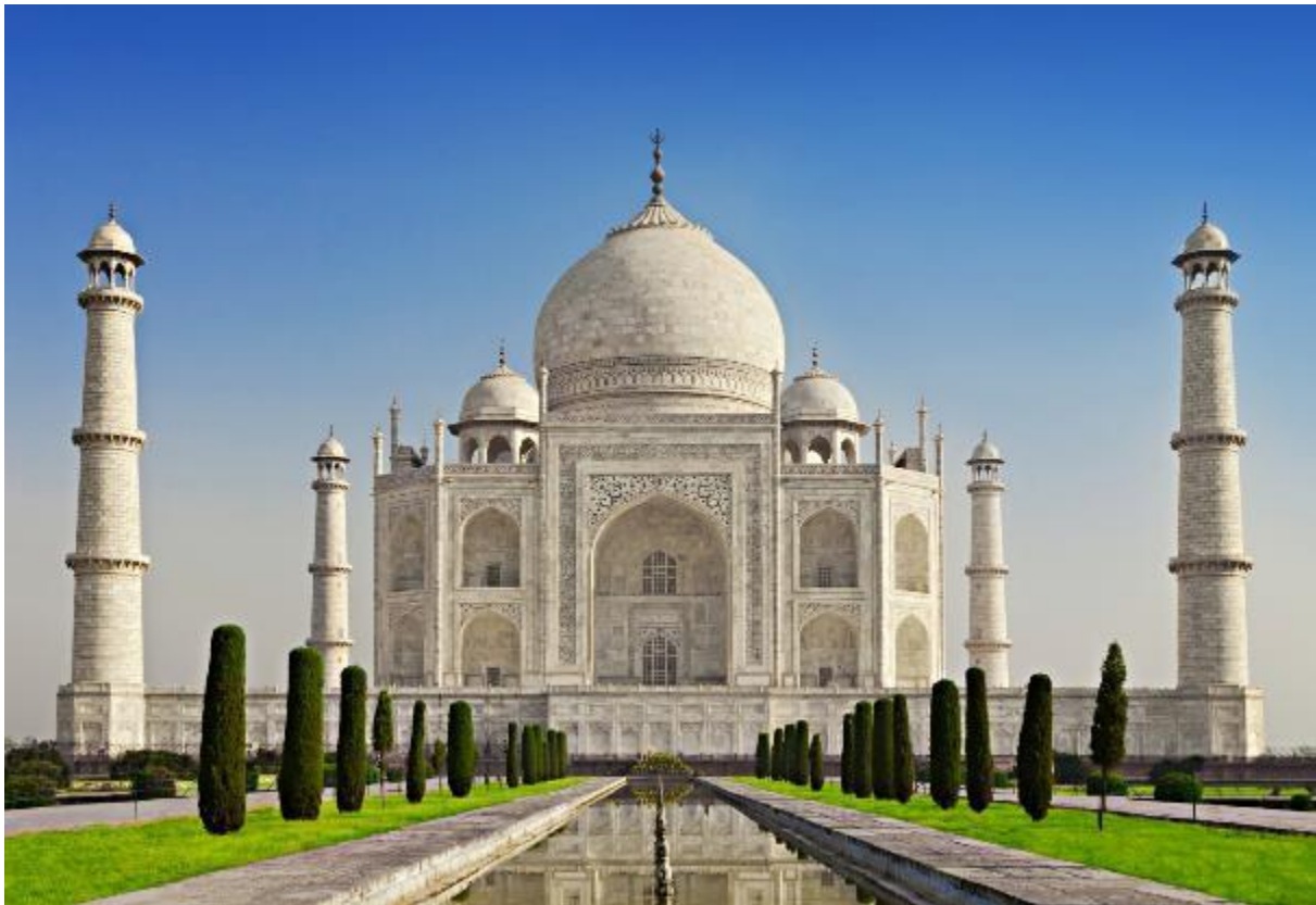
Taj Mahal