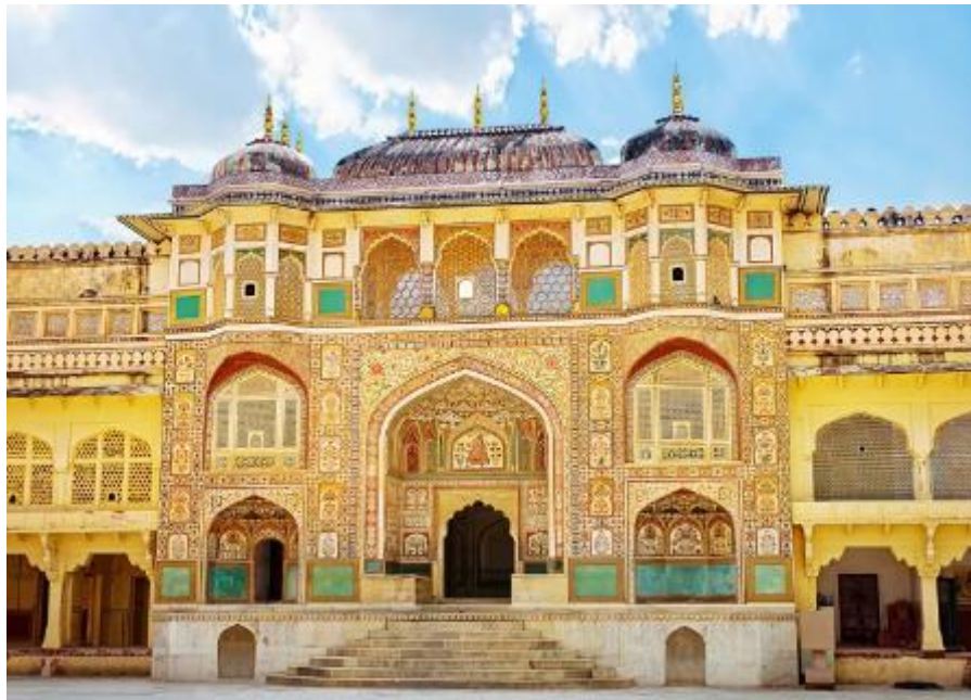
Amer (Amber) Fort

Situated on a ridge overlooking scenic Lake Maota, Amer Fort is the leading tourist attraction of Jaipur. Featuring an extravagant fort-palace surrounded by ramparts, the site offers a peek into the region's Mughal past. Settlement at the site (first town of Amer) dates to the eleventh century A.D., but it was not until the sixteen-hundreds when, under the rule of Raja Man Sing I (1550-1614), that the first palaces of the fort, as it now stands, were built. Constructed of red sandstone and marble, the opulent palace complex is laid out on four levels, each with a courtyard. A short jeep-ride will take us up to the fort where we will enjoy a tour of the battlements, gates, and royal apartments. The Sheesh Mahal (Chamber of Mirrors) is not to be missed while the Jai Mandir (Hall of Victory) is so delicately ornamented with fine inlay work that it actually glows.