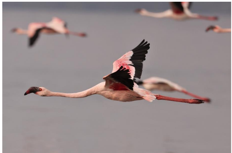
Lesser Flamingo at Thane Creek

Thane Creek (Thane is pronounced Tōn-Ā) is located in South Mumbai in the state of Maharashtra; the creek is a short inlet of water that projects inland from the eastern side of the Arabian Sea. At 4,100 acres, the sanctuary protects large tracts of mangrove wetlands and mud flats that each winter hosts flocks of flamingos, a good diversity of shorebirds, waterfowl, and attendant raptors. Every year from October to March, thousands of Greater and Lesser flamingos can be seen here. Beyond the impressive flamingo spectacle, this area is a good place to see birds. Our strategy will be to spend some time exploring the paths and roads that lead from the parking area into the nearby mangrove wetlands and dry forest before enjoying a casual boat ride on the open waters of the inlet. The boat ride will last for about an hour and will bring exposure to many species of waterbirds.