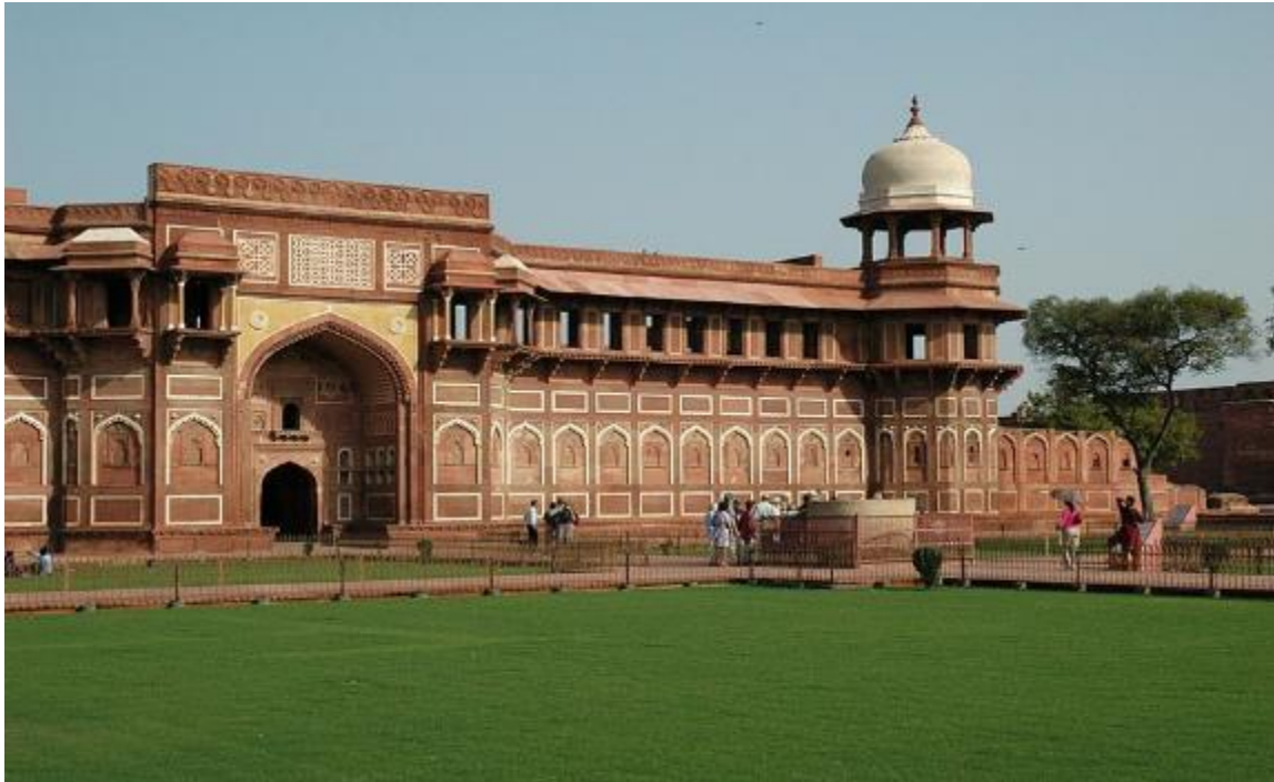
Agra Fort Palace

This majestic citadel of red sandstone dominates a major bend in the Yamuna River and was built by Emperor Akbar, 1565–1571. The fort is crescent shaped, flattened on the east with a long, nearly straight wall facing the river. Its colossal double walls rise sixty-nine feet in height and measure more than 1.5 miles in circumference. It is encircled by a moat, and the maze of courtyards, mosques and private chambers—all constructed of white marble—echo the glory of the great Mughal Empire and form a city within a city. Additions to the fort were made up until the time of Shah Jahan, while in Akbar's time, the fort was principally a military structure. By Shah Jahan's time, a part of the fort had been converted to a palace.