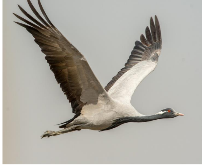
Demoiselle Crane, Guda Bishnoiyan

Our day will begin with a birding excursion near the Bishnoi village of Guda Bishnoiyan, approximately twelve miles outside of Jodhpur, where we will spend a couple of hours birding at Guda Talab. The population of this area is predominantly Bishnoi, a religious sect founded roughly five-hundred years ago in the Indian medieval era. The Bishnoi community is based on twenty-nine tenets, laid down by Jambhoji Maharaj—the Jhambheshwar Maharaj. One of these tenets is protection of wildlife, which includes not cutting down trees. Consequently, the Bishnoi community has played a significant role in protection of the local ecology. Guda Talab is a small wetland complex that offers food and shelter to a wide variety of resident and migrant birds alike. Of the many species possible are prizes such as Ruddy Shelduck, Greater Flamingo, Painted Stork, Indian Cormorant, Oriental Darter, Black-headed Ibis, Eurasian Spoonbill, and Black-tailed Godwit among many others.