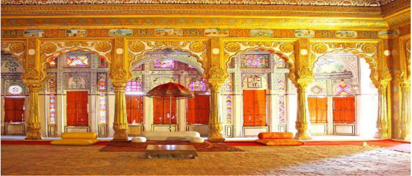
Mehrangarh Fort, Jodhpur