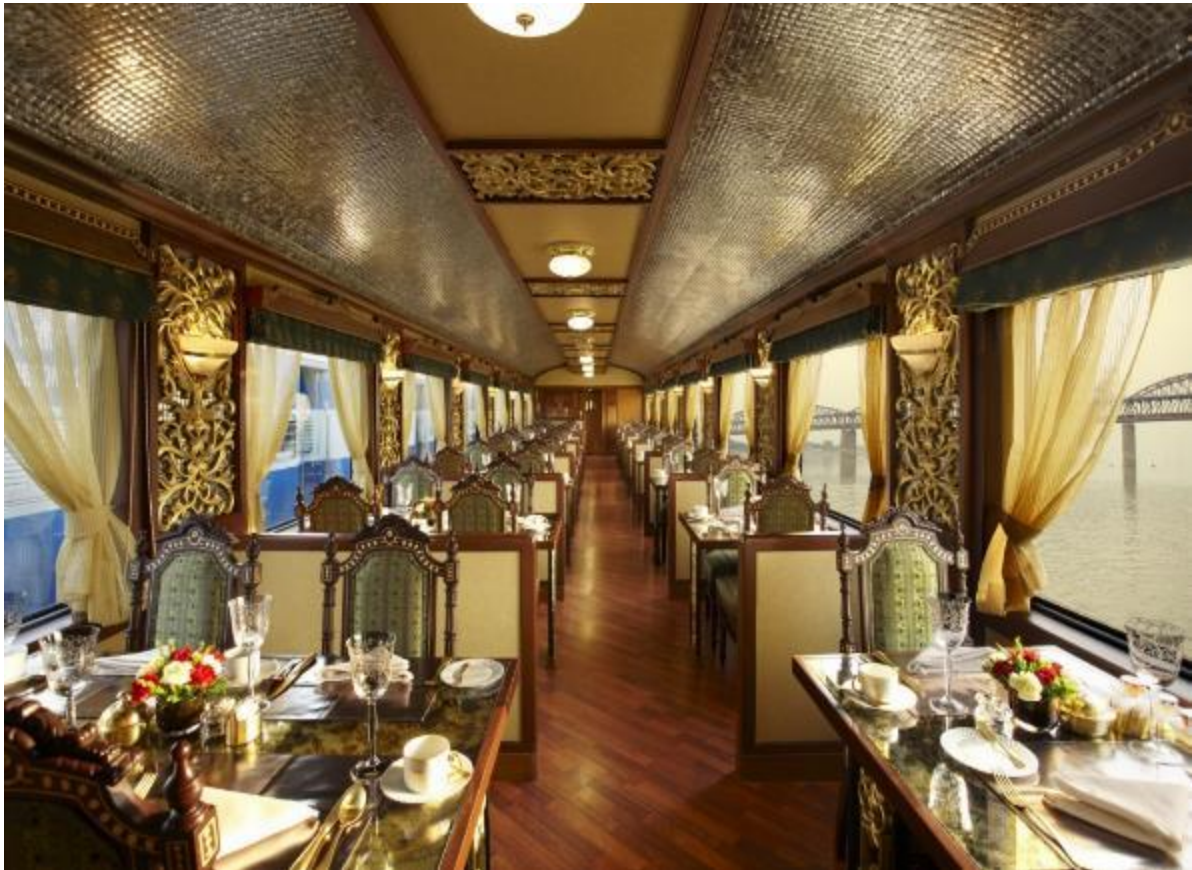
Mayur Mahal Restaurant Car, Maharajas' Express

Among the trip's many highlights are visits to Keoladeo and Ranthambore national parks; touring princely palaces, including the incomparable Taj Mahal; and reveling in unforgettable dinners under the stars. Yet India is much more than a series of highlights. It is a total experience. Perhaps no other country provides so rich a panoply of culture intertwined with nature, literally at one's feet. For the photographer, the traveler, the historian, the anthropologist, and most emphatically for the naturalist, India is a veritable dream.