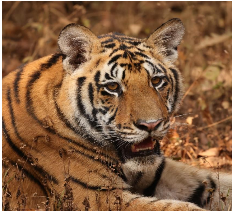
Portrait of a Tiger in Kanha

February 1, Day 7: Transfer to Raipur; fly to Mumbai. After breakfast this morning we will bid farewell to noble Kanha and make the return journey to Raipur, perhaps with a stop or two en route. We'll take the late afternoon flight bound for Mumbai, arriving around 7:00 p.m. Upon arrival we will be met by our ground agent and transferred to our hotel where a room has been reserved in your name.