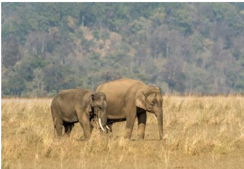
Asian Elephant

A representation of the many species of birds possible includes the handsome Bar-headed Goose and a fine variety of other waterfowl; Swamp Francolin; Kalij Pheasant; Black-necked Stork and Greater and Lesser adjutant storks (all three species regarded as globally threatened); Bengal Florican; several species of migrant eagles including Greater Spotted, Tawny, and perhaps Steppe eagles; Pallas's Fish-Eagle; Gray Peacock-Pheasant (very noisy but tough to see); Bronze-winged Jacana; Gray-headed Lapwing; Orange-breasted and Thick-billed pigeons; Green Imperial-Pigeon; Green-billed Malkoha; Asian Barred Owlet; Brown Boobook; Large-tailed Nightjar; Stork-billed Kingfisher; Wreathed and Great hornbills (the latter the largest of all arboreal hornbills—a magnificent bird); Red-headed Trogon; Blue-bearded Bee-eater; Blue-throated Barbet; Fulvous-breasted Woodpecker; Red-necked Falcon; Blossom-headed and Red-breasted parakeets; Scarlet Minivet; Black-hooded Oriole; the exquisite Asian Fairy-bluebird; Greater Racket-tailed Drongo; Greater-necklaced and Lesser-necklaced laughingthrushes; the scarce Slender-billed and Jerdon's babblers; White-crowned and Black-backed forktails; Black-faced Bunting, the rare Finn's Weaver, and a great many others.