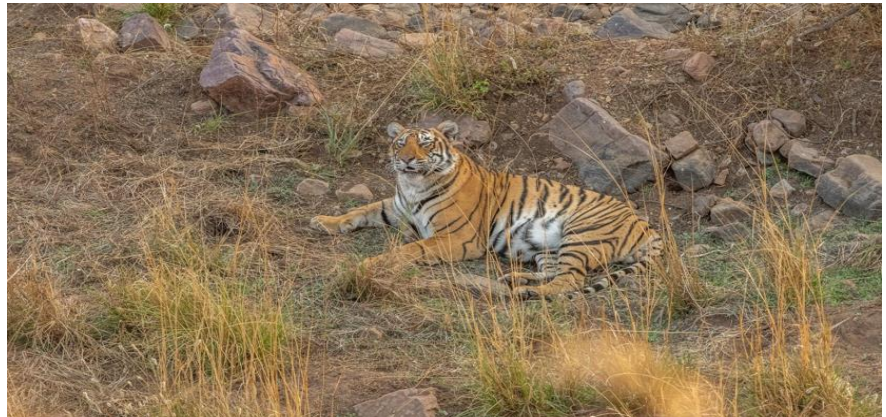
Bengal Tiger, Ranthambore

Ranthambore is an excellent place to see mammals as well, where some of the more common animals are primates (Northern Plains Gray Langur), antelope (occasional Nilgai and Indian Gazelles), deer (Spotted Deer and Sambar), and Wild Boar. Of course, tops on the list are the cats, and our visit gives a very realistic chance of seeing a Bengal Tiger or with luck a Leopard.