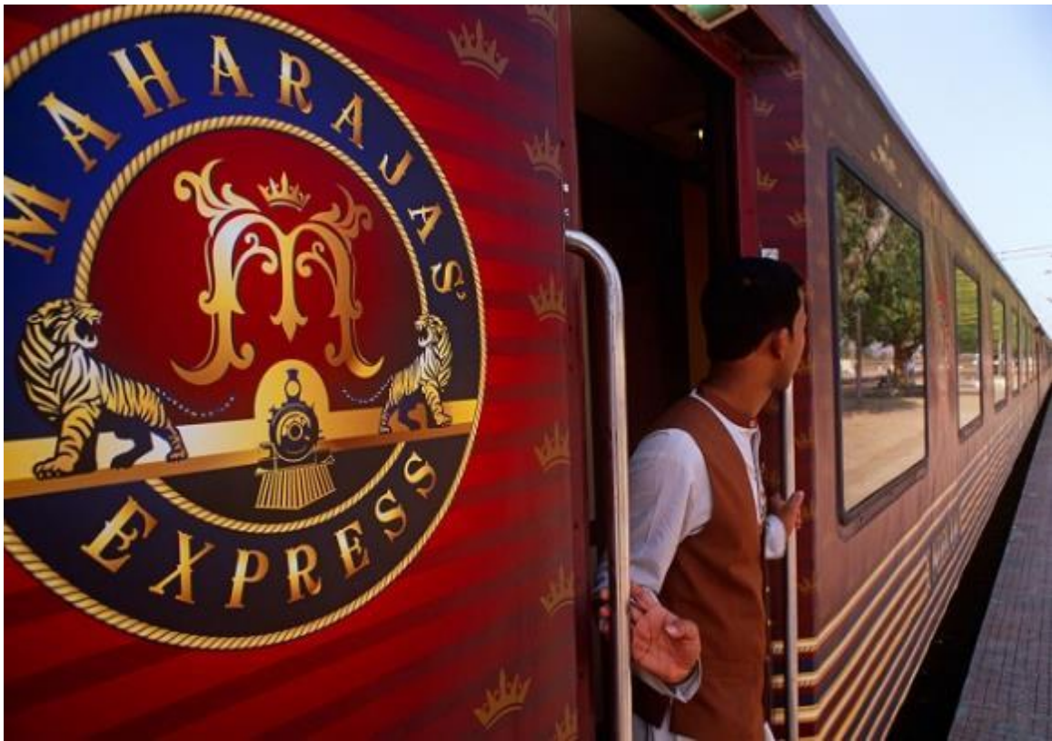
Maharajas' Express

Through the years we have developed an expertise on India train journeys. It all started in 2001 when VENT inaugurated its fabulous Palace on Wheels tour. Subsequent train trips in different parts of the country were equally successful. In 2019, VENT debuted a fabulous new India train tour aboard the beautiful Maharajas' Express. Based on the great success of this trip we will operate this special departure again in 2024! Across a broad swathe of west-central India, we will travel in comfort while visiting the great princely cities of Rajasthan state: Udaipur, Jodhpur, and Jaipur; a host of wonderful national parks and reserves; and cultural wonders. Traveling in such style, in a way rarely experienced by modern-day travelers, will take us back in time and into the heart of Rajput country.