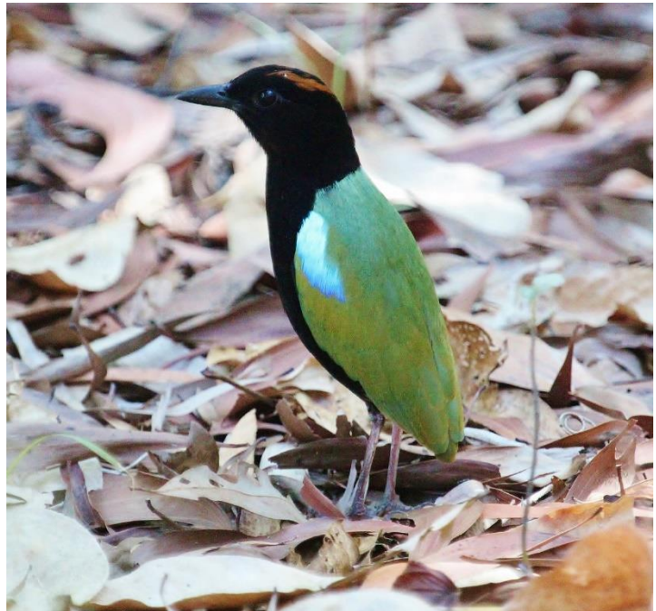
Rainbow Pitta at Howard Springs

October 6, Day 9: Birding the Darwin Area. In the morning we will explore Howard Springs Nature Park, a delightful area of monsoon vine forest and home to our target bird, the beautiful Rainbow Pitta. At this time of the year they should be quite vocal, which will increase our chances considerably of finding it. There will be nonstop birding action in the morning as we will also try to seek out Brush Cuckoo, Varied Triller, White-bellied Cuckooshrike, Shining Flycatcher, Northern Fantail, Gray Whistler, Dusky and Blue-faced honeyeater, and Yellow Oriole. If we have early success, we will explore the mangroves for Australian Yellow White-eye, Mangrove Gerygone and, if the tides are good, hopefully the rarely encountered Chestnut Rail. Before our midday siesta we will visit Knuckey Lagoon, which will provide our first taste of the incredible abundance of wetland birds in the Top End. We will find huge numbers of Magpie Geese and in amongst them Radjah Shelducks, Brolga, Black-necked Stork, Whiskered Terns, Australian