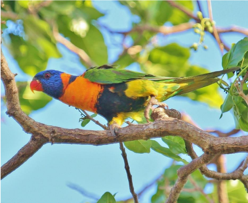
Red-collared Lorikeet is a common species around Darwin

October 5, Day 8: Travel to Darwin; Afternoon at East Point Reserve. This morning we will transfer to the airport in time for the 8:15 a.m. departure of Qantas Flight 840 to Darwin, which is scheduled to arrive in Darwin at 12:20 p.m. (subject to change).