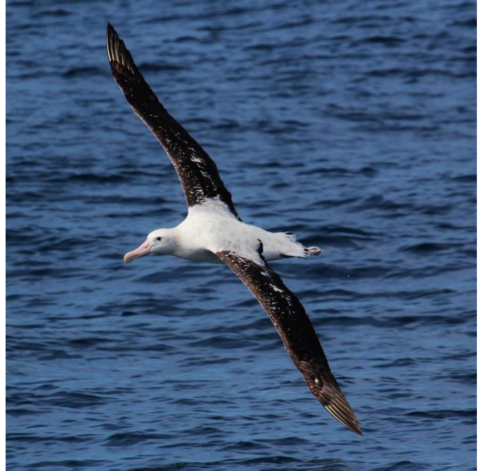
Wandering Albatross at sea off Sydney

October 2, Day 5: Sydney Pelagic Boat Trip. The rich marine waters off the coast of Sydney regularly produce some of the most spectacular pelagic birding in the southern hemisphere. In early spring, schools of baitfish attract flocks of shearwaters. There are often lingering albatrosses from winter and a good mix of both warm and cold water oceanic birds. Among the likely possibilities are no less than four species of albatross including Black-browed, Yellow-nosed, White-capped and the unbelievably huge Wandering. These, without doubt, are some of the most beautiful of all seabirds. Other species we may encounter include Little Penguin (scarce); Wedge-tailed, Short-tailed, Fluttering, Hutton's and Flesh-footed shearwaters; Southern and Northern giant-petrel; Gray-faced and Providence petrels; Australasian Gannet; White-faced and Wilson's storm-petrel; and Brown Skua. Almost any rarity is possible such as Kermadec Petrel, Red-tailed Tropicbird, and perhaps Buller's or Royal albatross. We have an excellent chance to encounter Humpback Whales and a variety of dolphins also.