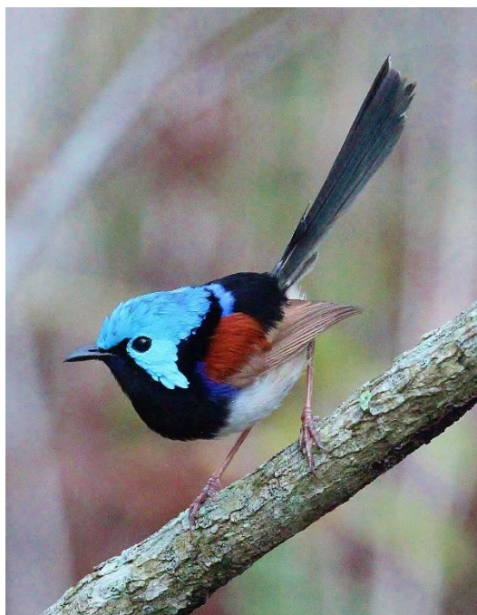
Variegated Fairywren

NIGHT (September 28): Pullman Sydney Hyde Park, Sydney