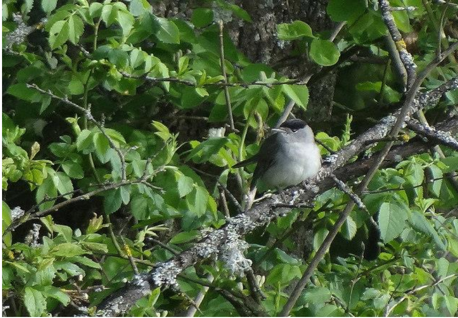
The somber appearance of the male Blackcap belies his estimable skills as a singer, to many ears excelling even the Nightingale as the most beautiful voice among European birds.

May 24, Day 5: The Lower Doubs. As the river Doubs crosses Burgundy on its way to the Saône, its waters slow and its course meanders, creating sandbars, gravel islands, and quiet shallows that attract an impressive array of nesting birds, from Little Ringed Plover to Blue-headed Wagtail. Common Kingfishers breed in the steep banks, while damp fields are the home of Yellowhammers and White Wagtails. Little and Great Crested Grebes build their floating nests on the oxbows, and Little Egrets and Gray Herons hunt the shallows.