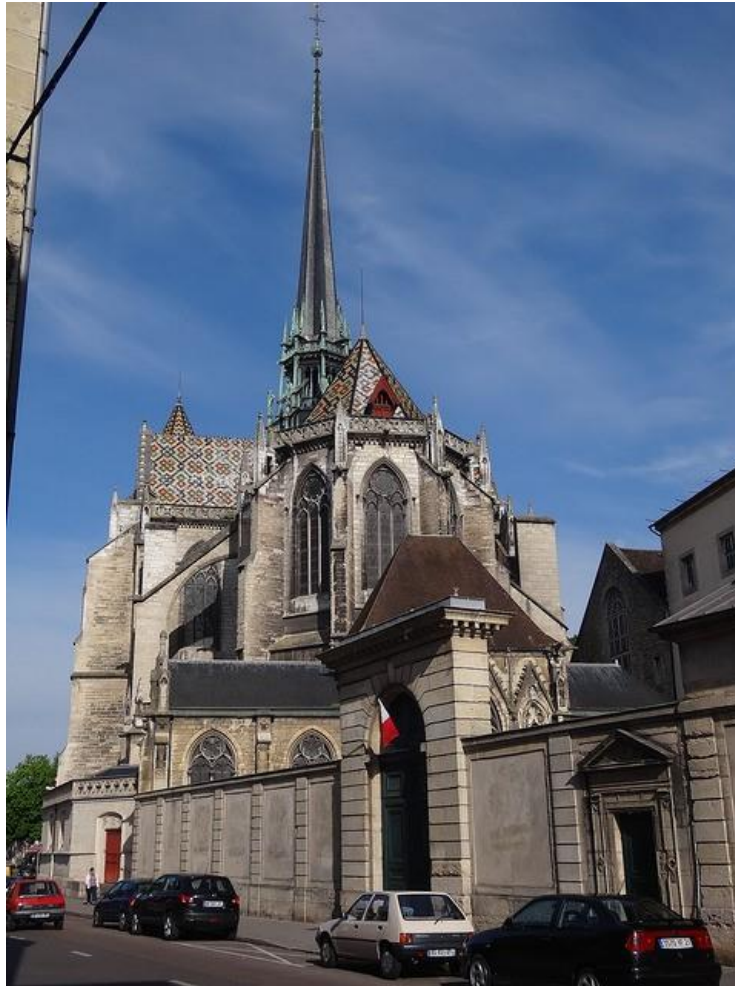
Saint-Bénigne is just one of the fine medieval churches of Dijon, the historic city that serves as the base for our tour.

For well over a thousand years, Europe's major pilgrimage routes have crossed the gentle hills and rolling fields of Burgundy. Six centuries ago, this rich and fertile duchy watered by the mighty Saône River was the site of bitter, often fatal contention between the French, the Burgundians, and the Flemish.