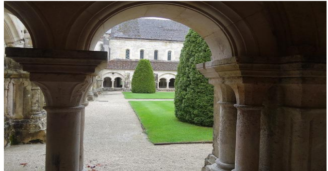
The lovely cloister of Fontenay is as peaceful today as it was 850 years ago.

For almost 50 years, Buffon held the prestigious position of intendant of the royal collections in Paris, but he much preferred working at his castle in Montbard, where he wrote and conducted experiments in fields from metallurgy to probability theory. We will pay our respects by searching the small park that now occupies the site for descendants of the Great Tits, Chaffinches, and Rooks once watched by the father of Enlightenment natural history.