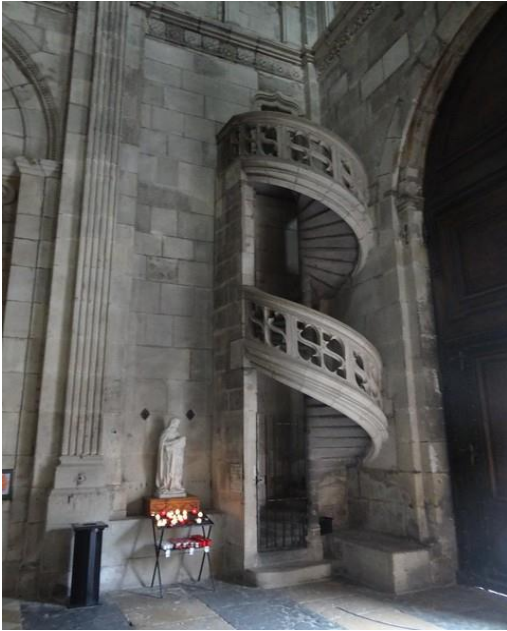
Autun.

May 26, Day 7: The Etangs d'Or II and the Archaeology Museum. At this time of year, bird populations shift quickly and unpredictably, and no two days at a site like the Etangs d'Or are ever the same. Those who wish can pay another early morning visit to the ponds and fields here, while others are welcome to make a more leisurely start into the day.