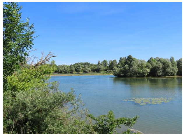
The Doubs River at Lays.

May 29, Day 10: Departures. You can arrange your departure from Dijon for any time today.