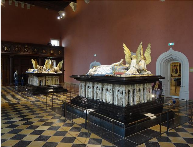
Claus Sluter's tombs for the Dukes of Burgundy are among the most famous pieces of Gothic art in the world.

May 22, Day 3: The Etangs d'Or and Dijon. Early risers can join an optional excursion to the shallow lakes and woodlands of the Etangs d'Or, a bit less than an hour from Dijon. Later in the summer, this area is overrun by human swimmers and splashers, but at this season we are likely to have the easy trails nearly to ourselves, with only the occasional fisherman to return our greetings. In addition to a wide range of migrants and residents on fields and in hedges, we will be looking especially for such classic wetland species as Little Bittern, Common Kingfisher, Penduline Tit, and Reed Bunting. Irregularly distributed and usually somewhat shy, Bearded Reedling is possible here and at several other sites on our itinerary.