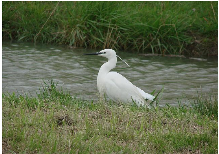
Little Egrets are often the commonest heron on the roadsides and marshes of Burgundy.

We'll spend the entire morning along the river, then have a late lunch nearby before returning to Dijon, where we should have time to continue our explorations of the city at our leisure before convening for dinner.