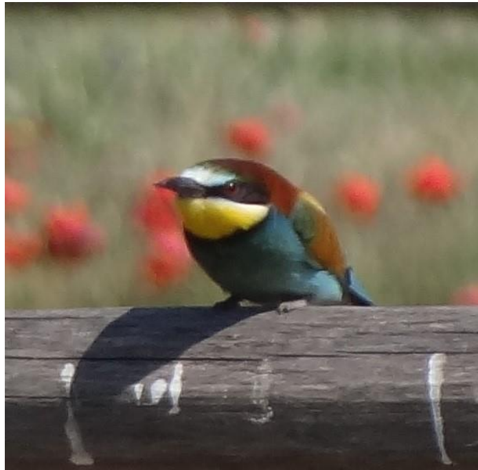
The sometimes elusive European Bee-eater is a colorful summer resident of open river lowlands.

May 25, Day 6: Buffon and Fontenay. The reputation of Georges-Louis Leclerc, Comte de Buffon, has risen and fallen and risen again since his death on the eve of the French Revolution. Hailed during his lifetime as one of the finest prose stylists France ever produced, he was equally honored as an intellectual, and no less a figure than Rousseau admiringly quotes Buffon's Natural History some 50 times. With the professionalization of science in the nineteenth century, Buffon's stock fell, and for much of the twentieth century, academic zoology dismissed him as simply a compiler with a good turn of phrase. Today, he is once again recognized as an innovator who anticipated many of the modern views of the relationship between organisms and their environment.