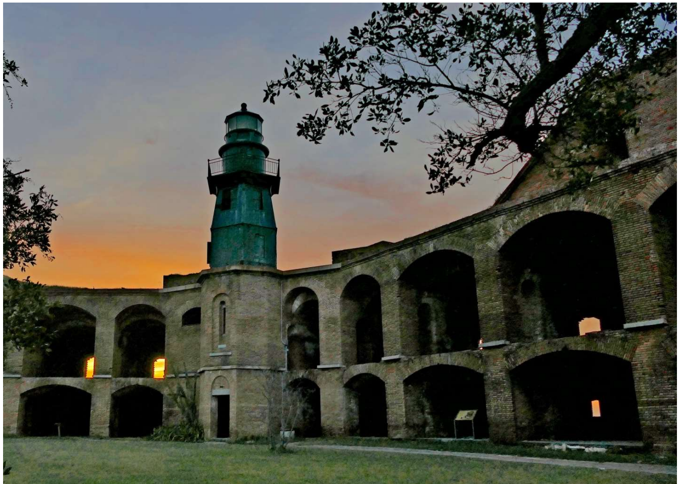
Sunrise within Fort Jefferson's Parade Grounds on Garden Key

This evening we'll enjoy our last Dry Tortugas sunset. We will take dinghy rides in small groups along Bush Key as thousands of terns and noddies sweep right past us, leaving their colony towards the open sea for feeding. We will also coast Long Key and get closer to the frigatebird colony. Hundreds of them will be hanging effortlessly over the mangroves; some of the males may be displaying inflated throat pouches. The dinghy runs often turn up