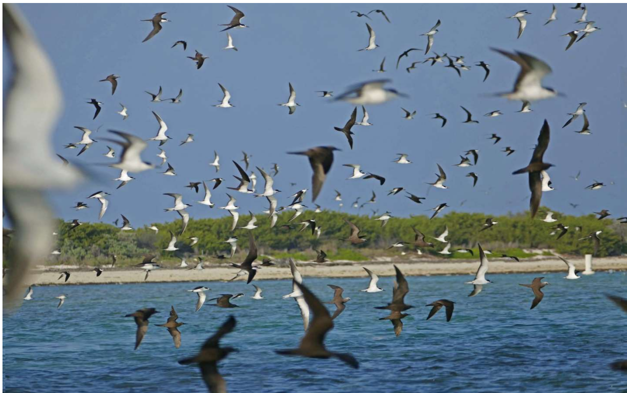
Sooty Terns and Brown Noddies streaming out of the colony at Bush Key.