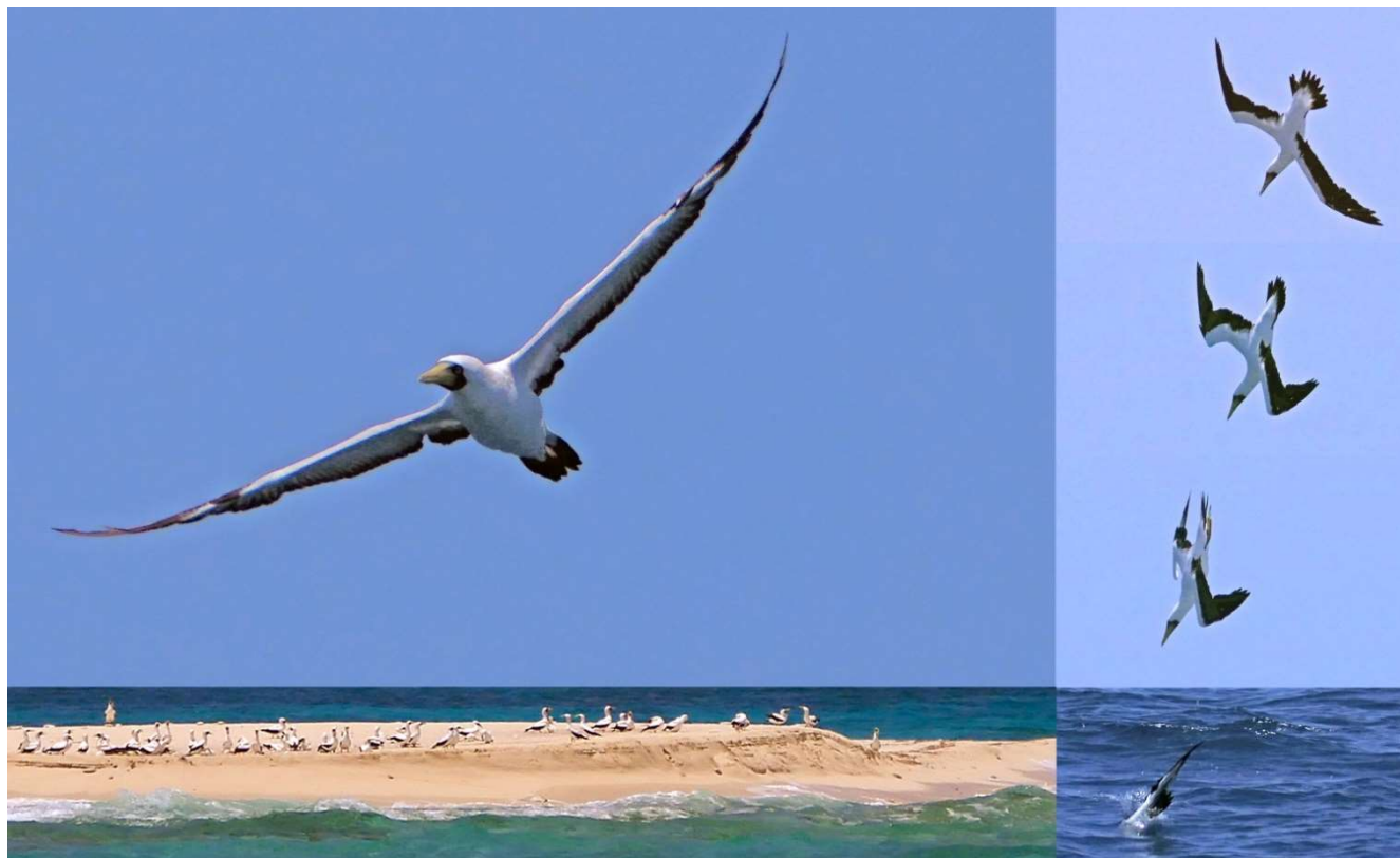
Masked Boobies nest on Hospital Key. It is their sole breeding colony in the U.S.

the birds we want to see. We can expect a late morning or early afternoon arrival to the archipelago. Before anchoring, we'll be sure to include a stop by tiny Hospital Key, the only site in the U. S. where Masked Boobies nest.