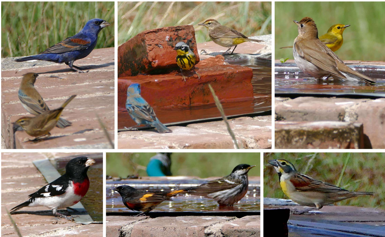
Many bird species including warblers, thrushes, buntings and others visit the fountain regularly.

Today, Fort Jefferson’s massive walls provide refuge not to armies of men, but to hundreds of exhausted trans-Gulf migrants. Its shores are visited not by conquering armies from foreign lands, but by birders, naturalists, fishermen, and curious visitors. The trees within its grounds are sometimes teeming with songbirds. As many as twenty species of warblers may feed among the foliage, while mute Cattle Egrets stalk scarce prey below.