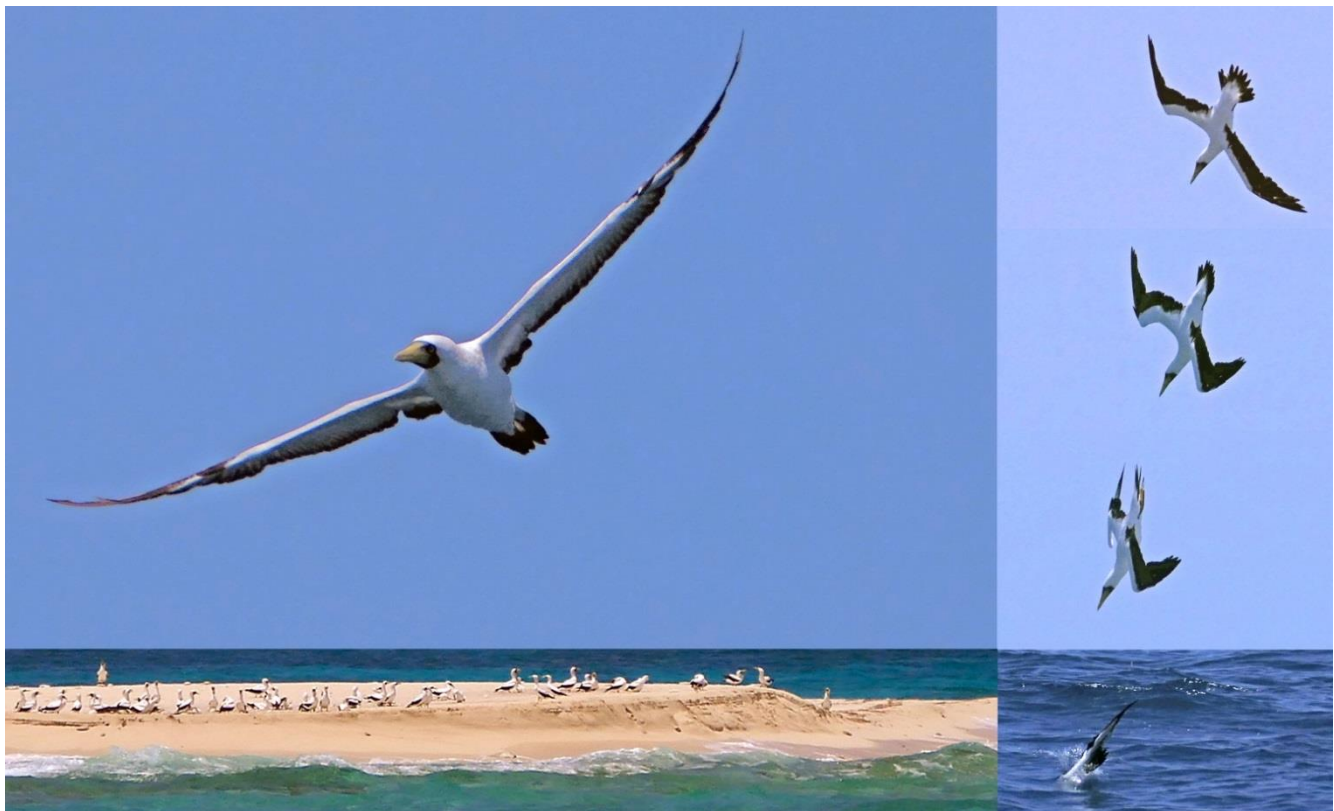
Masked Boobies nest on Hospital Key. It is their sole breeding colony in the U.S.

the birds we want to see. We can expect a late morning or early afternoon arrival to the archipelago. Before anchoring, we'll be sure to include a stop by tiny Hospital Key, the only site in the U. S. where Masked Boobies nest.