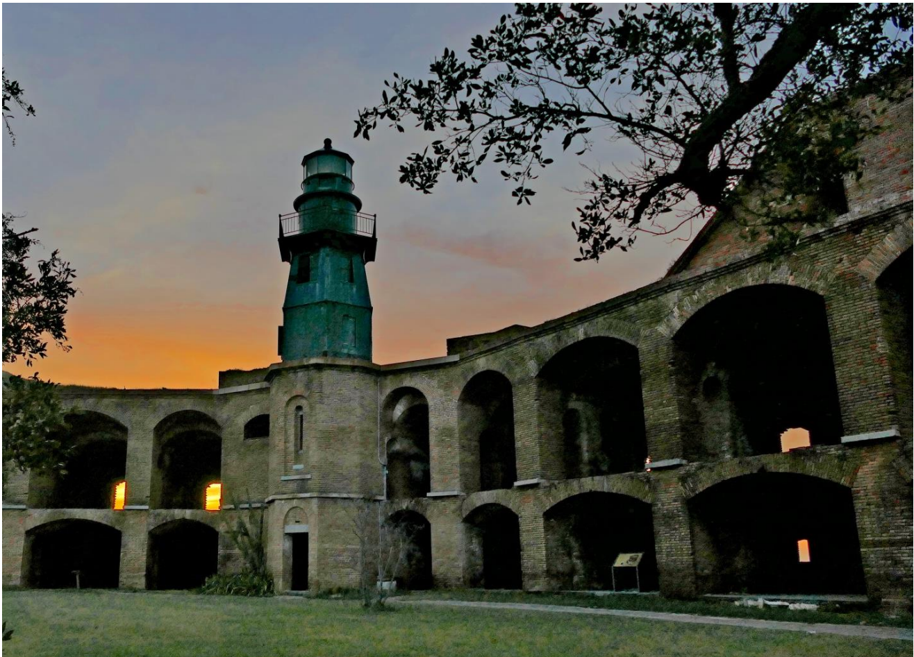
Sunrise within Fort Jefferson's Parade Grounds on Garden Key

The Tortugas are also a great place to see rarities. Highlights of previous trips have included White-tailed Tropicbird, Red-footed Booby, Black Noddy, LaSagra's Flycatcher, "West Indian" Cave Swallow, Bahama Mockingbird, Bananaquit and Shiny Cowbird.