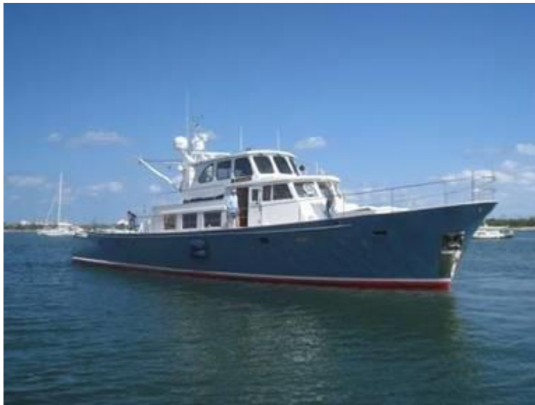
The M/V Makai