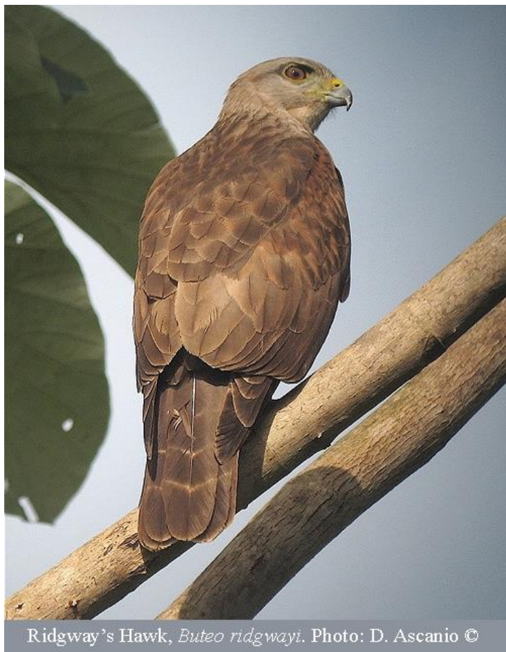
Ridgway's Hawk, Buteo ridgwayi .

Welcome to the Dominican Republic—an exciting Latin American country in the Caribbean featuring outstanding nature, a rich human history and, best of all, wonderful birding. Like other locations in the Caribbean, the Dominican Republic embodies the classic vacation in paradise: sandy beaches, palm trees, beautiful coastline, rugged mountains, and lush tropical forests. Add to this a splendid array of endemic or nearly endemic bird species and the picture is complete.