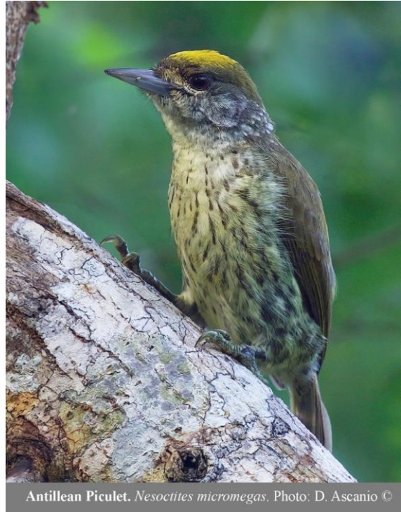
Antillean Piculet, Nesocittes micromegas .

Our second day in the area will see us on the farmlands neighboring the Bahoruco mountains. Here, we will look for Plain Pigeon, Antillean Euphonia, Greater Antillean Grackle, and White-fronted Quail-Dove (rare and unpredictable). For most of the day, we'll be birding the zone where thorn-scrub meets semi-evergreen, sub-humid forest. Birds are often plentiful, and we may see as many as 20 island and regional endemics this morning. Among our targets are the beautiful Hispaniolan Parrot, the solitary Hispaniolan Pewee, the comical Hispaniolan Lizard-Cuckoo, the extravagant Bay-breasted Cuckoo (infrequently heard, rarely seen), Black-crowned Palm-Tanager, Stolid Flycatcher, Zenaida Dove, Key West Quail-Dove and Antillean Piculet. Following a picnic lunch, we will head to the alkaline shore of nearby Lago Enriquillo. Lying to the north of the Sierra de Bahoruco is the Neiba Valley, a highly alkaline coral desert. Now 130 feet below sea level, this valley was once a strait of the Caribbean. What is left now is a massive body of water fed by about ten streams and rivers, but with no outlet! Evaporation is high and, as a result, the lake is three times as salty as the sea. Descending from the higher elevations, the view of the sprawling lake below us is one of great panoramic beauty. The deep valley is further highlighted by the view of the Neiba Mountains to the north. Photographic opportunities are plentiful here.