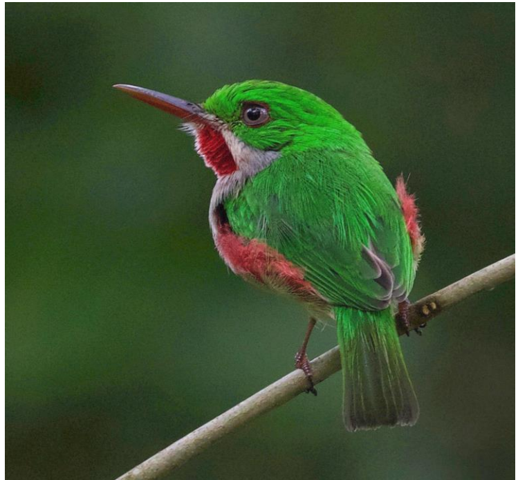
Broad-billed Tody. Todus subulatus.

This tour also includes an opportunity to search for the Ridgway's Hawk, considered to be the most threatened buteo in the world. For this endeavor we will journey to the northeast part of the island, to the buffer zone of Los Haitises National Park. Here, few known pairs of this critically endangered species hang on. Should there be a nesting site, we will surely be taken by a local guide, making our chances of finding the hawk good.