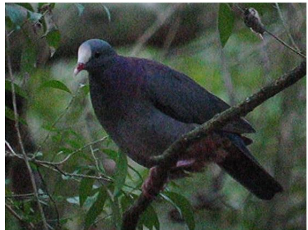
White-fronted Quail-Dove. Geotrygon leucometopia .

This first full day in the area will involve a 3:30 a.m. departure for the higher reaches of the Bahoruco. The early departure is necessary for taking advantage of birding in the early morning hours. At the middle elevations we might make a predawn search for the Least Poorwill and the Hispaniolan Nightjar, two rarely seen island endemics. As we reach the higher elevations (about 7,000 feet) the forest becomes much wetter, with magnificent, twenty-foot-tall tree ferns dominating the understory. The birdlife here is totally different. We will target the seldom-seen La Selle Thrush and Western Chat-Tanager, and may also spot Hispaniolan Emerald and Hispaniolan Spindalis, White-winged Warbler, Rufous-throated Solitaire (its haunting early morning song is ethereal in the dripping cloud forest), Greater Antillean Elaenia, Golden Swallow, and Antillean Siskin. The always shy White-fronted Quail-Dove is possible along the roadside in the early morning hours.