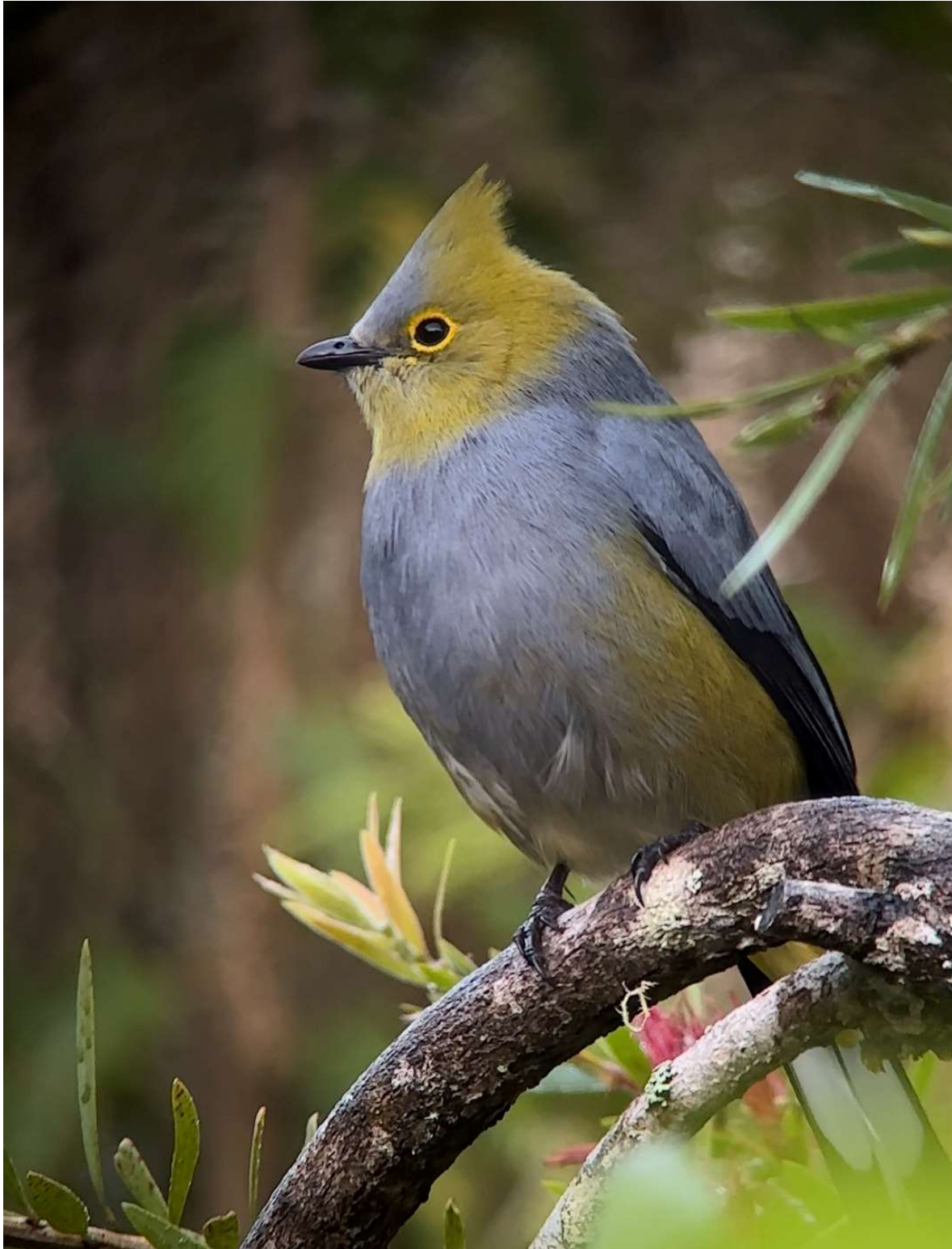
Long-tailed Silky-flycatcher ( Ptiliogonys caudatus ).

Chestnut-sided, and Blackburnian warblers. A pair of Rufous-naped Wrens serenaded us while a secretive pair of Mottled Owls were roosting inside a dense bamboo. What a charming birding welcome to Costa Rica!