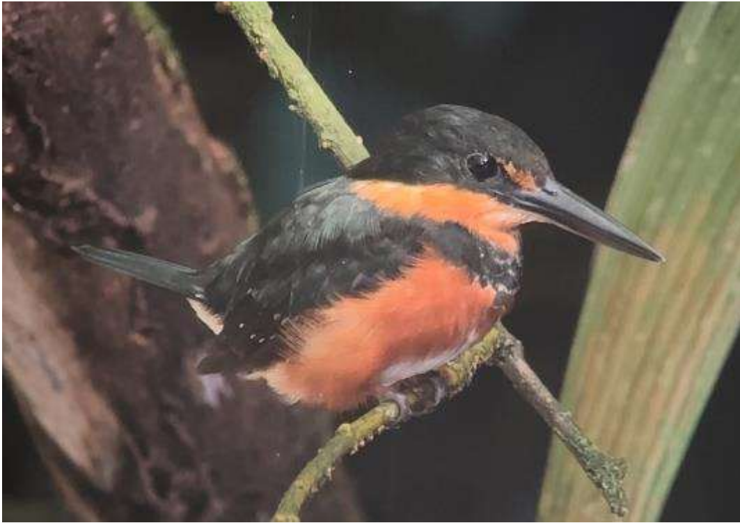
American Pygmy Kingfisher ( Chloroceryle aenea ).