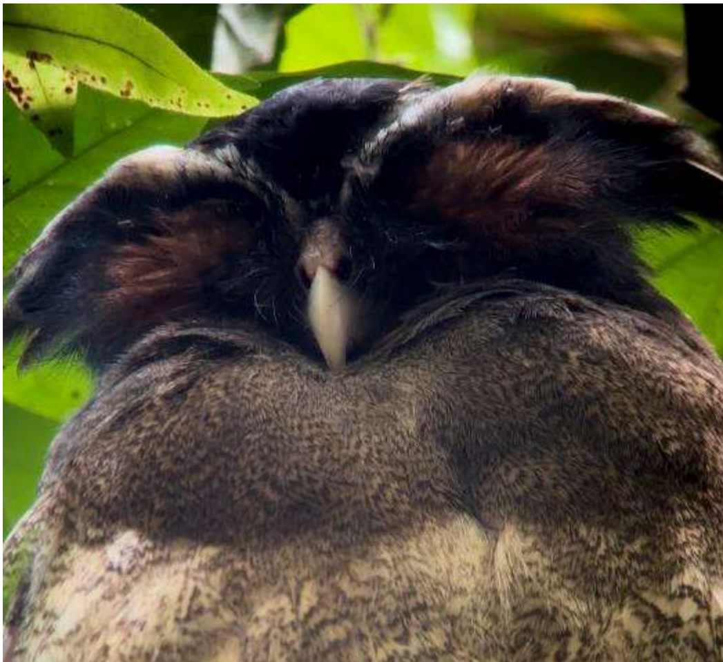
Crested Owl ( Lophotrix cristata ).