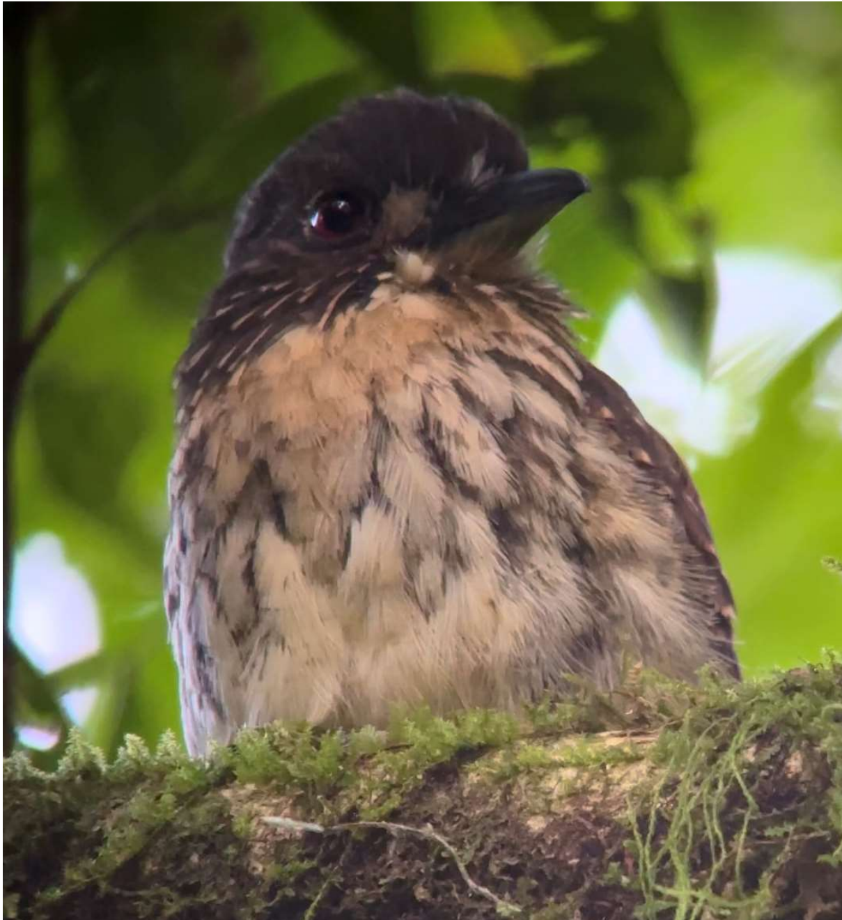
White-whiskered Puffbird ( Malacoptila panamensis).