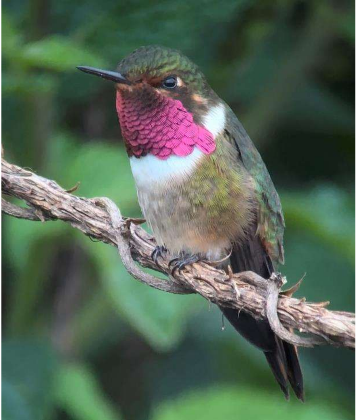
Magenta-throated Woodstar ( Philodice bryantae).

On the third day, we took a different route, leading to the mountain slopes and La Virgen del Socorro. A vocal Ornate Hawk-Eagle appeared in flight, as did White, Broad-winged, and Gray Hawks. Passerine birds were represented by Crimson-collared Tanager, Tawny-capped Euphonia, and Bay and Ochraceous Wrens. In the afternoon, we took a relaxing boat trip, and although we did not add many birds to the trip list, we still enjoyed repeated views of Mangrove Swallow, Ringed and Amazon Kingfishers, and Buff-rumped Warbler.