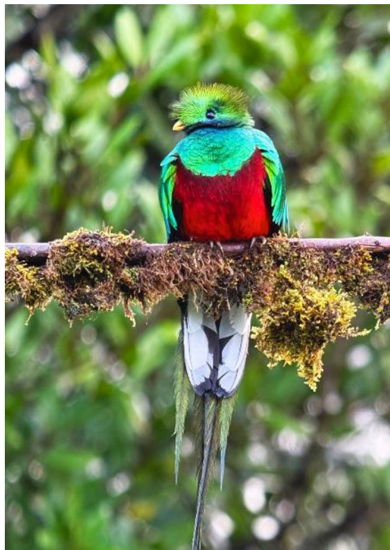
Resplendent Quetzal

The next morning, we traveled to a nearby finca in our quest for the Resplendent Quetzal. This time, luck was on our side. As we walked up to a lookout where quetzals had recently been seen, there was already a male Resplendent Quetzal perched on a distant branch. What unfolded over the next hour was truly memorable, as four quetzals, three males and a female, were in near constant view in glorious morning light, with some perched as close as 50 feet away! We were mesmerized by shimmering hues of emerald, ruby, and gold, their beauty amplified with scope views showing every feather detail. This amazing spectacle will long be remembered by all of us!