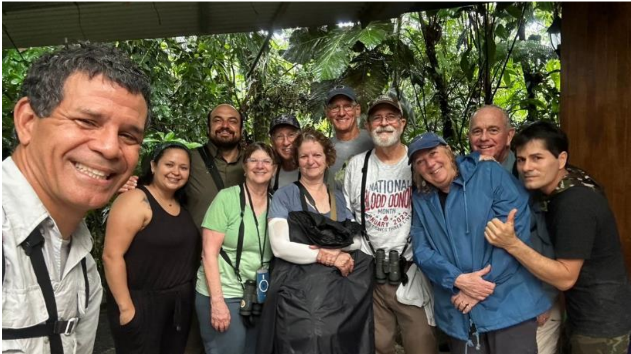
All smiles on VENT Costa Rica R&E tour, Cope's Garden, 22 Nov 2024