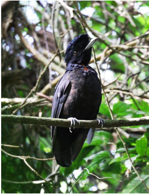
Bare-necked Umbrellabird © Brad

canopy. While riding the tram, we got incredible looks at birds in the canopy at eye level, with one group seeing a feeding flock consisting of Carmiol's, Tawny-crested, Speckled, Emerald, and Black-and-yellow tanagers. After exiting the tram at the turnaround point, we birded a winding trail and observed a variety of interesting birds, including Semiplumbeous Hawk, three manakin species, several flycatchers, antbirds, and warblers. As we were watching a Red-capped Manakin, one of the local guides informed us that he had just seen a Bare-necked Umbrellabird about 200 yards down the trail. As luck would have it, the bird was still present where it had last been seen, providing our group with outstanding looks at a locally rare species with a very limited range. What an incredible bird!