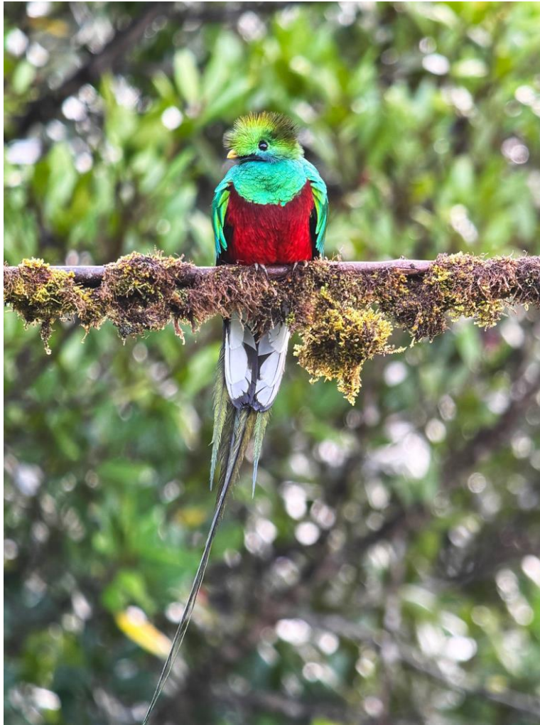
Resplendent Quetzal