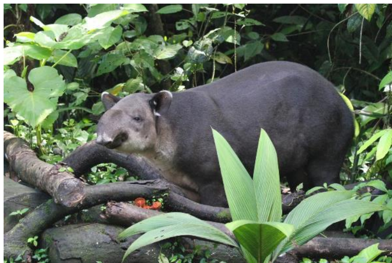
Baird's Tapir