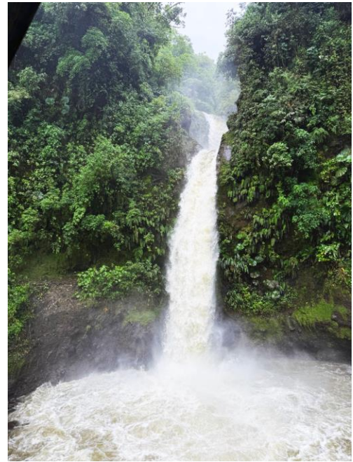
Peace Waterfall

Great weather, incredible birds, and wonderful camaraderie were the theme of the week as we began our Costa Rica Relaxed & Easy tour in San Jose. Nestled in the bustling Central Valley's ring of volcanoes lie the beautiful gardens of Hotel Bougainvillae where we were introduced to many beautiful Neotropical birds during our pre-breakfast bird walk, including Lesson's Motmot, Masked Tityra, and Chestnut-capped Warbler. Soon we were off to the scenic highlands of Cerro de la Muerte in search of the Resplendent Quetzal and other high-elevation specialties. It seemed that every other bend in the road had a fern-laden waterfall dripping down the cliff faces, and it wasn't long before our birding adventure began on an easy hike through primary forest that led to a delightful local restaurant with several hummingbird feeders out back. On our bird walk we got great looks at several regional endemics, birds found only in Costa Rica and western Panama, including Black-capped Flycatcher, Black-