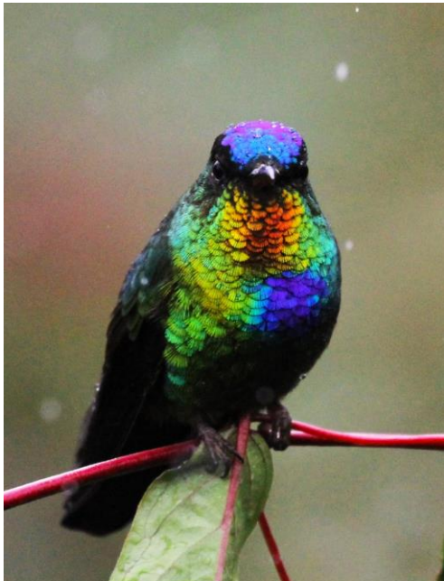
Fiery-throated Hummingbird

billied Nightingale-Thrush, and Spangle-cheeked Tanager. As the light drizzle let up, the hummingbird feeders were buzzing with a frenzy of activity. Talamanca and Fiery-throated hummingbirds were perched just feet away, their dazzling iridescence making it difficult to sit down for lunch!