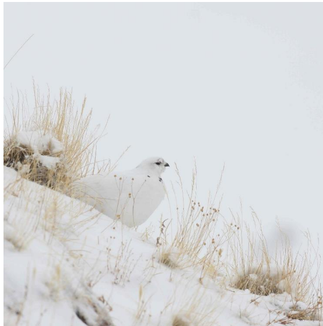
White-tailed Ptarmigan

a local non-profit and we have no access to a bathroom from the blind until we are released by the Siskadee volunteer. We will break up the long drive to Denver with lunch and more birds. Loveland Pass at 12,000 feet hosts White-tailed Ptarmigan in the springtime; we hope to find one if the weather allows. We will then make our way to the Courtyard Marriott where we started this epic journey.