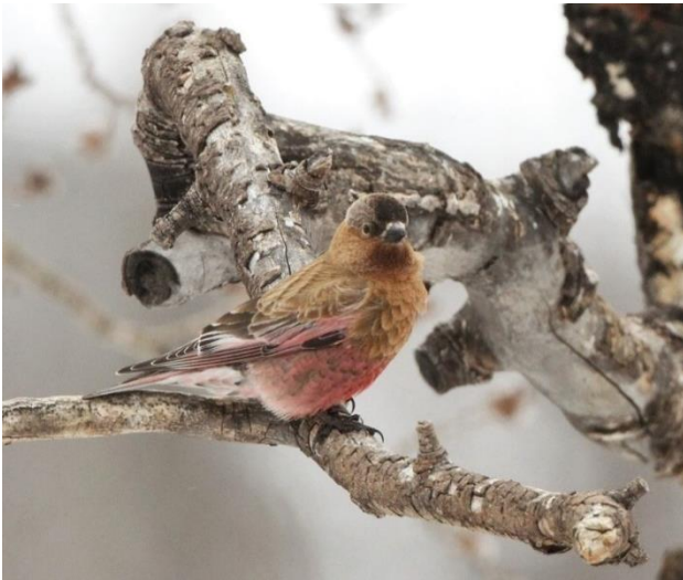
Brown-capped Rosy-Finch © Brian Gibbons

Airport. A pre-dawn start will take us to the final grouse lek, this one for the recently described and declining Gunnison Sage-Grouse. With its strange filoplume crest, more prominently banded tail, smaller size than the Greater Sage-Grouse, and tiny range (basically restricted to southwestern Colorado), this newly recognized species has instantly become one of the most endangered birds of North America. Though this lek is distant, we should have scope views of the Gunnison Sage-Grouse in their outrageous display. After the morning display by the sage-grouse, we will bird into the mountains surrounding the Gunnison Valley. Some of our targets will be rosy-finches, grosbeaks, American Three-toed Woodpecker and Canada Jay. Note: Viewing the Gunnison Sage-Grouse will be from a blind and we will be inside from around 5:00 a.m. until the grouse depart the lek area. (Sometimes not until after 8:00 a.m.) This is regulated by