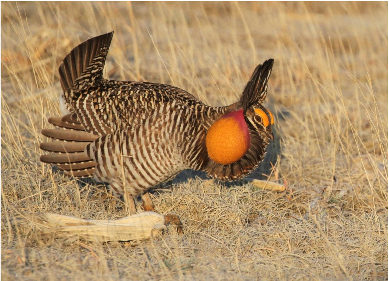
Greater Prairie-Chicken in display

NIGHT: Best Western El Quartejejo Inn and Suites, Scott City