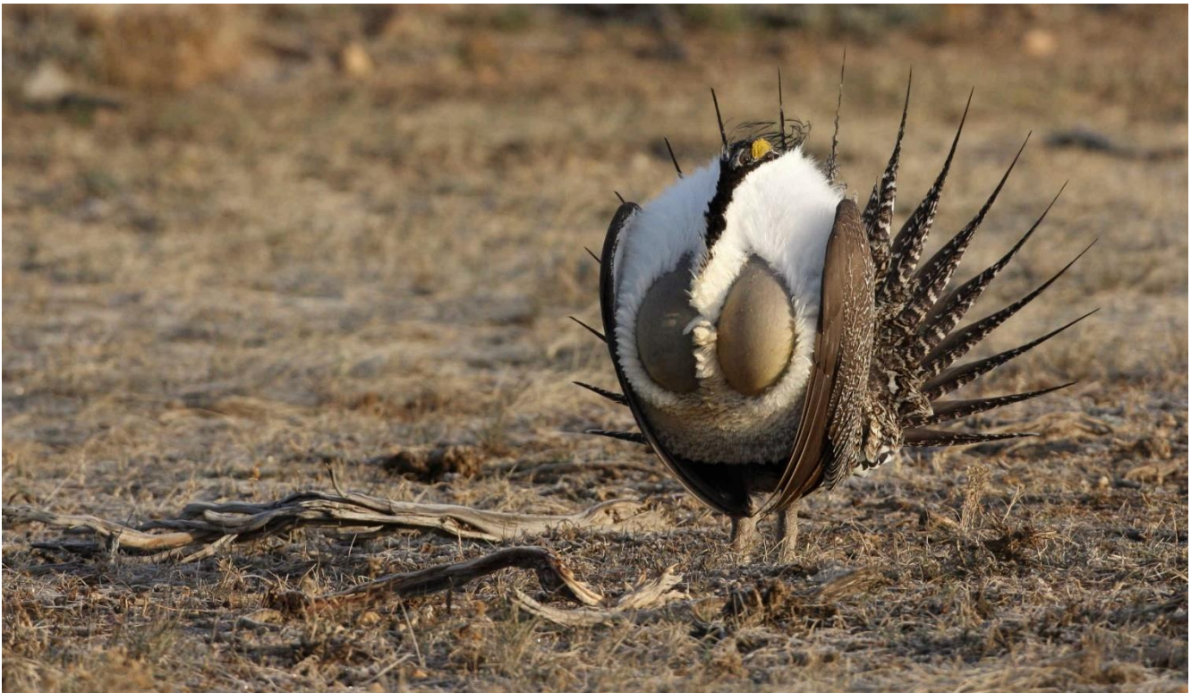
Greater Sage-Grouse display

April 6, Day 6: Steamboat Springs to Walden. Another early morning will have us searching traditional leks for Sharp-tailed Grouse. Although smaller and less physically imposing, they have the most arresting dance. With tails held high, wings bowed out to the sides, and feet propelling them in circles, they resemble wind-up toys run amok. Imitated by the Plains Indians, this dance is an integral part of spring on the northern prairies. In the rolling grasslands nearby, Sandhill Cranes and Western Meadowlarks enliven the scene. Along the way to Walden we will search a few spruce forest areas for American Three-toed Woodpecker, Pine Grosbeak and Clark's Nutcrackers before continuing towards Walden. After crossing Rabbit Ears Pass, we'll descend into North Park, a region of sweeping vistas where snow-covered mountains provide a backdrop for marshy meadows and mint-green sagebrush hills. Sage Thrashers dart between shrubs; Mountain Bluebirds add dazzling touches of color to the landscape; and in some years, roadside snowbanks or local feeders may hold lingering rosy-finches. Raptors (particularly Golden Eagle, Rough-legged and Swainson's hawks, but also an occasional Prairie Falcon) should be quite evident. Mammal possibilities for the day include Moose, Pronghorn, Mule Deer, and White-tailed Prairie Dog.