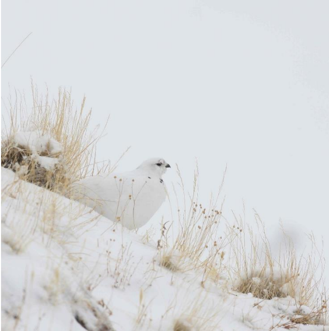
White-tailed Ptarmigan

April 2, Day 2: Depart Denver; Birding Loveland Pass and Silverthorne; Drive to Gunnison. This morning we will meet in the hotel lobby at 6:00 a.m. to depart for the west side of town where we will have breakfast. We will then head into the mountains for our first attempt to see the White-tailed Ptarmigan at Loveland Pass at 12,000 feet. Nearby in Silverthorne we will hunt Rosy-Finches and other high elevation birds before heading southwest to Gunnison.