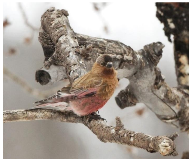
Brown-capped Rosy-Finch © Brian Gibbons

April 5, Day 5: Grand Junction to Steamboat Springs. In the morning we will explore the red rock canyonlands of Colorado National Monument searching for Pinyon Jays, Juniper Titmouse and Black-throated Sparrows among the junipers and pinyon pines of this beautiful, stark landscape.