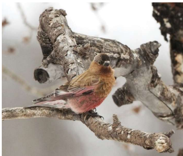
Brown-capped Rosy-Finch

In the morning we will explore the red rock canyonlands of Colorado National Monument searching for Pinyon Jays, Juniper Titmouse and Black-throated Sparrows among the junipers and pinyon pines of this beautiful, stark landscape.