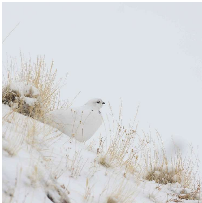
White-tailed Ptarmigan

April 9, Day 2: Depart Denver; Birding Loveland Pass and Silverthorne; Drive to Gunnison. This morning we will meet in the hotel lobby at 6:00 a.m. to depart for the west side of town where we will have breakfast. We will then head into the mountains for our first attempt to see the White-tailed Ptarmigan at Loveland Pass at 12,000 feet. Nearby in Silverthorne we will hunt Rosy-Finches and other high elevation birds before heading southwest to Gunnison.