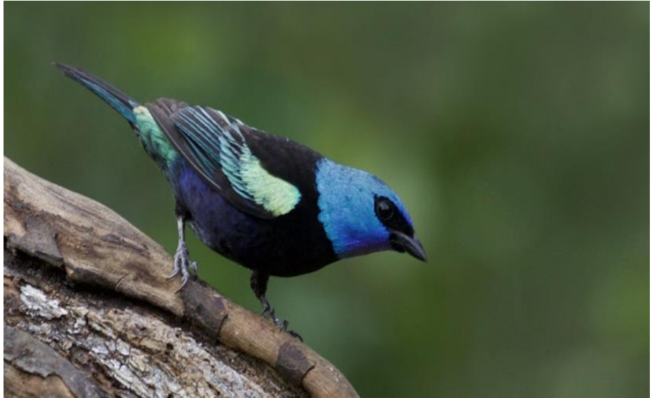
Blue-necked Tanager ( Tangara cyanicollis )

July 20, Day 8: From Jardín to Medellín. After breakfast, time allowing, we may pay a second visit to the mountains surrounding Jardín, and for that we will again use the reliable chiva . But this time we will focus our birding at a lower elevation where the edge of lush cloud forest mixes with some clearings. This location has been famous in the past to look for Golden-headed Quetzal and Black-billed Mountain-Toucan. With fingers crossed, we may come across feeding flocks, and that would include the astonishing Grass-green Tanager as well as several of the wonderful members of the Tangara genus including Blue-and-black, Beryl-spangled, Blue-necked and Saffron-crowned tanagers. Around the flowering bushes, we may see Collared Inca and Long-tailed Sylph. Larger birds also can be found such as Andean and Sickle-winged guans or Southern Emerald Toucanet. In some years we have seen a family group of Mountain Cacique and in other years a pair of the vocal Strong-billed Woodcreeper. Upon returning to the hotel at noon, we will depart for Rionegro and will enjoy another delicious local lunch as we increase our chances to add more birds to our trip. After lunch, we will continue on to Rionegro. Time allowing, we will make stops along the way to enjoy the scenery or continue birding along the road.