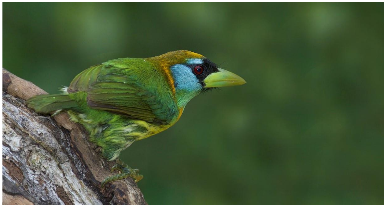
Red-headed Barbet ( Eubucco bourcierii )

Upon our return to the hotel, we will take a short break before visiting Finca La Bambusa , a family-owned property with bird feeders that usually attract Red-headed Barbet and Colombia Chachalaca, another bird endemic to Colombia, as well as Crowned Woodnymph and Green Hermit, which have been regular visitors to the hummingbird feeders in previous years.