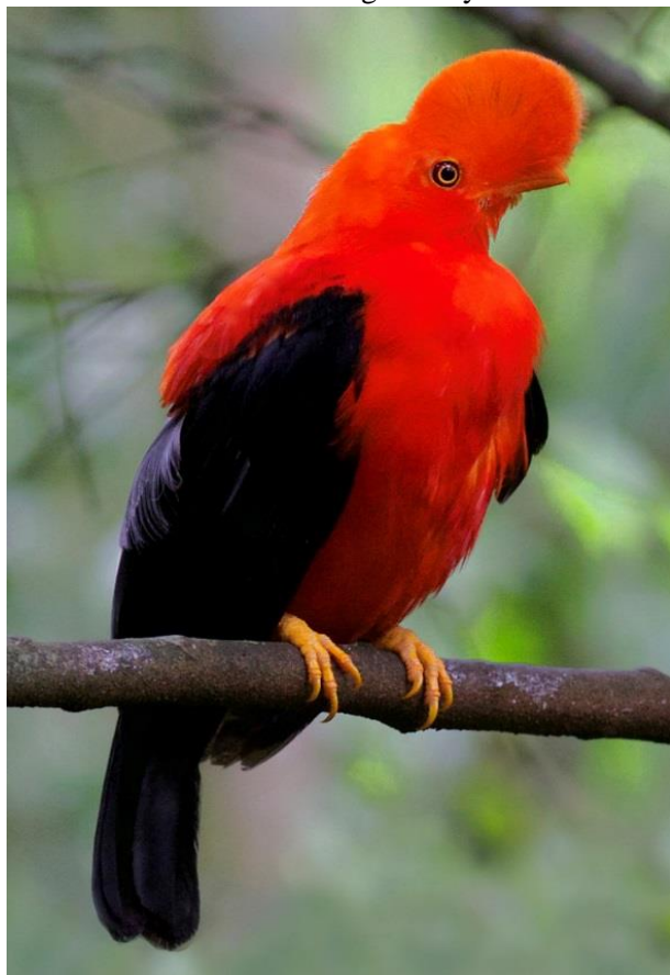
Andean Cock-of-the-rock ( Rupicola peruviana )

After a mid-day break, one afternoon we will go birding on roads cutting forest edge, secondary growth and farmland. This will give us an opportunity to look for Chestnut-fronted Macaw, Blue-headed Parrot and Cinnamon Becard. We will also keep looking for Black Antshrike and might come across Large-billed and Chestnut-bellied seed-finches. In contrast, on another morning we will visit a farmland contiguous to the Magdalena River, where we will explore wetlands and extensive grasslands. Here we will have the opportunity to look for Yellow-chinned Spinetail, Black-bellied Whistling-Duck, various species of egrets and herons, several tyrant-flycatchers, and Bare-faced Ibis. In previous years we have enjoyed amazing views of Dwarf Cuckoo, with its beautiful peach-colored throat. This morning usually stands out as one of the tour favorites.