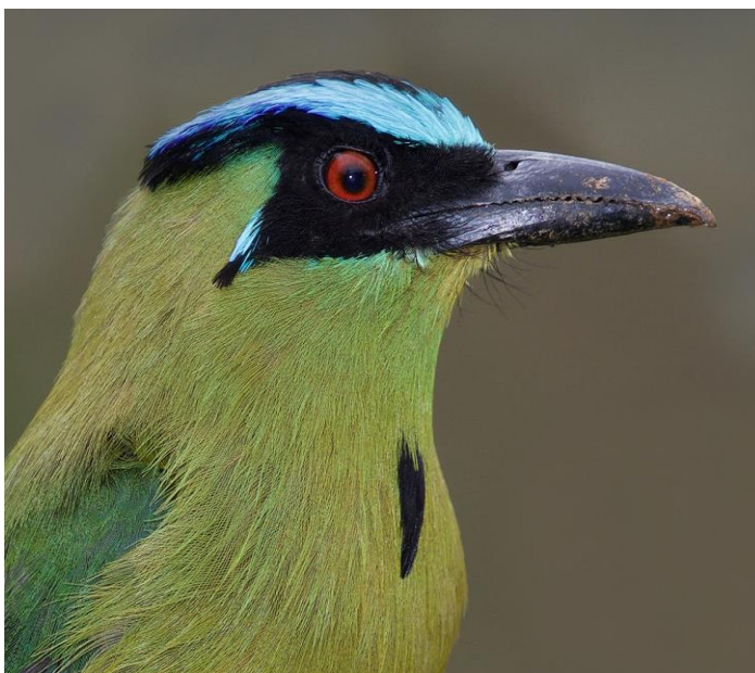
Andean Motmot ( Motmotus aequatorialis)

The Cañón del Río Claro private reserve will be our birding site in the Magdalena River Valley. This area preserves some of the very last portions of forest along the Río Claro watershed and what a gem! First, it is home for the very last remnant of tropical dry and moist forests growing on karstic formations in this part of the country. Second and most important, it hosts endemic birds such as White-mantled Barbet, Magdalena Antbird (also found in Venezuela), Sooty Ant-Tanager and Beautiful Woodpecker. One species that has been briefly seen on previous VENT tours is the Antioquia Bristle-Tyrant, another Colombian endemic that was described back in 1988. Although