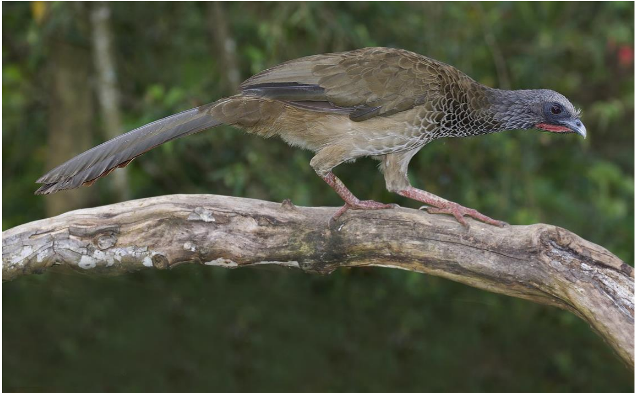
Colombian Chachalaca ( Ortalis columbiana)

Colombia is one of the most bio-diverse countries in the world. It hosts an amazing number of biomes, from high-peak mountains in the Andes to extensive flatlands and Amazonian rainforest. Along with such richness, Colombia now claims to be the country with the largest avifauna of all. At this writing, the South American Classification Committee (SACC) website shows an astonishing list of 1,863 bird species! Add its recent history of political stability and peace-culture, and you'll understand why Colombia is now a dream destination for birders and nature lovers alike.