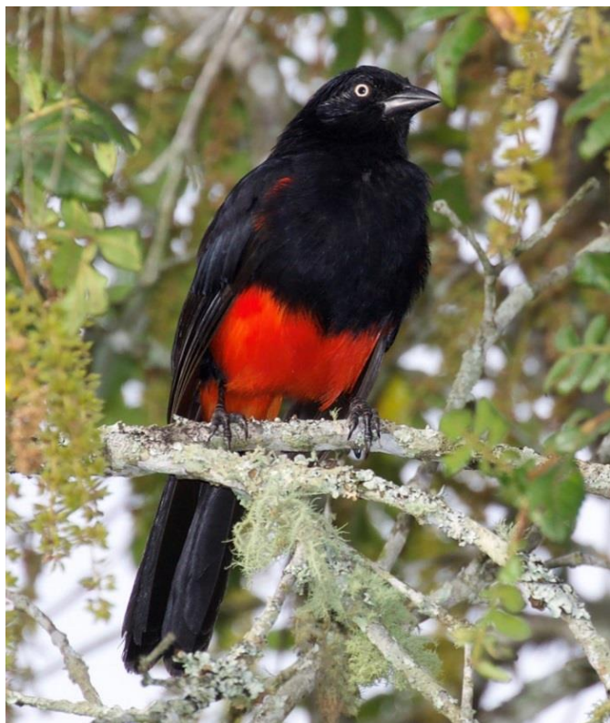
Red-bellied Grackle ( Hypopyrrhus pyrohypogaster )

NIGHT: Movich Hotel las Lomas, Rionegro, dept. of Antioquia (7,000 feet elevation)