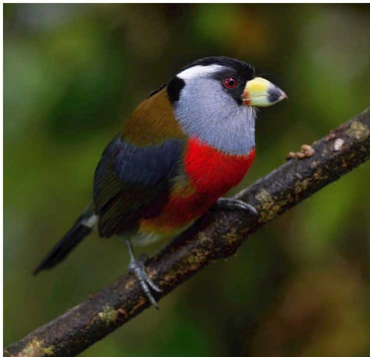
Toucan Barbet

December 10, Day 8: Return to Cali; Departure for Home. An optional early morning walk around the lodge gardens will allow us to search for Slaty Spinetail, which usually keeps out of sight. Also, a nice assortment of colorful birds may show up on the bird table including Crimson-backed, Blue-gray, Palm and Flame-rumped tanagers. The forest edge surrounding the lodge hosts other more insectivorous avifauna such as Streaked Xenops, Yellow-olive Flycatcher, Chivi Vireo and Black-billed Peppershrike, the latter being a great consumer of chili peppers!