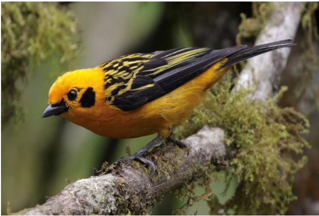
Golden Tanager ( Tangara arthus ) © D. Ascanio

and that includes Grayish Piculet, and Parker's Antbird (previously considered part of Dusky Antbird). Other more widespread but interesting species include Uniform Antshrike, Choco Daggerbill (previously part of Wedge-billed Hummingbird), Black-billed Peppershrike and Black-headed Brushfinch. In the afternoon, we will explore mountain rivers and hope to see an Andean Cock-of-the-rock commuting from a foraging ground to a fruiting tree or even to the lek, where young males continue to display almost year-round. Our field list may round-up several tanagers for today, and that includes White-lined, Rufous-throated, Scrub, Bay-headed, Golden and Metallic-green tanagers.