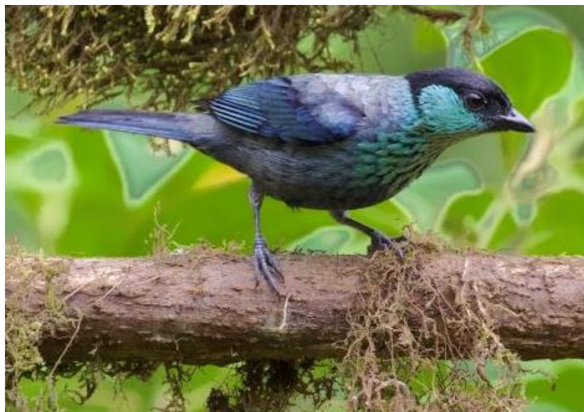
Black-capped Tanager ( Tangara heinei )

NIGHT: Araucana Lodge, dept. of Valle del Cauca (1,600 meters – 5,600 feet elevation)