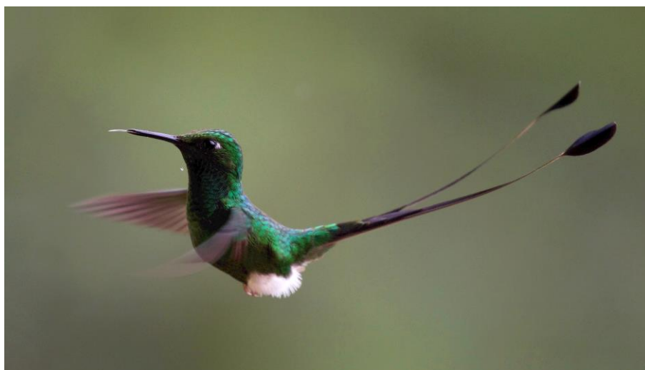
Booted Racquet-tail

we will explore the gardens and trails surrounding the lodge where White-necked Jacobin fans its tail frequently to set its foraging territory and a Green Hermit visits the feeders with irregular intervals. Also, the wonderful Black-throated Mango will be seen in both male and female plumages. In addition, Andean Emerald will come cautiously because he will have to deal with a territorial Steely-vented Hummingbird that will be defending the feeder from intruders (namely, any other hummingbird species).