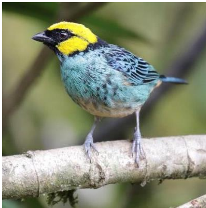
Saffron-crowned Tanager ( Tangara xanthocephala )

December 8, Day 6: La Florida and Bosque de Niebla. After breakfast we will take a short drive to La Florida, a small property hosting forest bird species that are normally labeled as “impossible-to-see.” This site has become famous for having a feeder where Chestnut Wood-Quail comes for few minutes right after dawn. Although there are mornings when this secretive species won’t show up, we believe that it’s worth the effort to try to see it. In the same area we have also seen another astonishing bird, the White-throated Quail-Dove.