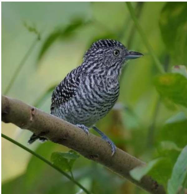
Bar-crested Antshrike ( Thamnophilus multistriatus )

We will then start ascending the Andes to Finca La Huerta, a small inn that allows us to visit a cloud forest birding location—the protected area of the Río Bravo. Birding the road that crosses this impressive patch of forest will give us the opportunity to look for Crowned Woodnymph and White-throated Wedgebill as well as colorful birds such as Andean Motmot; Red-headed Barbet; and Bay-headed, Metallic-green, Scrub and Golden tanagers. Also, the distribution-restricted and Colombia endemic Crested Ant-Tanager can be seen here as well as Uniform Antshrike and Black-winged Saltator. As we search for birds, we will be serenaded almost continuously by the musical voice of the Andean Solitaire and the repetitive notes of the Black-billed Peppershrike. We might come across feeding flocks that may include Grayish Piculet, Golden-olive Woodpecker, Montane Woodcreeper and Red-faced Spinetail. There is a small bridge where we have seen Andean Cock-of-the-rocks in flight. After two nights