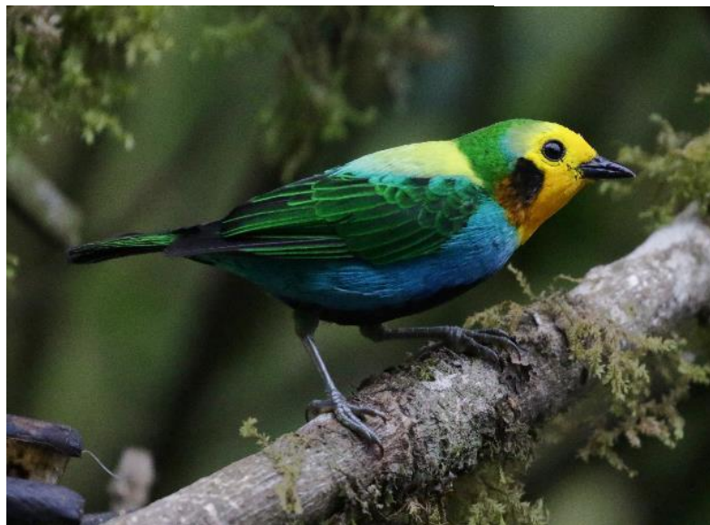
Multicolored Tanager ( Chlorochrysa nitidissima )