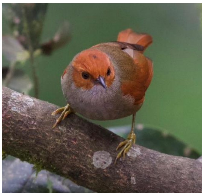
Red-faced Spinetail ( Cranioleuca erythrops )

This tour is one in our series of Relaxed & Easy tours. These tours are appropriate for participants who want a slower paced tour, with somewhat fewer hours in the field and lighter physical activity. They are ideal for persons who prefer a somewhat later start in the morning (typically between 6:00-6:30 a.m.), a break after lunch and a shorter afternoon outing. They typically involve shorter walks, usually less than a mile, and avoid difficult terrain.