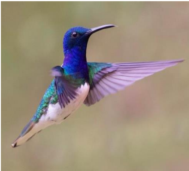
White-necked Jacobin ( Florisuga mellivora )

Given its impressive avifauna, Colombia is the dream destination for birders all over the world. Part of this richness is due to the branching of the imposing Andes into three ranges, called the Eastern, Central and Western Andes. Two rivers dissect the valleys between these mountains and given the altitudinal factor, it has triggered a rich process of endemism. Considering the presence of steep slopes and species associated with each altitudinal level, most tours must start their daily routine before dawn and usually stay in the field until dusk. But that is not the case on this tour! We have found the perfect match of lodges and hotels to offer a relaxed & easy tour that will expose you to the best birding of the Western Andes and provide the opportunity to see several species of hummingbirds and tanagers at bird feeders without