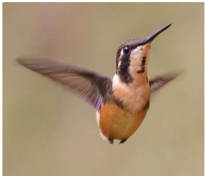
Purple-throated Woodstar ( Calliphlox mitchellii )

After breakfast we will start driving back to the Cauca Valley to ascend the Western Andes again, but this time along the old Cali-Buenaventura Road. Here the forest patches are larger although threatened by agricultural projects. We will stop for lunch in a local restaurant called " Aquí me quedo " (restaurant name translates to "I am going to stay here"). Because the terrace faces the canopy of some forest edge vegetation, there will be chances for seeing canopy species at eye level, including the Red-faced Spinetail and Golden-faced Tyrannulet. Besides having the opportunity to see canopy dwellers, we will enjoy close hummingbird views of White-necked Jacobin, Brown Violetear, Bronzy Inca, Booted Racket-Tail, Fawn-breasted Brilliant, Crowned Woodnymph, Andean Emerald, Rufous-tailed Hummingbird and the bumble-bee sized Purple-throated Woodstar!