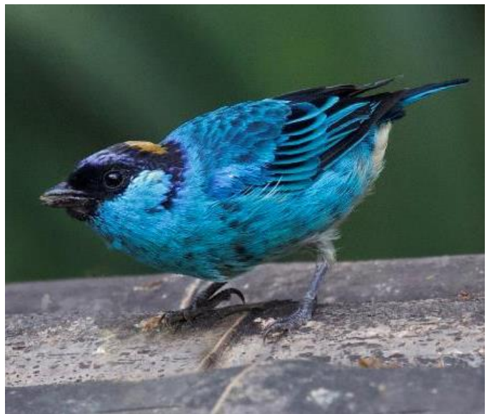
Golden-naped Tanager ( Tangara ruficervix )

The second lodge will allow us to visit four birding areas. From the comfortable Araucana Lodge we plan to make daily drives to La Minga, La Florida, Doña Dora bird feeders and Bosque de Niebla in the famed El Kilometro 18 or “KM 18” area. Each location will offer new hummingbirds and tanagers as well as other birdlife. Collectively, we should get about 20 species of hummingbirds and more than 20 species of tanagers, including Saffron-crowned, Golden, Bay-headed, Blue-capped, Golden-chested and Golden-naped tanagers. The drive to the Anchicaya road will expose us to other fascinating birds such as the Toucan Barbet, Torrent Duck, Violet-tailed Sylph and White-capped Dipper. During our tour, we plan to have breakfast at 6:00 am, followed by birding sessions at feeding stations, forest edges, roadsides, and wetlands. When not moving between locations, we will enjoy resting time after lunch and will resume our birding in the afternoon. There will be no strenuous walks or steep trails. There will be an optional night outing. VENT has offered tours to various locations in Colombia since 2009 and our program offerings continue to grow. A booming economy and well-established peaceful culture that has called victory over violence will reshape your view of Colombia and its efforts towards long-lasting peace.