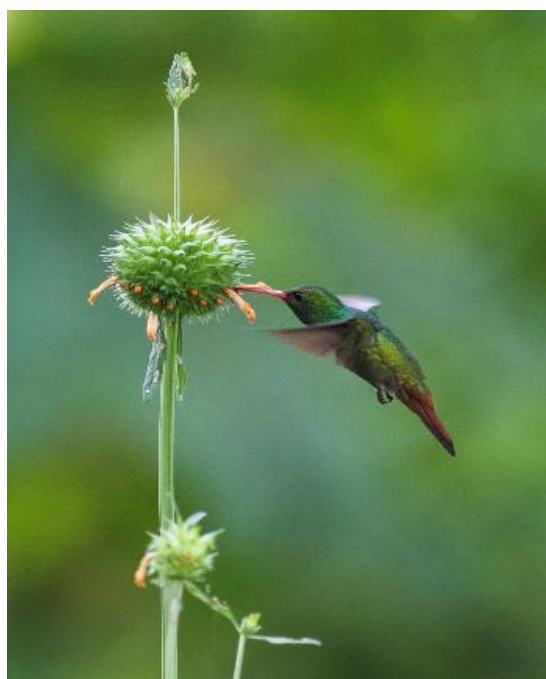
Rufous-tailed Hummingbird ( Amazilia tzacatl )

December 7, Day 5: La Minga. Following breakfast, we will load our van and drive for about a bit more than an hour to a wonderful little paradise, La Minga. Surrounded by primary forest of the Río Bitaco reserve, this is the prime site to look for the astonishing Multicolored Tanager. But, aside from this amazing species, the list of wonderful species found here will drop your jaw! Starting with toucanets and motmots and continuing with a parade of hummingbirds that include Green and Tawny-bellied hermits, Long-tailed Sylph, Brown Violetear, White-necked Jacobin, Bronzy Inca, and Speckled and Steely-vented hummingbirds. The birdlist also includes equally colorful birds such as Blue-winged Mountain-Tanager; Saffron-crowned, Golden, Scrub and Black-capped tanagers; and Green Honeycreeper as well as Rusty and Masked flowerpiercers. We will enjoy lunch here and relax in the gardens of the lodge before heading back to Araucana, although it will be hard to leave this wonderful site.