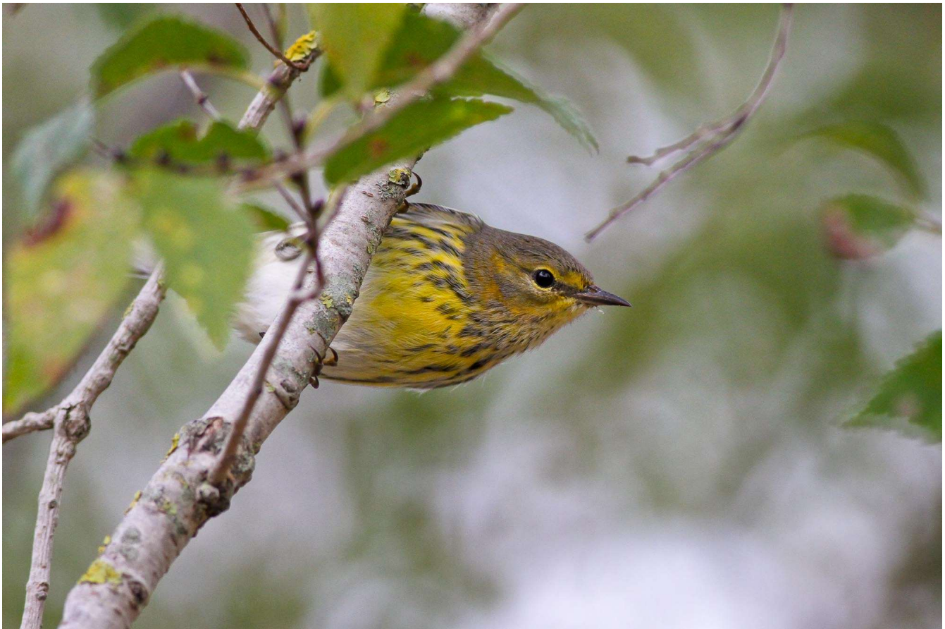
Cape May Warbler

As the sun gets higher, we will head to Cape May Point, the prime vantage point for observing the passage of southbound raptors. Here, land abruptly ends where the Atlantic Ocean meets Delaware Bay. Birds making their way south along the coast arrive at the Point and must decide whether or not to strike out over open water. A few, particularly Peregrine Falcon, Northern Harrier, and Bald Eagle, continue unhesitatingly, but many “stack up” over Cape May and size up the situation more carefully. As a result, one can often see hundreds, sometimes thousands, of hawks in a single day. Raptor diversity is also excellent in late September and, with luck, we could see the peak movement of Merlin and Peregrine.