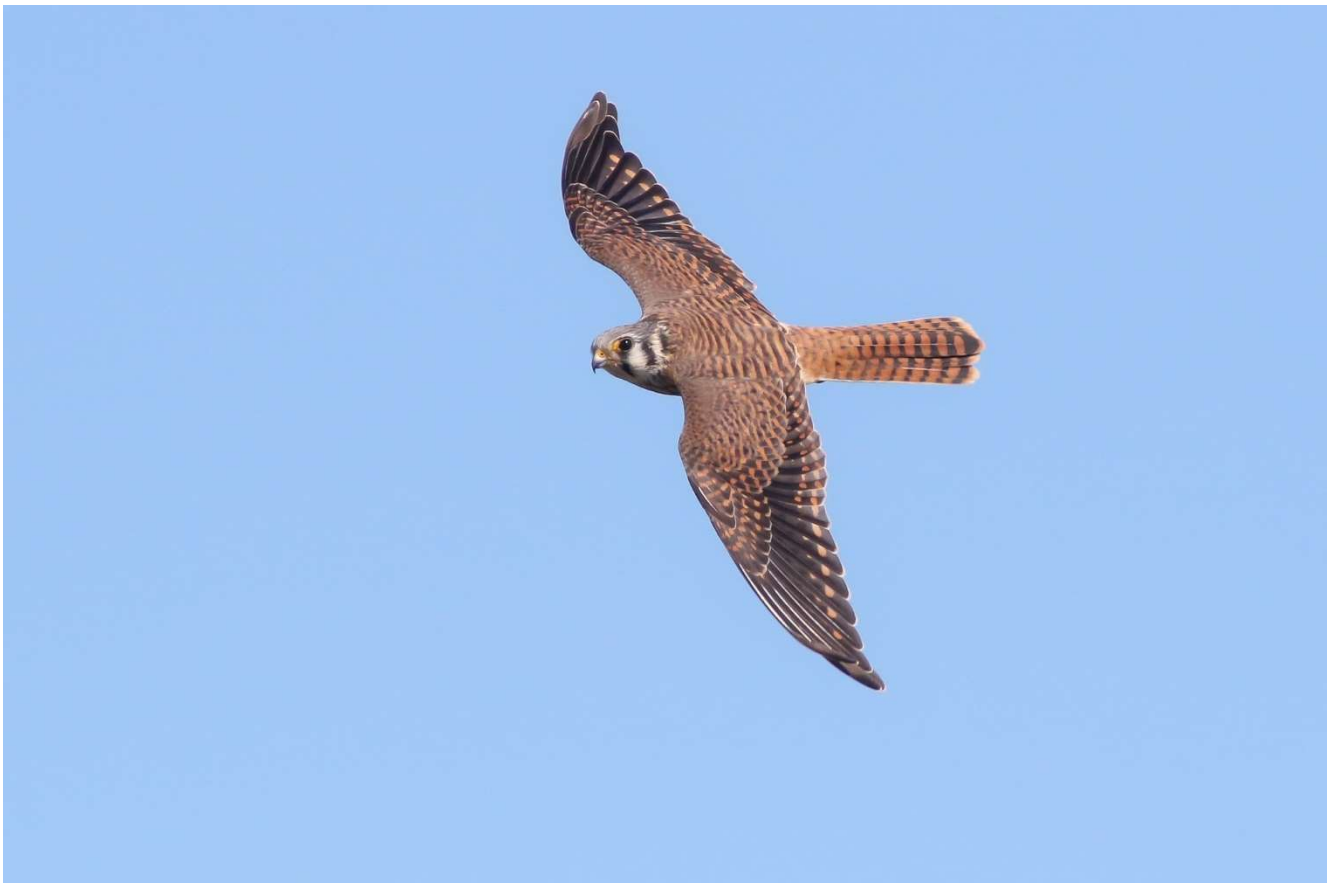
American Kestrel

Along the Atlantic Coast, fall is perhaps the most enchanting of seasons. Summer has lifted, the harvest is in, and the air carries a promise of winter to come. But there is a last warm chance to savor the abundance of nature. Thousands of birds, their brief annual residence in the north completed, make their way down the eastern seaboard, pausing only to feed and rest. The feeling is very different from that of the spring migration, with its joyful song and sprightly breeding dress. However, this autumnal journey has a majesty and splendor that is truly unique.