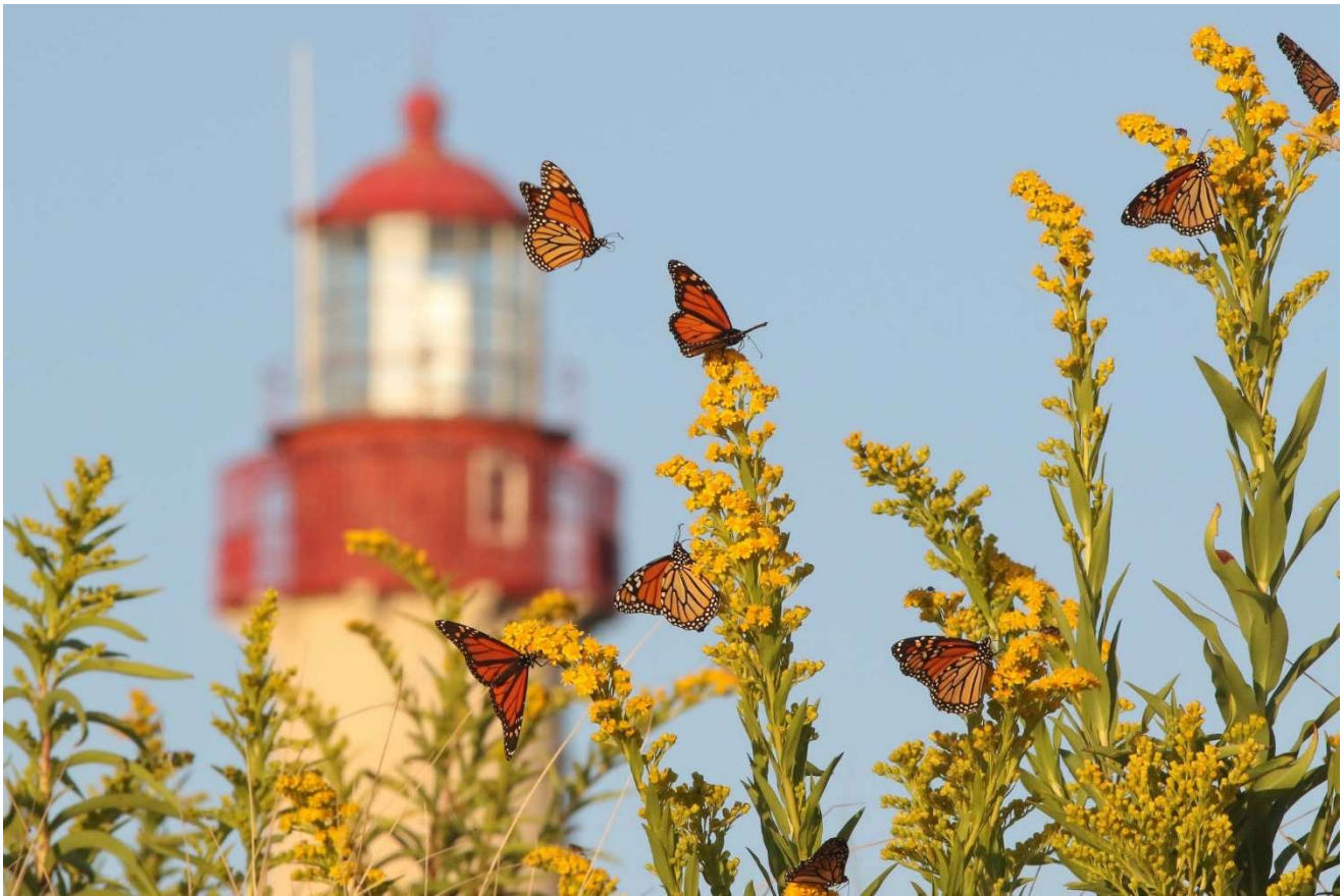
Monarchs on Seaside Goldenrod