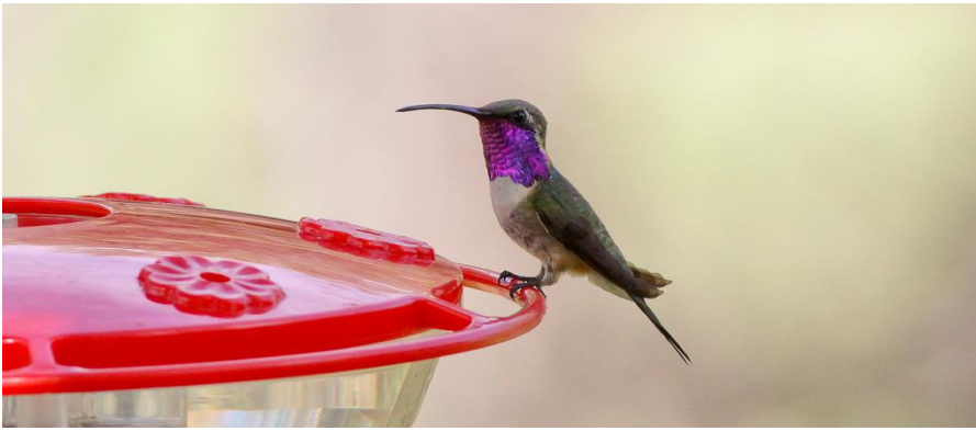
Lucifer Hummingbird

The summer months are a fabulous time for hummingbirds in southern Arizona and no place is more reliably productive than the Huachucas. Vigils at feeding stations may yield up to a dozen species. Beside the quality, we can expect quantity. Dozens of hummers are typically zipping around the feeders at all times, feeding, chasing and fighting. Black-chinned and Anna's are most common, but Magnificent, Blue-throated, and Broad-tailed