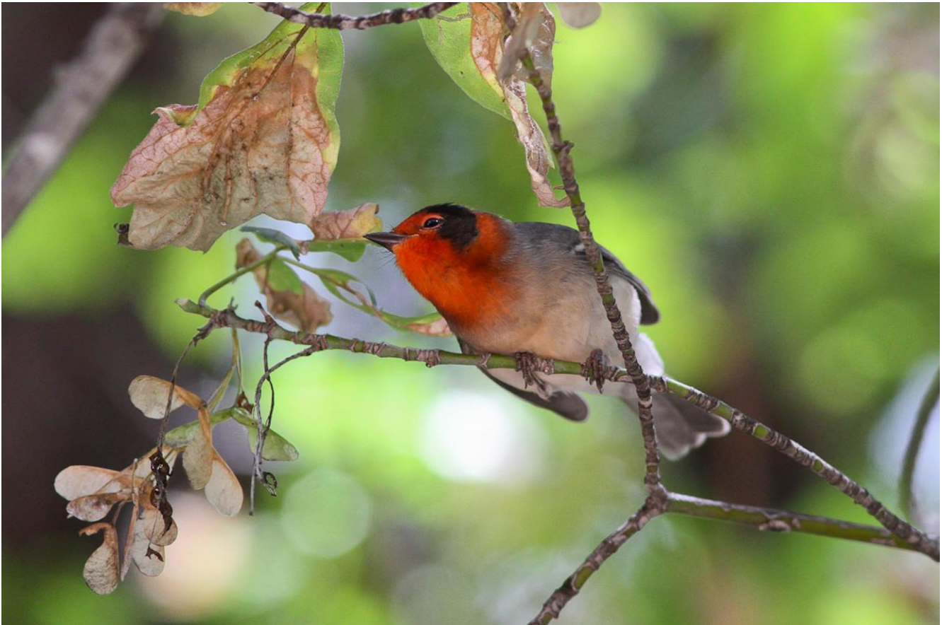
Red-faced Warbler

Camp Chiricahua, co-sponsored by Black Swamp Bird Observatory (Ohio) offers young naturalists between the ages of 14 and 18 the opportunity to explore the biologically rich ecosystems of Southeast Arizona, centering on the famed Chiricahua Mountains.