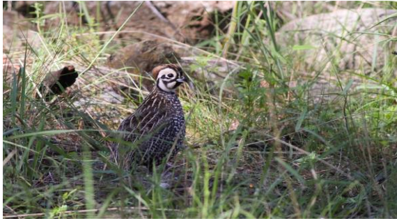
Montezuma Quail

Juniper Titmouse, Crissal Thrasher, Rufous-crowned and (rarely) Black-chinned sparrows, and Scott's Oriole. Near the old mining town of Paradise, we may be lucky enough to come across the furtive Montezuma Quail.