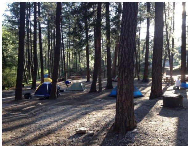
Rose Canyon Lake Campground © Michael O'Brien

After an early breakfast, we'll visit the Arizona-Sonora Desert Museum. This exquisite museum, with its interactive and live exhibits, provides an excellent introduction to the flora and fauna of the Southwest. Famous both locally and internationally, this "living museum" is an essential first stop for anybody new to the Desert Southwest. Set amid towering saguaro (pronounced sah-war-o) cactus, thickly foliated mesquite and palo verde, barrel cactus and ocotillo, the displays and exhibits are literally part of the native landscape. We will spend most of the morning meandering through the museum's numerous paths and walkways. Our exploration will offer an excellent introduction to the amazing Sonoran Desert and its attendant life forms. Spacious enclosures feature many of the birds and animals native to the region. The hummingbird house is a must see, and the walk-in aviary offers a delightful way to encounter many of the special birds of the mountains and deserts. Wild birds are plentiful and are sure to keep excitement levels high. Gilded Flicker, Gila Woodpecker, Ash-throated Flycatcher, Verdin, and Hooded Oriole are among the many possibilities.