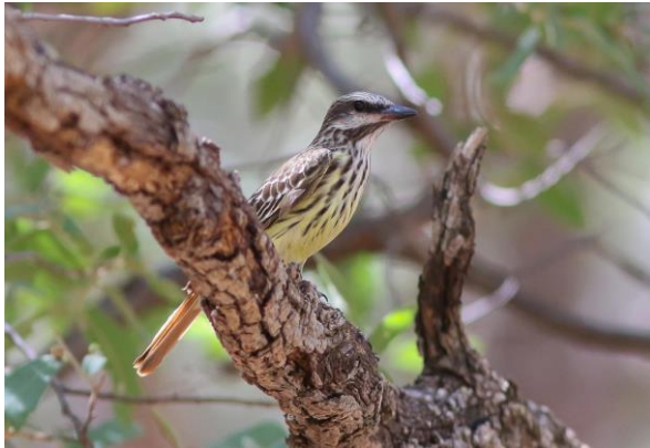
Sulphur-bellied Flycatcher

Cave Creek Canyon – One of the most exciting days will be our first visit to the South Fork of Cave Creek. This is a beautiful riparian habitat in the lower elevations of the Chiricahuas, where oaks, sycamores, pines, and cypress provide shade for the lush green undergrowth. The birds here are wonderful; Elegant Trogon must lead the list, but Blue-throated Mountain-Gem, Arizona Woodpecker, Sulphur-bellied and Dusky-capped flycatchers, Hutton's and Plumbeous vireos, Grace's Warbler, Painted Redstart, and Hepatic Tanager are nearly as special. We'll spend