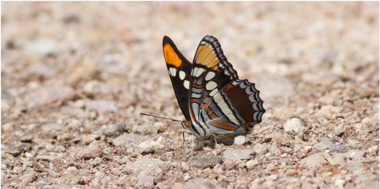
Arizona Sister © Michael O'Brien

Mammal viewing is often wonderful; past camps have been fortunate enough to encounter black bear, mountain lion, bobcat, mule deer, javelin (collared peccary), black-tailed jackrabbit, ringtail, and several species of skunk and kangaroo rat. Many campers have an interest in butterflies, and we will take time to identify any that cross our path. Due to its warm and semi-tropical climate, Arizona is superb for butterflies, and hosts a beautiful array of species. We are likely to encounter large, showy types such as giant, two-tailed, pipevine, and black swallowtails; red-spotted admiral; mourning cloak; cloudless sulphur; southern dogface; Arizona sister; and an impressive diversity of blues and skippers.