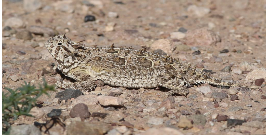
Texas Horned Lizard

Our afternoon will likely be spent in the deservedly famous Madera Canyon. Hummingbird feeders here often host a rarity or two – White-eared and Berylline are regular, and trails through mountain canyons are home to the likes of Elegant Trogon, Arizona Woodpecker, Sulphur-bellied Flycatcher, Mexican Jay, and Hepatic Tanager. In the late afternoon we'll return to our hotel in Tucson. After a well-deserved dip in the pool, we will meet for a final group dinner.