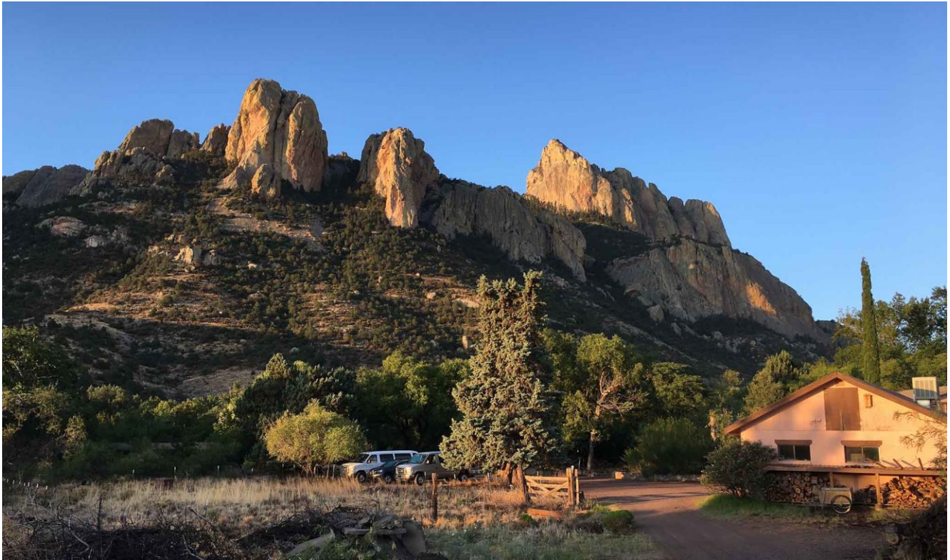
Cave Creek Ranch

Starting in Tucson, we will first do some desert birding on the east side of town before ascending Mount Lemmon in the Catalina Mountains. Two nights of camping in the forested highlands will acquaint us with the “sky islands” so very characteristic of the borderlands of Southeast Arizona.