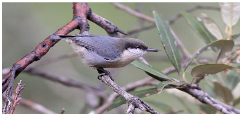
Pygmy Nuthatch

NIGHT: Camping at Rose Canyon Lake, Catalina National Forest