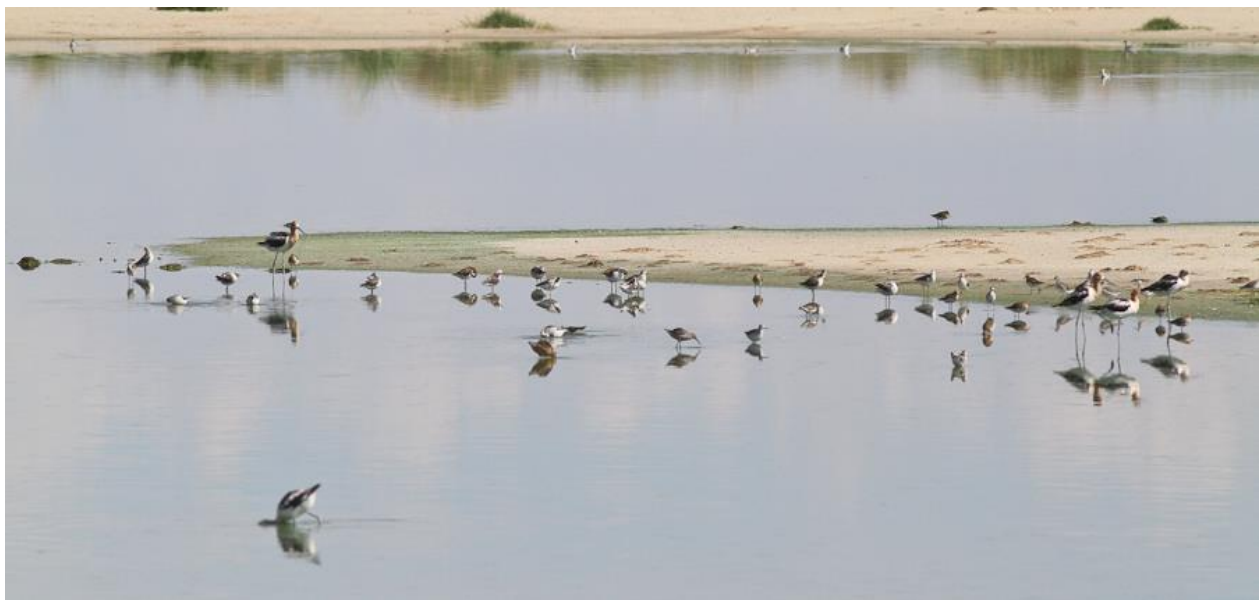
Shorebirds at Lake Cochise

To break up the drive, we'll make a midday stop at Lake Cochise on the west side of Wilcox. Really a large municipal wastewater treatment pond, the "lake" is the single most famous birding location in the entire Sulphur Springs Valley. The interface of man-made and natural habitats found here provides food and shelter for an impressive diversity of birdlife all year long, and the presence of permanent water represents an important refuge in a region nearly devoid of large bodies of water. An astonishing array of birds has been recorded here through the years, and we hope to encounter a variety of waders and grassland species, as well as any surprises that may turn up. Wayward gulls and terns are frequently found here, and the open water often holds a variety of summering ducks and grebes. The first southbound shorebirds will provide some identification challenges, and such dandies as Wilson's Phalarope and Baird's Sandpiper are likely. American Avocets nest here in some years, and Yellow-headed Blackbirds breed in the reed-lined ponds. Swainson's Hawks, Scaled Quail, Horned Lark, and "Lilian's" Eastern Meadowlark are typical sights of the grasslands. In the distance the Chiricahua and Dos Cabezas mountain ranges form a backdrop of considerable panoramic beauty.