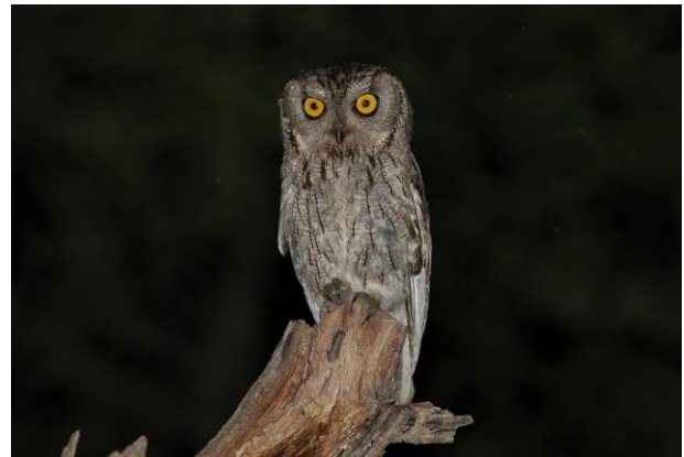
Western Screech-owl

Evening Night Drives and Owling Expeditions – Nighttime in the Chiricahuas reveals another face to this wondrous place. A whole host of birds, insects, reptiles and mammals emerge after the sun goes down and the heavens fill with millions of stars. We'll go on a nightbird prowl one night after dinner. The voices of Elf Owl, Western and Whiskered screech-owls, Common Poorwill, and Mexican Whip-poor-will elevate the ambience of a Chiricahua summer evening, and we have decent chances of seeing some of these nocturnal sprites. On another evening we will load up and head out to the desert for a night drive. Cruising lightly traveled side roads brings opportunities for a variety of other critters, including snakes, toads, kangaroo rats, scorpions, and tarantulas.