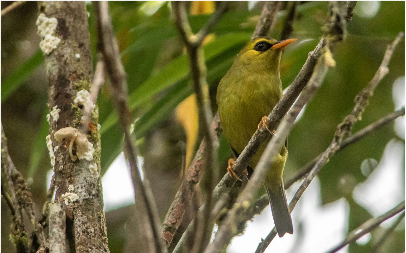
Cute Mountain Black-eyes are usually a common sight during our visits to the Crocker Range.

July 11, Day 5: Crocker Range National Park and Drive to Kinabalu Park. This morning we will depart for the scenic drive into the Crocker Range National Park. Although access to this large reserve is notably sparse, we should be able to locate a handful of endemics and other specialties that are difficult to find within, or absent from, Kinabalu Park. With a bit of luck, we may encounter the diminutive Pygmy White-eye, in addition to Mountain Barbet and the rather uncommon but attractive Bornean Barbet, Bornean Bulbul and the peculiar-sounding Whitehead's Spiderhunter. Other possibilities might include Mountain Serpent-Eagle (with luck), Mountain Imperial-Pigeon, Ruddy (uncommon) and Little cuckoo-doves, Gold-faced Barbet (a split from Gold-whiskered), Bornean Leafbird, Orange-headed Thrush (uncommon), the glorious Temminck's Sunbird and the mysterious Mountain Black-eye to finish the day. In addition, if we are very fortunate, we may also see a Rafflesia in flower. However, this is a rare event and often requires a long and rather steep walk.