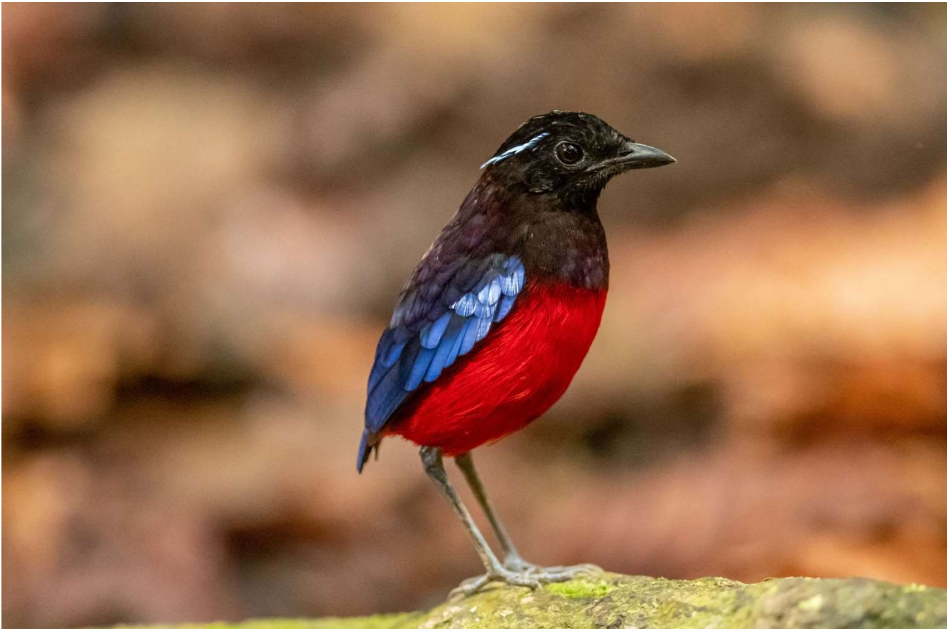
Spectacular Black-crowned Pittas are always a delight.

NIGHT: Sepilok Nature Resort, Sandakan, Sabah