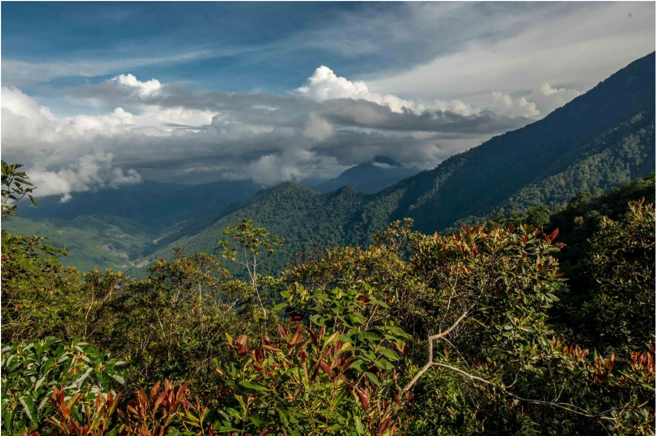
Breath-taking views are the norm around Mt. Kinabalu.

The magnificent Kinabalu National Park encompasses an area of 300 square miles and ranges in altitude from 1,000 to 13,455 feet, although the greater portion of the area lies above 4,000 feet. Approximately 300 species of birds have been recorded from the park, including a number of extremely local endemics. We will bird along forest-lined roads and forest trails in search of these specialties. Be aware that birding here can be extremely slow but rewarding. Although the purpose of most people visiting the park is to climb to the summit, we can see most of the specialties well below the high elevations. Characteristically in the mountains, it can suddenly become very chilly and wet; participants are advised to bring along warm clothes and wet weather gear.