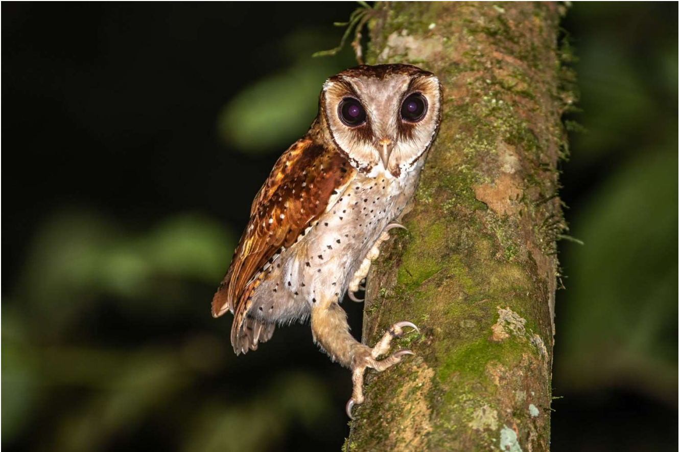
The prince of the night in Borneo is this amazing Oriental Bay Owl.

We will also make a special effort to find some of Borneo's most elusive specialties, such as Wallace's Hawk-Eagle; Chestnut-necklaced Partridge; the spectacular endemic Bornean Ground-Cuckoo; Oriental Bay-Owl; Large Frogmouth; Giant Pitta (extremely elusive); Blue-banded Pitta (a tough bird to find, but without a doubt one of the real jewels of the Orient); Bornean Wren-Babbler; and the incomparable Bornean Bristlehead.