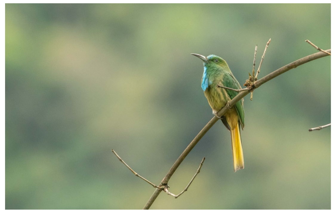
We came across a few beautiful Blue-bearded Bee-eaters.