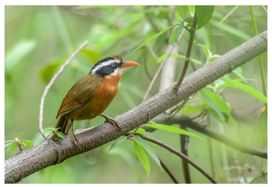
These Coral-billed Scimitar-Babblers are just amazing.

Our next adventure was birding the exciting area of Sengor and Limithang Road, probably the best birding highway of the world. In Sengor, the main spectacle was a gorgeous Satyr Tragopan that performed perfectly in front of us, giving us extended close views in the telescope. We had the bird all to ourselves for almost half an hour. Here as well were many little groups of Blood Pheasants foraging alongside the road. Perched in the top of a broad-leaved tree, a Golden-throated Barbet was showing off his tropical song. The road is very good for many creatures of the dark like Slaty-bellied Tesia, Rufous-throated Wren-Babbler, Slender-billed Scimitar-Babbler, and Streak-breasted Scimitar-Babbler. In the tree tops, the White-browed Shrike-Babbler, Green Shrike-Babbler, Black-eared Shrike-Babbler, and a fleeting Common Green Magpie were highlights.