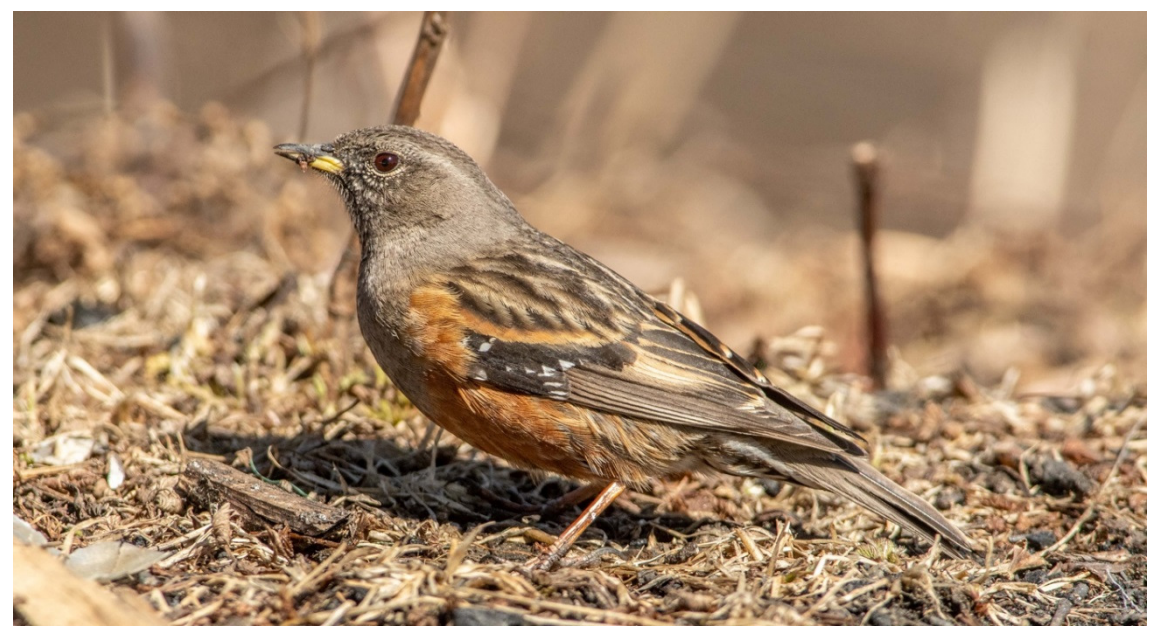
Alpine Accentors allowed close-up views in Chele La.

After Paro, we started our journey east with a drive to Thimphu and Punakha, visiting Dochu La and Tashitang along the way. The birding in these places is nothing but spectacular with great sightings constantly. These lush green valleys are very photogenic, and many stops were made to take in all the landscapes. The birding was good here with excellent sightings of a crossing Hill Partridge, some exquisite Ultramarine Flycatchers, a close overhead Rufous-bellied Eagle, a surprise sighting of a dayroosting Tawny Fish-Owl, and some wonderful scope views of a party of Gray Treepies. The leafwarblers also produced in these spots with Greenish, Large-billed, Blyth's, Yellow-vented, Gray-hooded, and Chestnut-crowned Warbler all present, some more numerous than others. The endangered Yellow-rumped Honeyguide was another highlight showing very well—triumph!