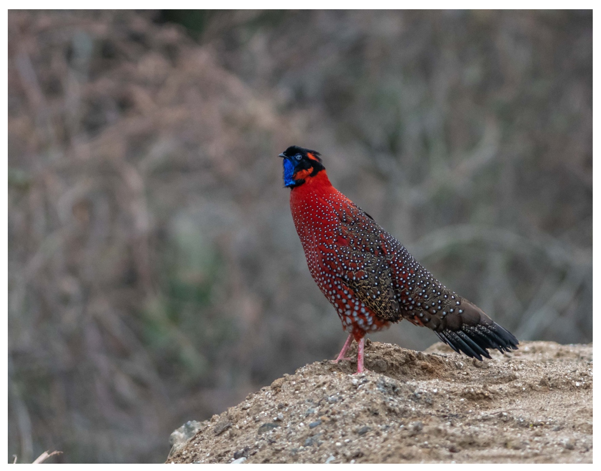
The Satyr Tragopan is one of the best pheasants on our planet!