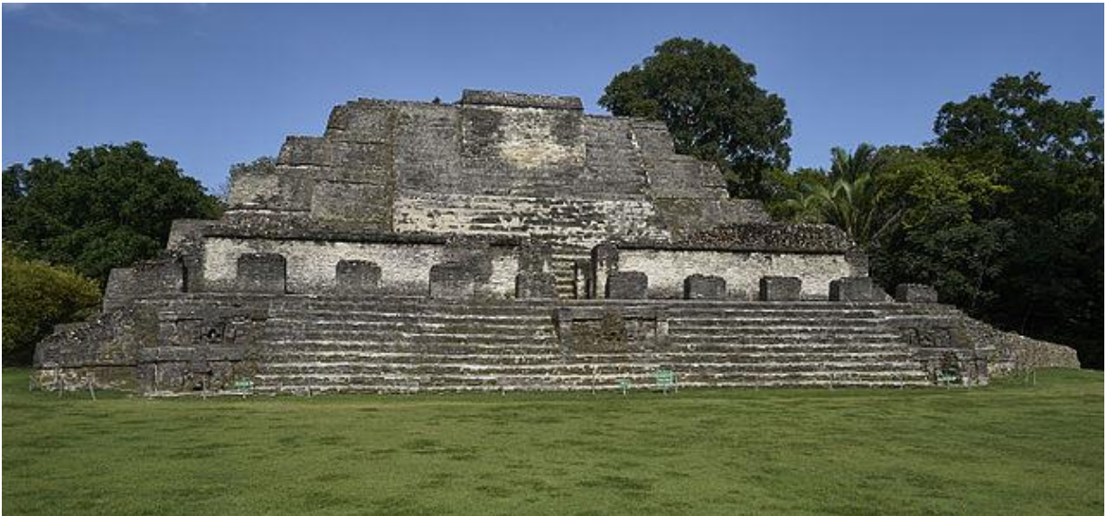
Temple of the Sun God, Altun Ha

Our relaxing lunch at a nearby restaurant will feature authentic Belizean cuisine in a birdy environment. In the afternoon we'll return to Crooked Tree and take an afternoon walk near the lodge.