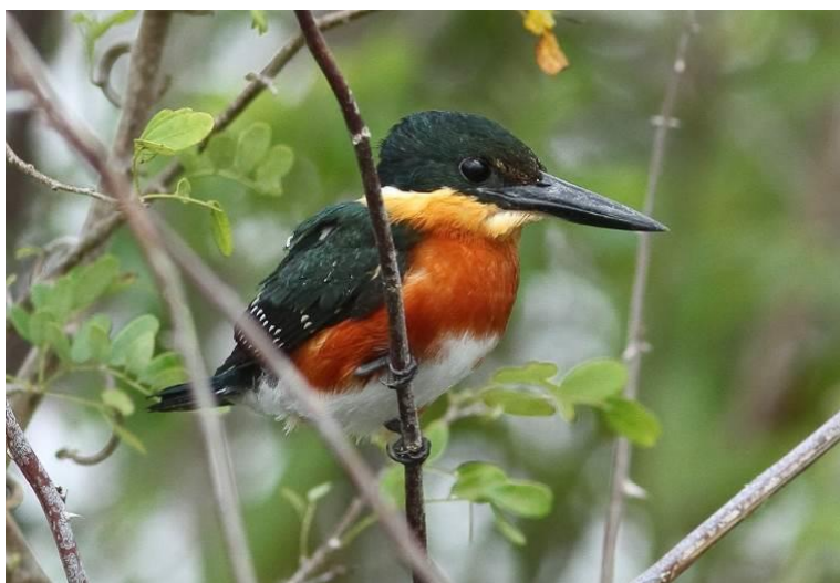
American Pygmy Kingfisher

At Bird's Eye View Lodge in rural Crooked Tree Village, we will explore the lagoons, pine forest, and savanna that dominate much of the landscape of northeastern Belize. At Crooked Tree Wildlife Sanctuary, a boat ride through the main lagoon may produce such exciting birds as Boat-billed and Agami herons, Jabiru, Black-collared Hawk, Russet-naped Wood-Rail, and American Pygmy Kingfisher. Nearby pine forest and cashew orchards host a long list of birds, including the stunning Yucatan Jay, along with Yellow-lored Parrot, Canivet's Emerald, Yucatan Woodpecker, and Yucatan Flycatcher. We will also tour the impressive Maya ruins of Altun Ha, dating from the Middle- and Late-classic period (500–900 A.D.)