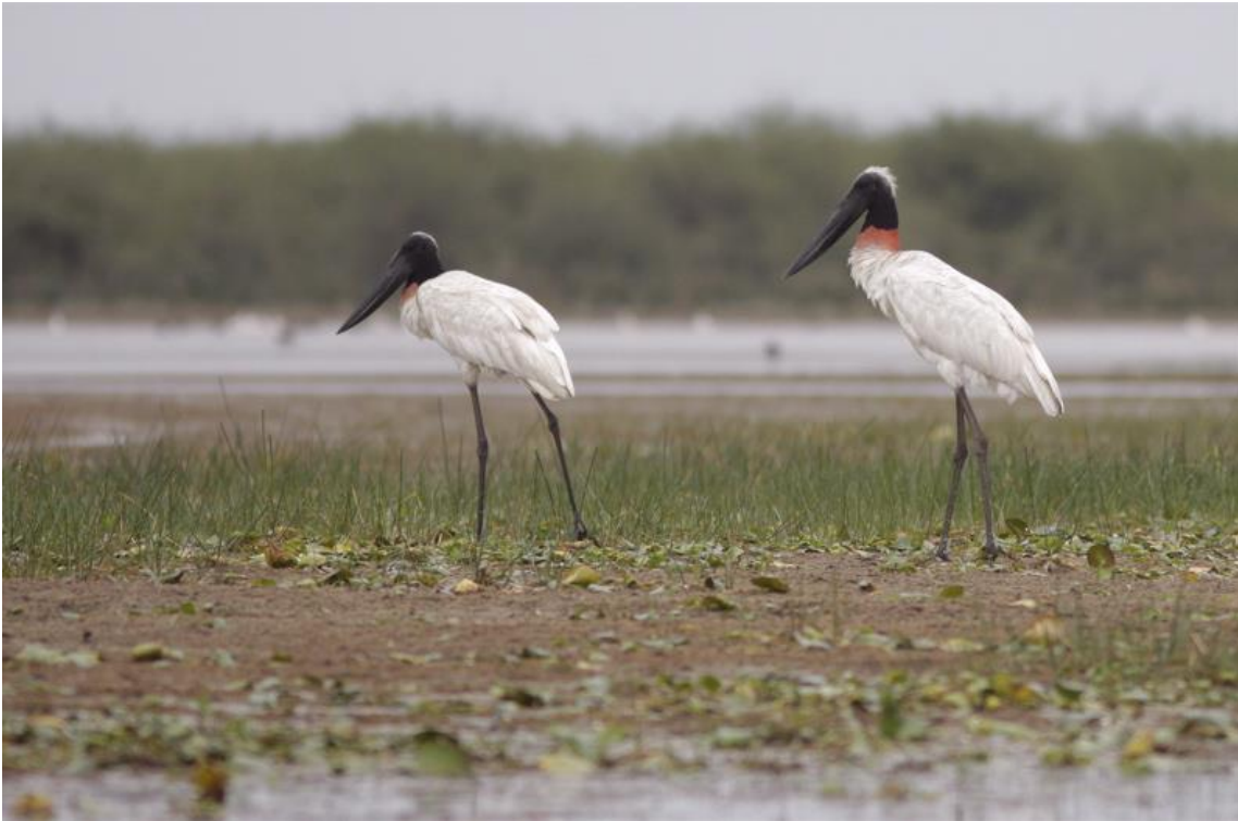
Jabirus at Crooked Tree Lagoon

harvest. Our visit is timed for peak productivity. Depending on water levels, we should be treated to a series of amazing spectacles.