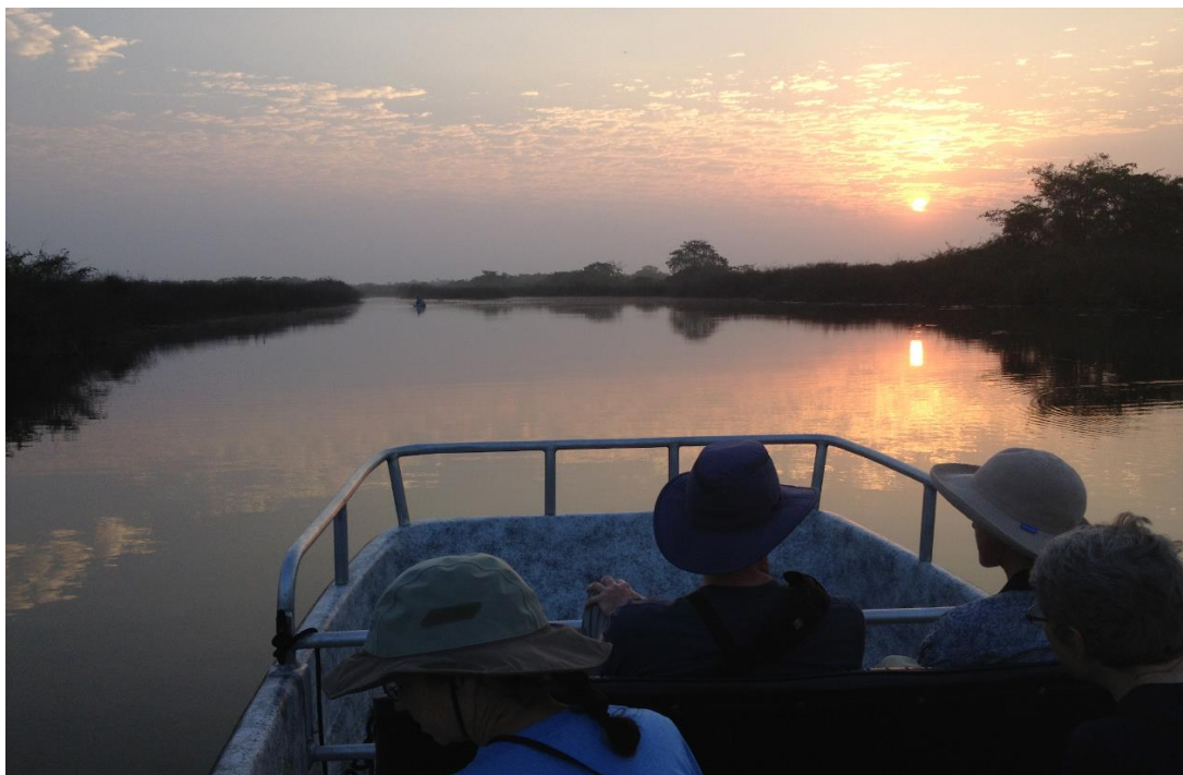
Cruising the New River