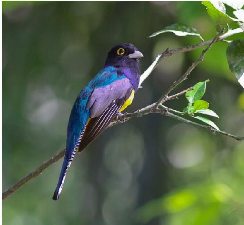
Gartered Trogon