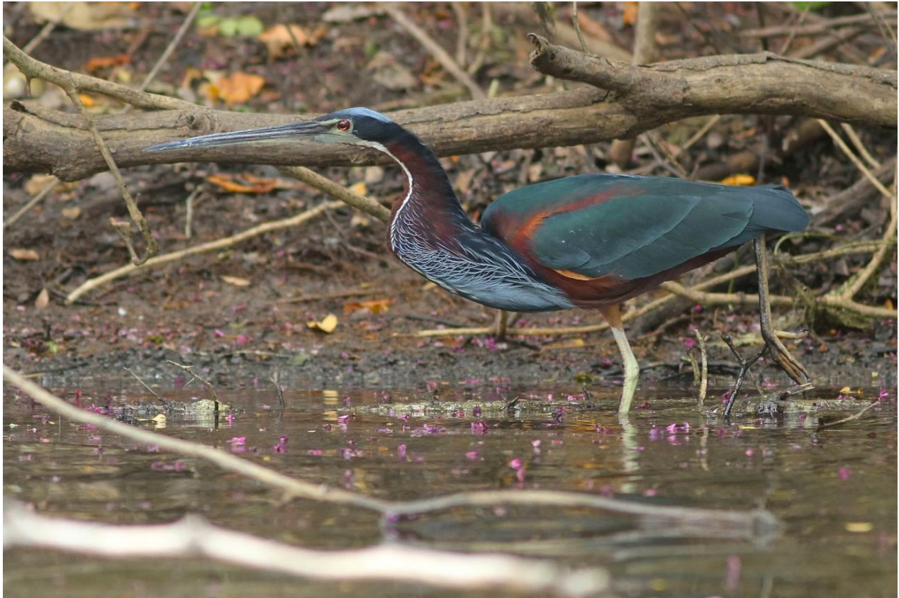
Agami Heron