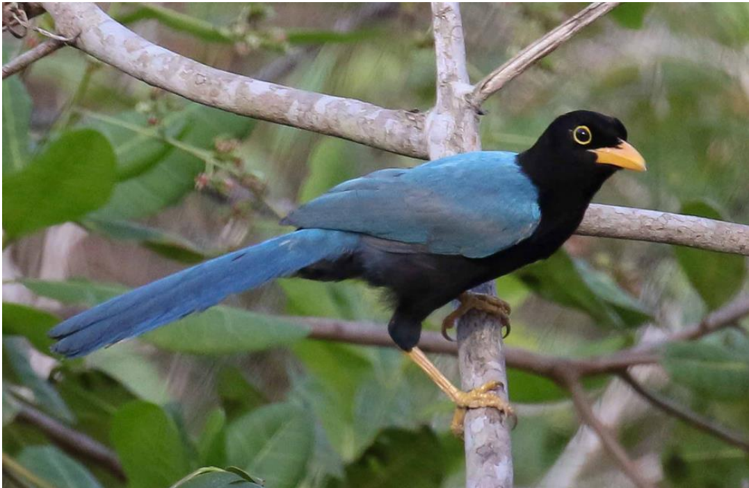
Yucatan Jay

After lunch and a break, we will explore nearby cashew orchards and pine-savanna in search of several Yucatan specialties such as Yellow-lored Parrot, Yucatan Woodpecker, Yucatan Flycatcher, and dapper Yucatan Jays. In this birdy area, we should expect constant entertainment by various parrots, flycatchers, warblers, tanagers, and other species. Common birds here include Pale-vented Pigeon, White-fronted Parrot, Great Kiskadee, Vermilion Flycatcher, Brown Jay, Gray-breasted Martin, Mangrove Swallow, Clay-colored Thrush, Tropical Mockingbird, Cinnamon-bellied Saltator, Melodious Blackbird, and Hooded Oriole.