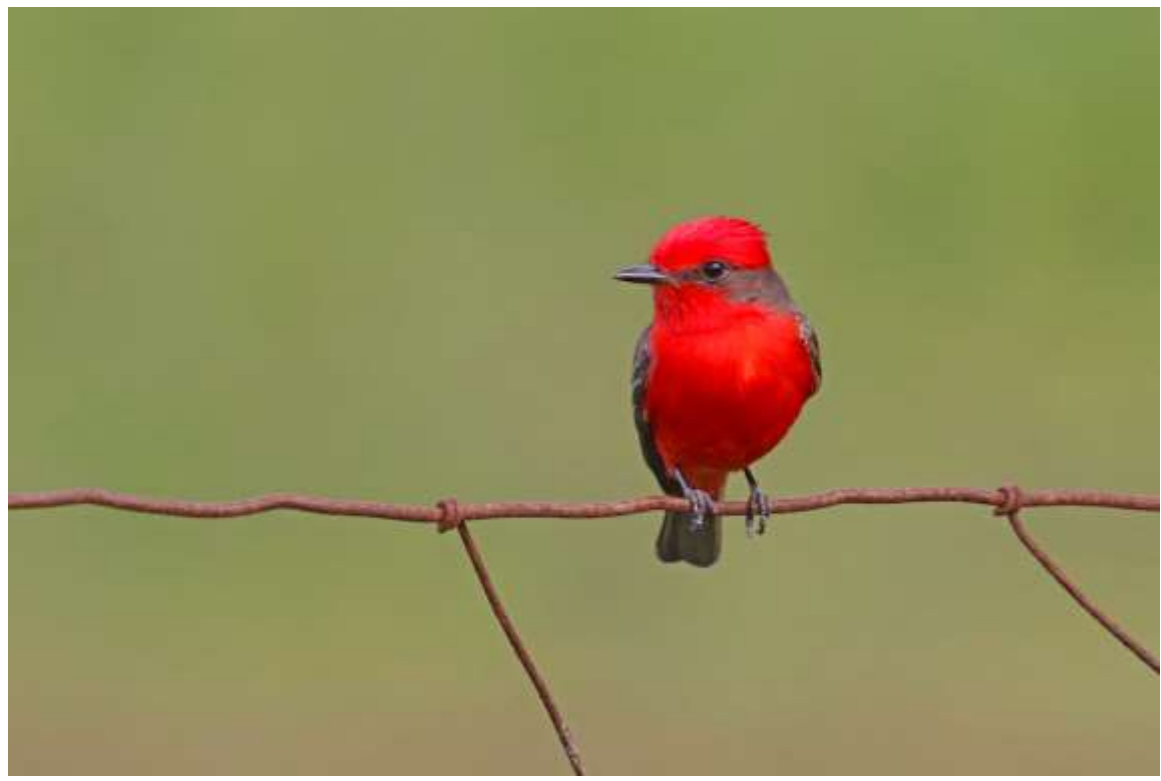
Vermilion Flycatcher

Least Flycatcher ( Empidonax minimus ) – A few seen at both CT and Lamanai. Vermilion Flycatcher ( Pyrocephalus rubinus ) – Numerous at CT; a few elsewhere.