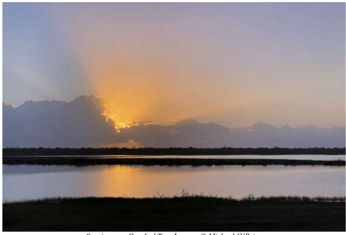
Sunrise over Crooked Tree Lagoon

Our short walks around the lodge and nearby trails were always outstandingly birdy, with such highlights as Striped and Squirrel cuckoos, Russet-naped Wood-Rail, Bat Falcon, three species of parrots, Olive-throated Parakeet, Barred Antshrike, Common Tody-Flycatcher, Yellow-billed Cacique, and Gray-throated Chat, all within a few steps of the lodge. And when we ventured to the pine savannah and West Causeway marshes, we were treated to the likes of Pinnated Bittern, Ferruginous Pygmy-Owl, Acorn and Yucatan woodpeckers, Yucatan Jay, and Scrub Euphonia. But perhaps the greatest delight at Crooked Tree was just hanging out around Bird's Eye View Lodge. Such "yard birds" as Ruddy Ground-Dove, Vermilion Flycatcher, Tropical Mockingbird, Graybreasted Martin, Mangrove Swallow, Yellow-throated and Hooded warblers, Morelet's Seedeater, and four oriole species were ever-present. And scanning the lagoon, a constant flow of waterbirds, raptors, and other species made every moment interesting. To top things off, an evening walk on the lodge grounds provided close views of Common Pauraque, whose calls were constant through the night.