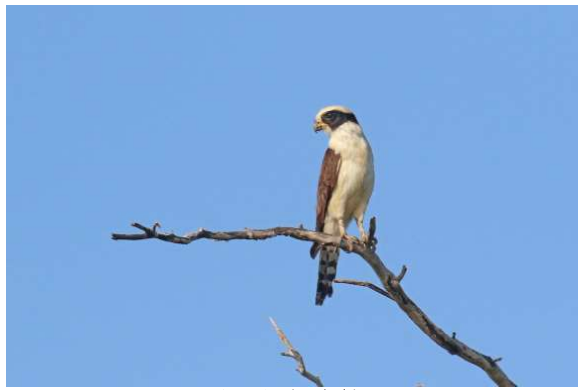
Laughing Falcon

Laughing Falcon ( Herpetotheres cachinnans ) – Pair seen and heard multiple times around Lamanai Outpost Lodge, plus another along the New River.