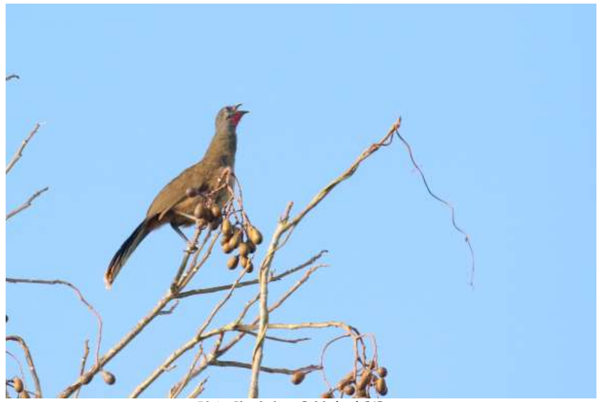
Plain Chachalaca

Plain Chachalaca ( Ortalis vetula ) – A few seen every day.