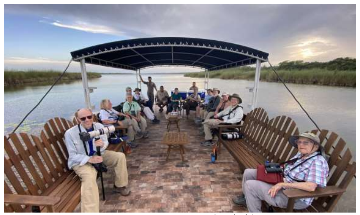
Cocktail Cruise on New River Lagoon

Altamira Oriole, Blue and Painted buntings, Black-headed and Cinnamon-bellied saltators, and numerous migrant warblers, flycatchers, and others. For a little open country birding, we took a drive into Mennonite farm country and found Plain-breasted Ground-Dove, Plumbeous Kite, Gray Hawk, Crested Caracara, Fork-tailed Flycatcher, Eastern Meadowlark, and numerous swallows.