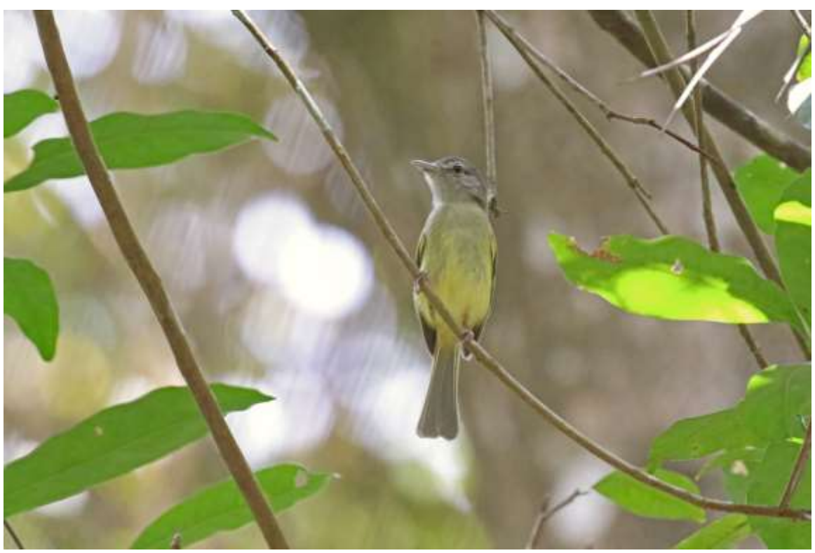
Yellow-olive Flycatcher

Yellow-olive Flycatcher ( Tolmomyias sulphurescens ) – Several at CT and Lamanai.