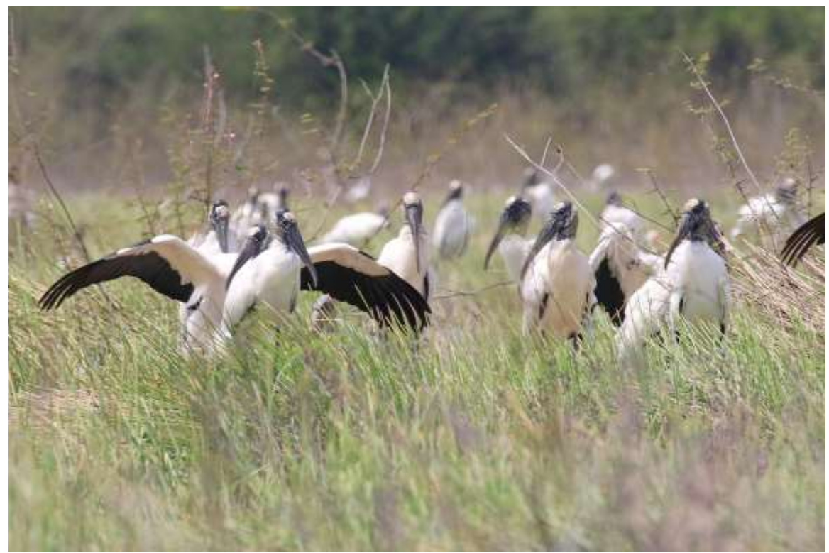
Wood Storks

Wood Stork (Mycteria americana) – Numerous at CT; a few elsewhere.