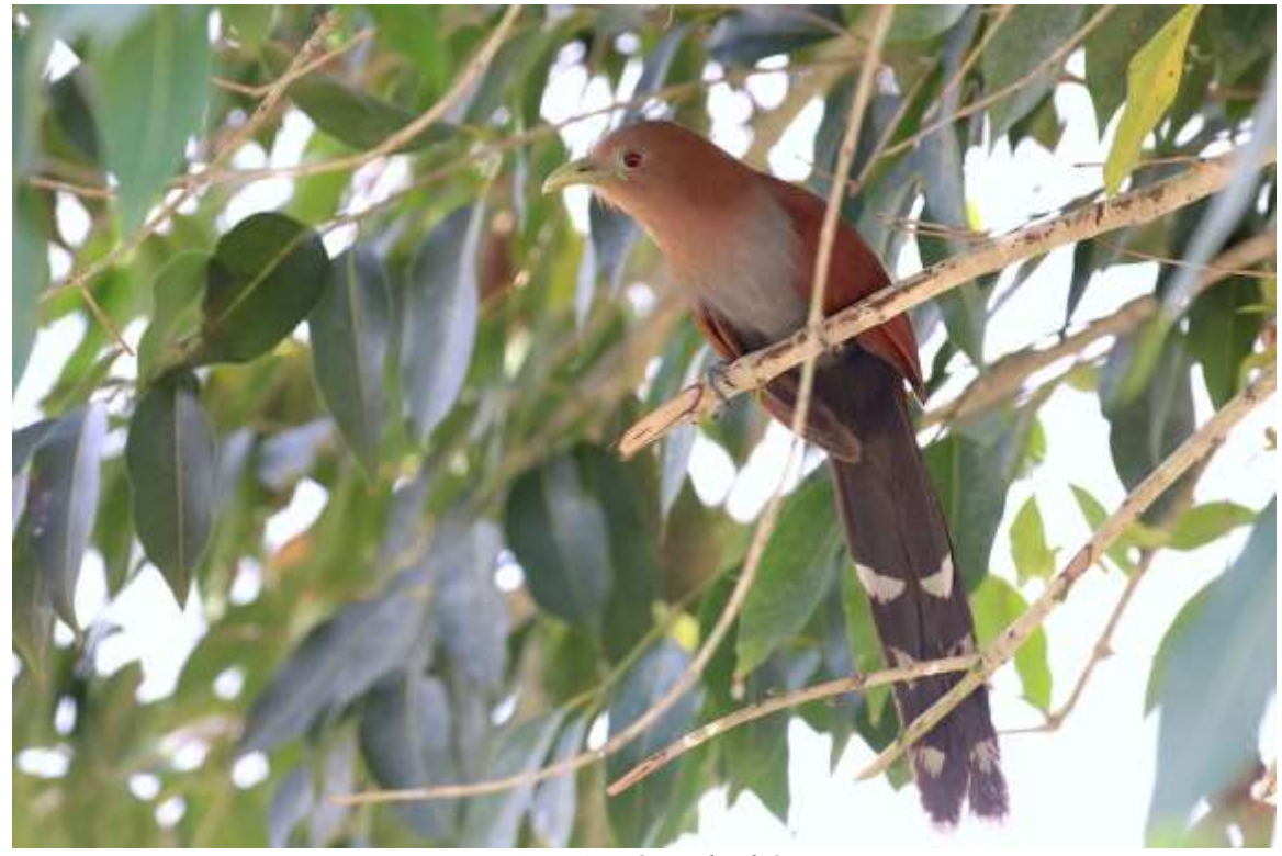
Squirrel Cuckoo

Squirrel Cuckoo ( Tapera naevia ) – Seen at both CT and Lamanai.