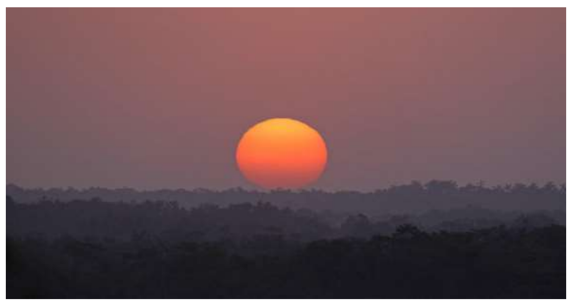
Sunrise at Lamanai