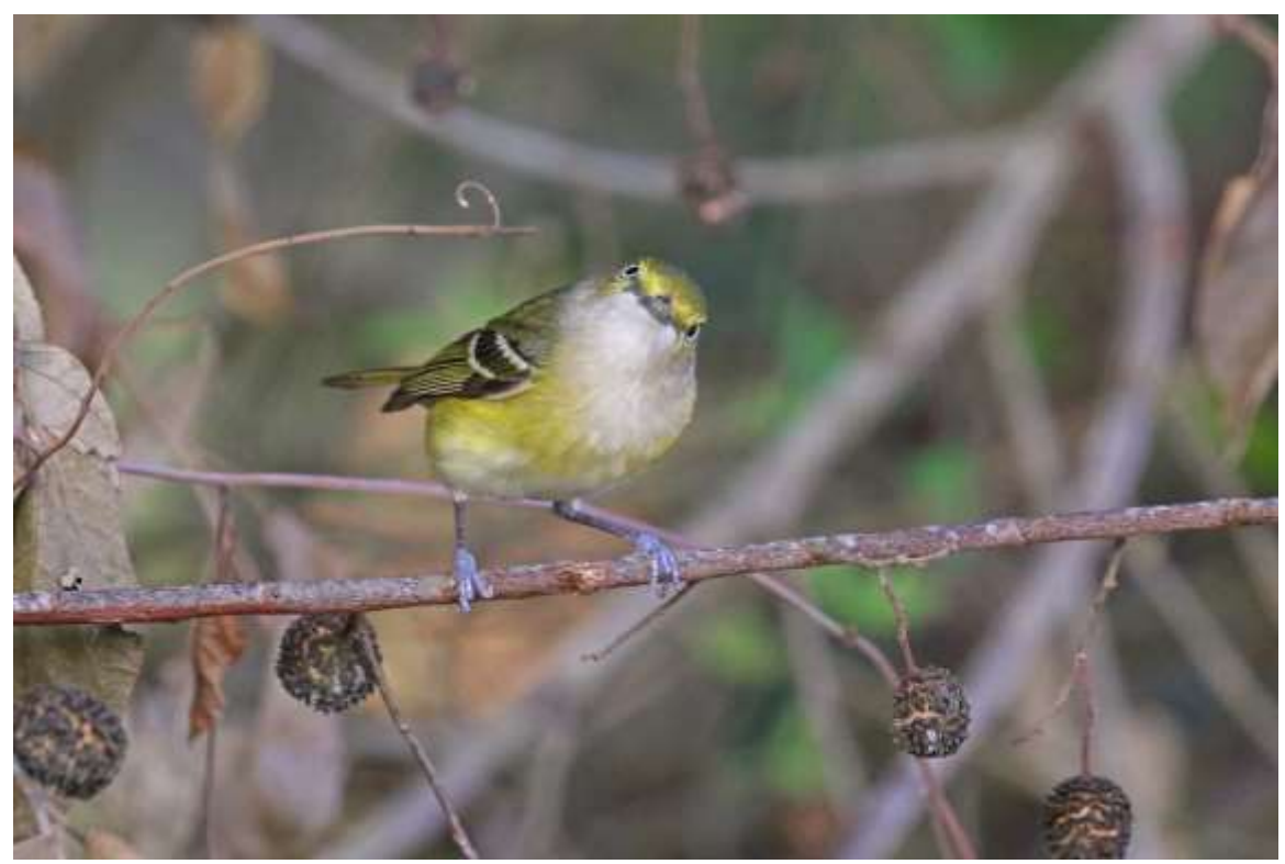
White-eyed Vireo

Rufous-browed Peppershrike ( Cyclarhis gujanensis ) – Seen at CT; heard at Lamanai. Lesser Greenlet ( Pachyslyvia decurtatus ) – Seen at Altun Ha and Lamanai. White-eyed Vireo ( Vireo griseus ) – Seen or heard at several locations.