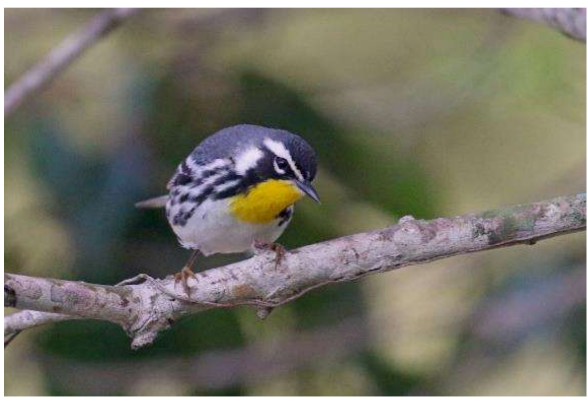
Yellow-throated Warbler

Yellow-throated Warbler ( Setophaga dominica ) – A few seen every day; one of our favorite yard birds at Bird's Eye View Lodge!