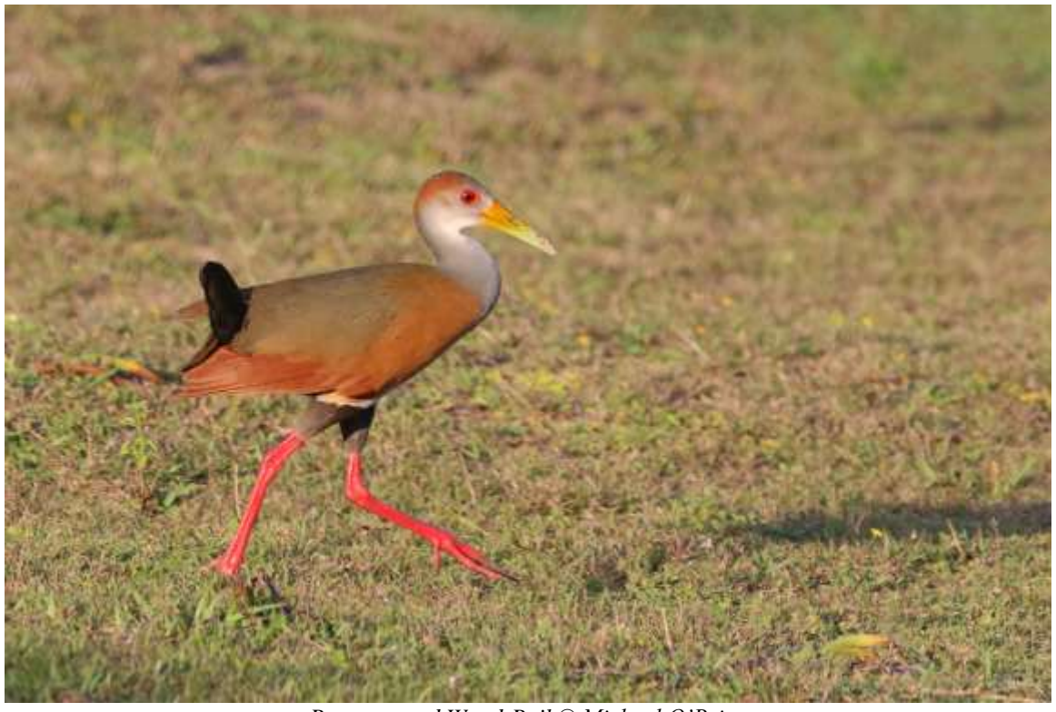
Russet-naped Wood-Rail

Russet-naped Wood-Rail (Aramides albiventris) – Seen several times at both CT and Lamanai.