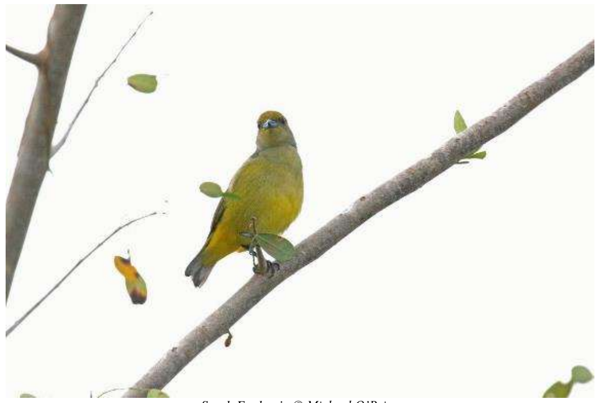
Scrub Euphonia

Scrub Euphonia ( Euphonia affinis ) – Normally a scarce bird on this tour, we were surprised to see them several times, at the West Lagoon and at Lamanai.