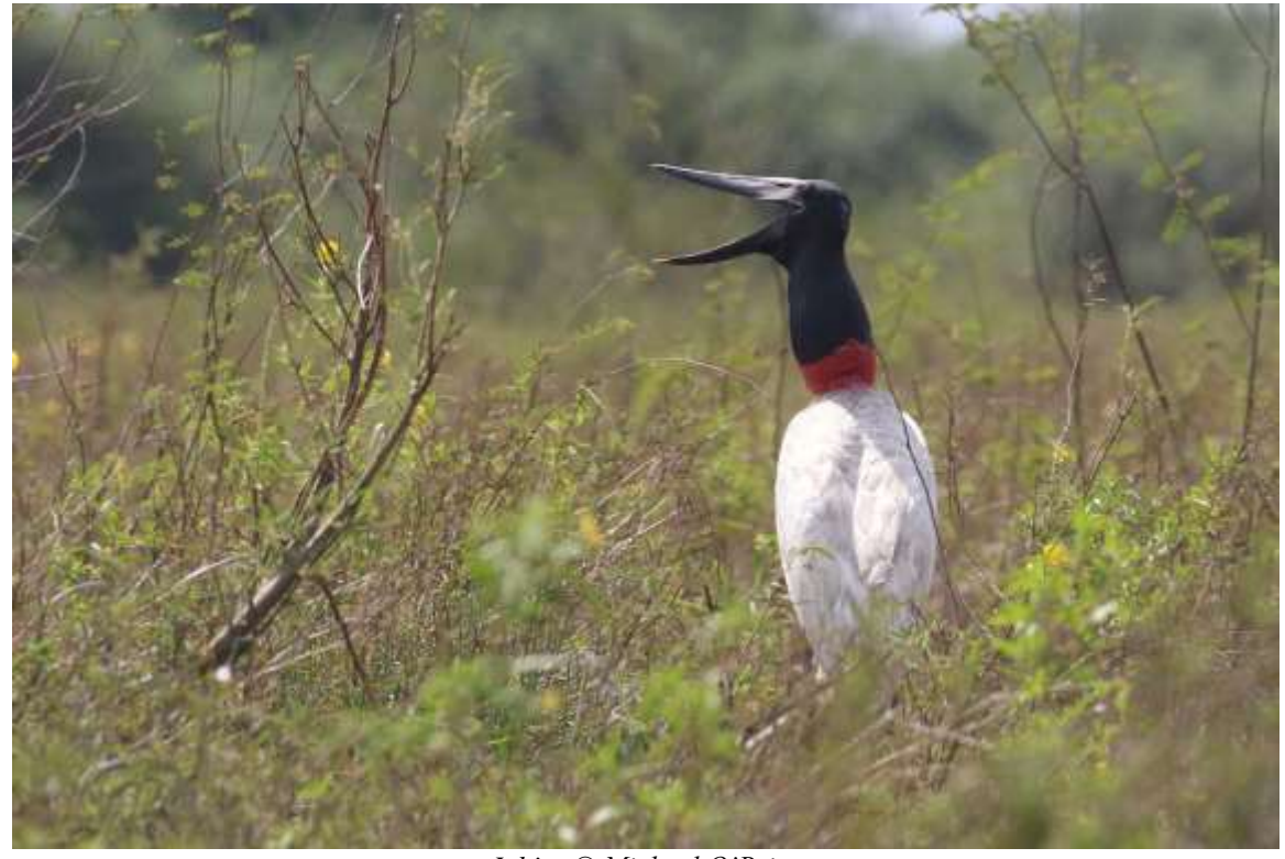
Jabiru

The birdlife at Crooked Tree Lagoon is constantly changing through the season, closely tied to changing water levels, so we never know what we will find one visit to the next. This year, water levels were quite low, serving to concentrate birds. Although navigation of the existing waterways was slower than usual, our boat trip here provided wonderful birds at every turn. The keystone species at Crooked Tree, Jabiru, was present in good numbers, and we had close views of these magnificent birds, which dwarfed nearby Wood Storks, egrets, and herons. We also had good luck finding all four expected kingfisher species, plus Boat-billed Herons, Bare-throated Tiger-Heron, Snail Kite, Black-collared Hawk, Great Black Hawk, large flocks of Caspian and Gull-billed terns, and a rare (very early) Black Tern. But top honors clearly go to the very secretive Agami Heron and Sungrebe, both of which gave us excellent views when we finally made it to Spanish Creek!