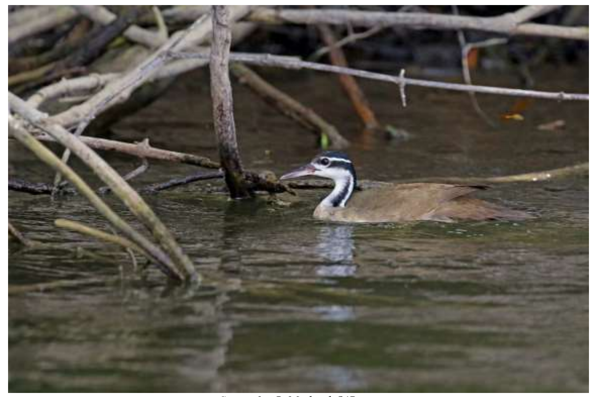
Sungrebe

Sungrebe ( Heliornis fulica ) – Excellent views at Spanish Creek.