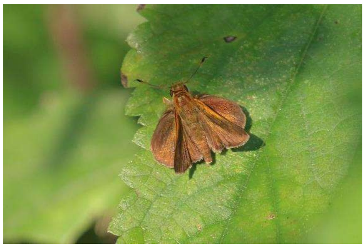
Redundant Skipper