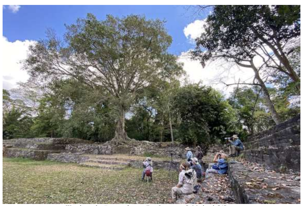
Watching the "magic fig tree" at Lamanai

The next phase of our tour began with a boat ride down the New River as we transferred to Lamanai. In contrast to the relatively open habitats around Crooked Tree, the forested edge of the New River gave us the instant feeling of traveling deep into a remote jungle, and that sublime feeling remained with us during our entire stay.