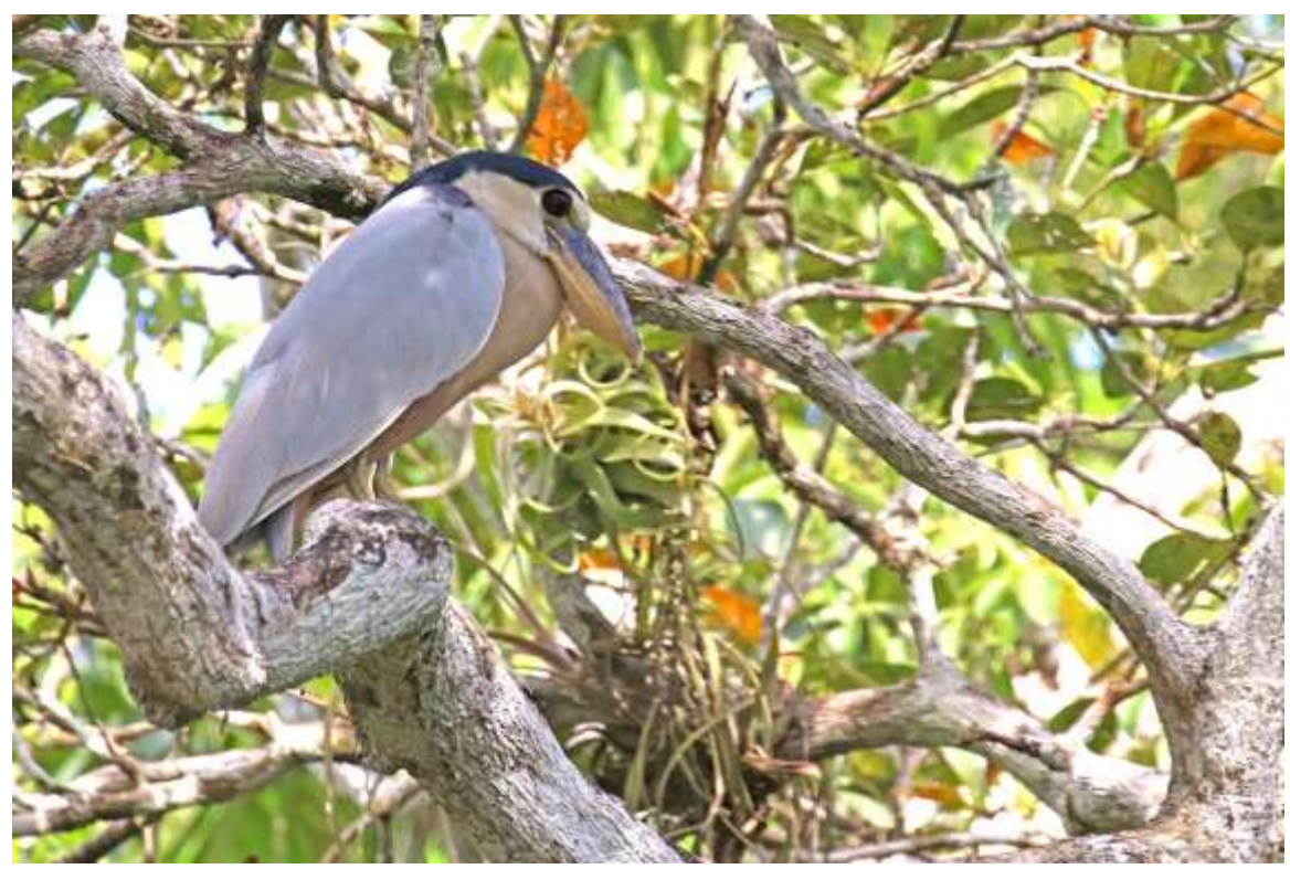
Boat-billed Heron

Boat-billed Heron ( Cochlearius cochlearius ) – Excellent views of roosting birds at Spanish Creek and New River, plus feeding birds at night at Bird's Eye View Lodge.