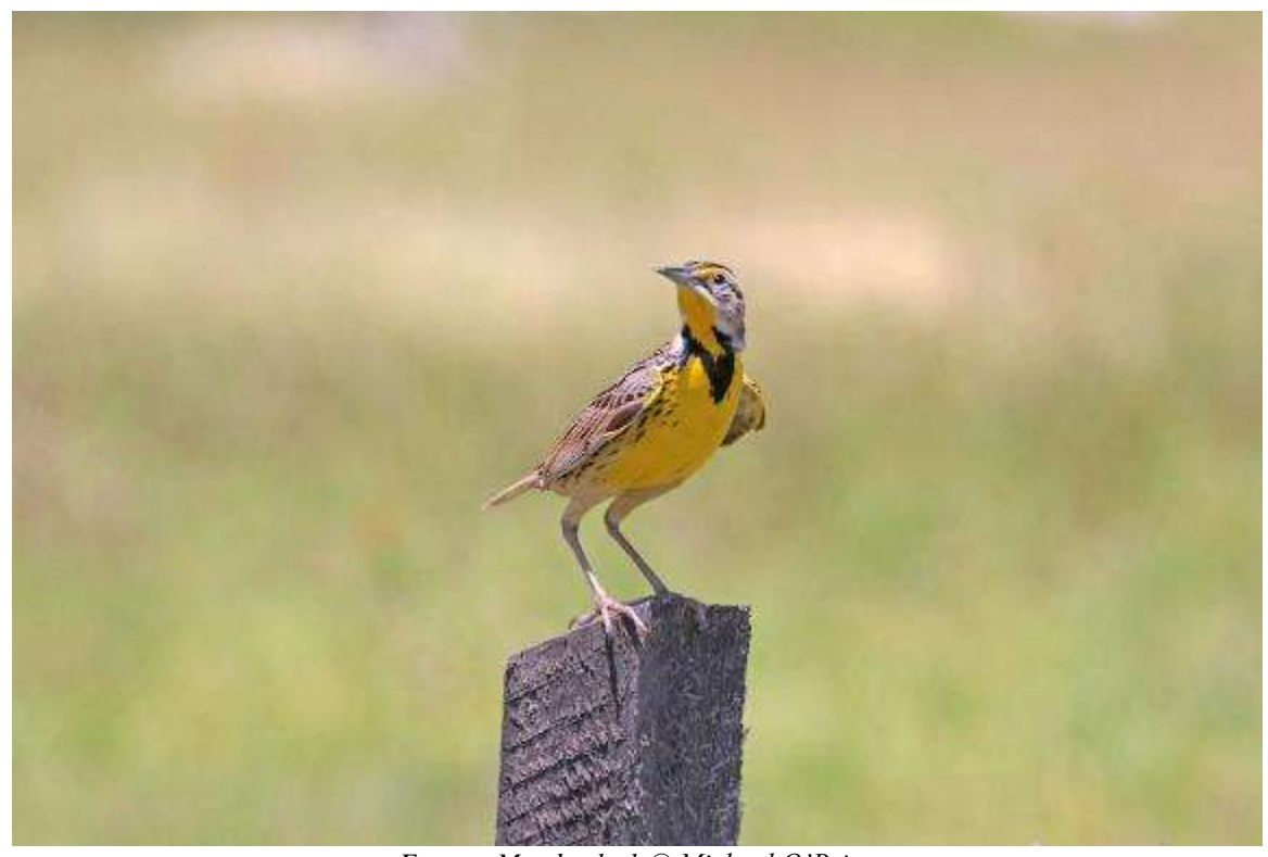
Eastern Meadowlark

Eastern Meadowlark (Sturnella magna) – Seen at Indian Creek and along the Northern Highway.