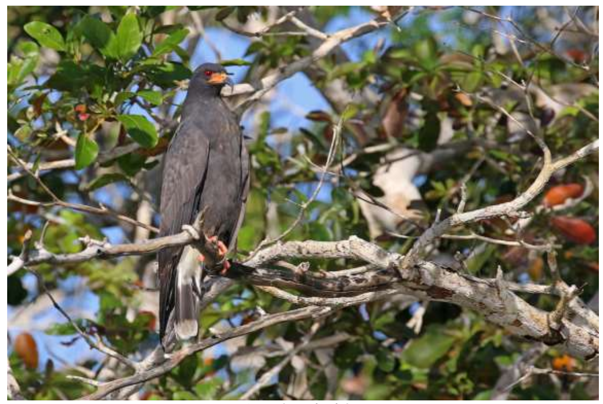
Snail Kite

Snail Kite (Rostrhamus sociabilis) – Small numbers at CT plus a few along the New River.