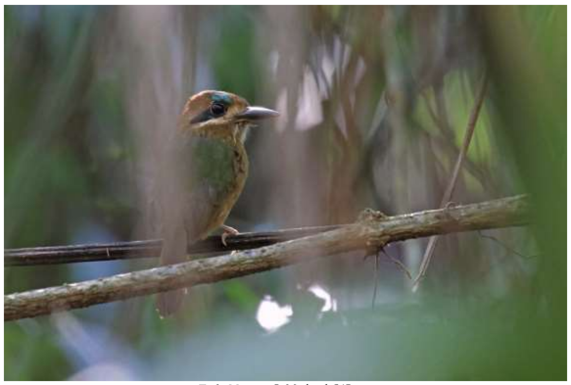
Tody Motmot

Tody Motmot ( Hylomanes momotula ) – Nice views at Lamanai.