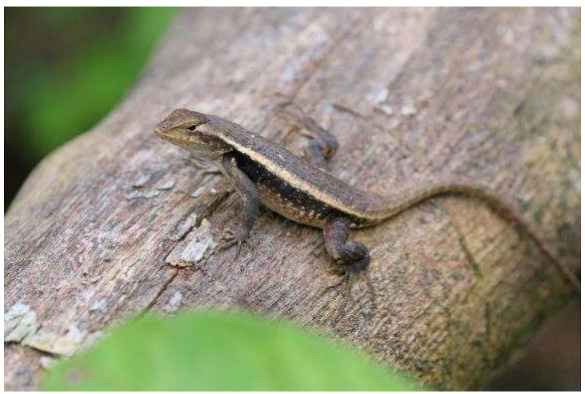
Yellow-spotted Spiny-Lizard

Yellow-spotted (Yucatan) Spiny Lizard (Sceloporus chrysostictus) – Seen at Altun Ha.