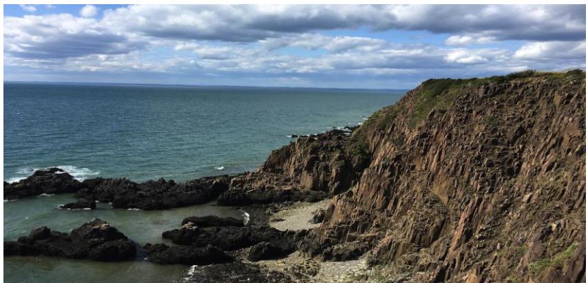
Southwest Head, Grand Manan, New Brunswick

We will arrive at the Marathon Inn in time for dinner.