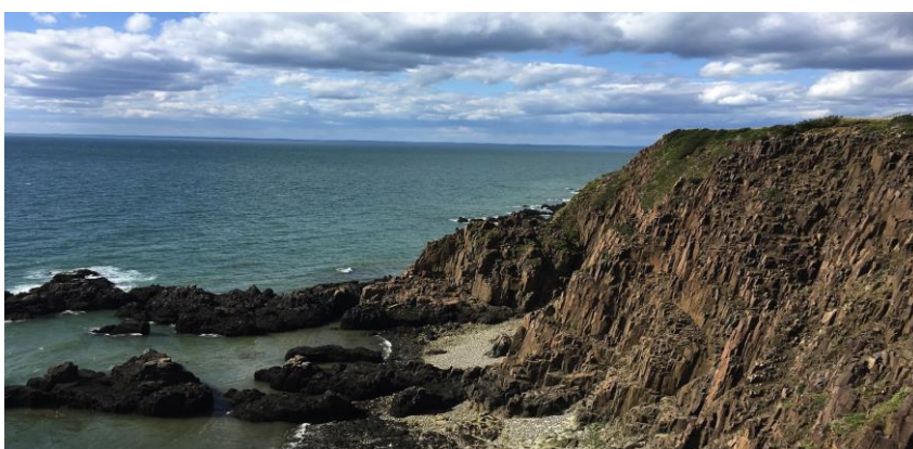
Southwest Head, Grand Manan, New Brunswick

We will arrive at the Marathon Inn in time for dinner.