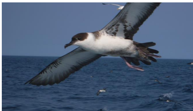
Great Shearwater © Barry Zimmer

September 4-5, Days 3-5: Grand Manan and Pelagic Trip. These three days will be spent exploring the Bay of Fundy and the island of Grand Manan. Our exact schedule will remain flexible, allowing us to take best advantage of the tides and weather. One full day will be devoted to a boat trip into the Bay of Fundy in search of pelagic birds and marine mammals. Grand Manan is situated in close proximity to a number of prominent submarine canyons and shelves. As the currents meet these underwater barriers, great upwellings are created which propel the colder, nutrient-rich bottom waters to the surface. This, in turn, concentrates plankton, fish, and ultimately, large numbers of pelagic birds and whales.