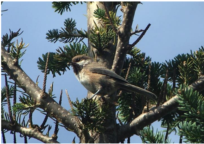
Boreal Chickadee

Not all our time will be spent at sea, for there is plenty to do on Grand Manan itself. The spruce forests here should harbor numbers of migrant passerines, particularly warblers. At favored spots, such as Long Eddy Point, it's not uncommon to encounter flocks containing Black-capped Chickadee, Red-breasted Nuthatch, both kinglets, a couple of vireos, a few flycatchers, and a half dozen or more species of warblers. If we are lucky enough to be visiting