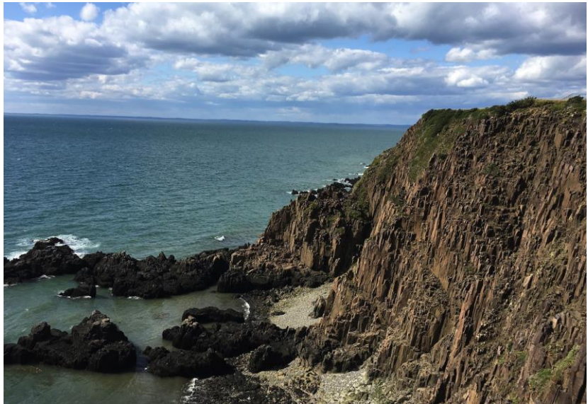
Southwest Head, Grand Manan, New Brunswick

September 5, Day 2: Bangor to Grand Manan. Today we will drive to Black's Harbour, New Brunswick, to catch our ferry for the ninety-minute ride to Grand Manan. Before arriving at Black's Harbour we will likely spend a little time exploring the Orono Bog area north of Bangor in search of migrants. A wide variety of warblers are possible here and this area is particularly good for the locally uncommon Palm Warbler. Alternatively, we may just head eastward toward the border, birding en route. (this has been our recent strategy with increased scrutiny at the border due to COVID restrictions) The ferry crossing frequently produces at least a few pelagic birds including small flocks of phalaropes, or lone jaegers, gannets, and shearwaters.