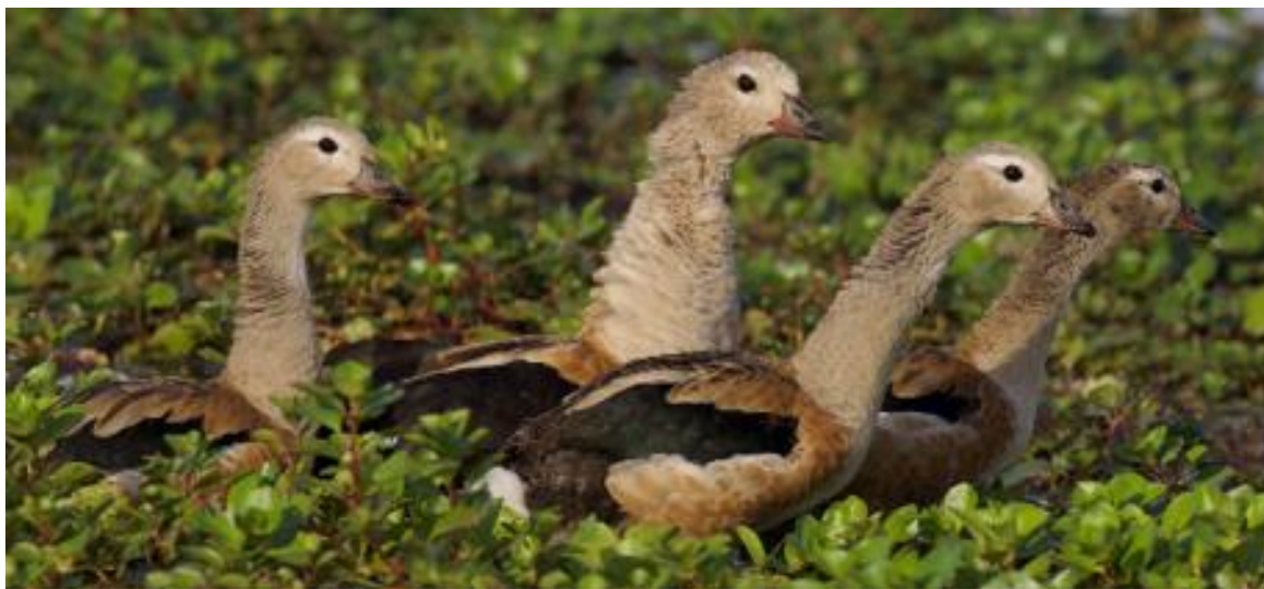
Orinoco Goose

NIGHTS: Ecolodge Juan Solito Lodge, Hato La Aurora, Colombian Llanos