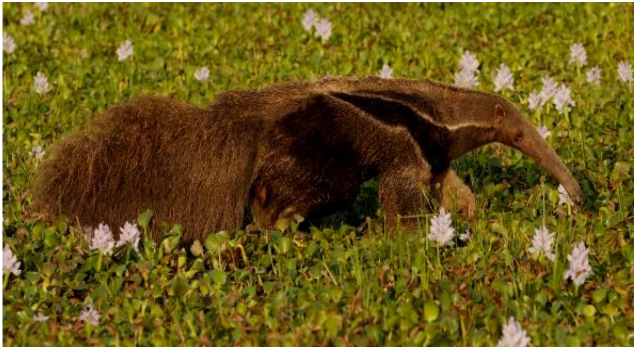
Giant Anteater

Please note that this tour can be taken in combination with Undiscovered Eastern Colombia: Birding Secrets of the White Sands of Inírida, January 9-16, 2022.