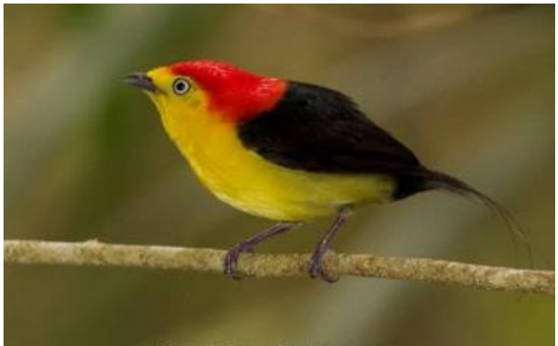
Wire-tailed Manakin