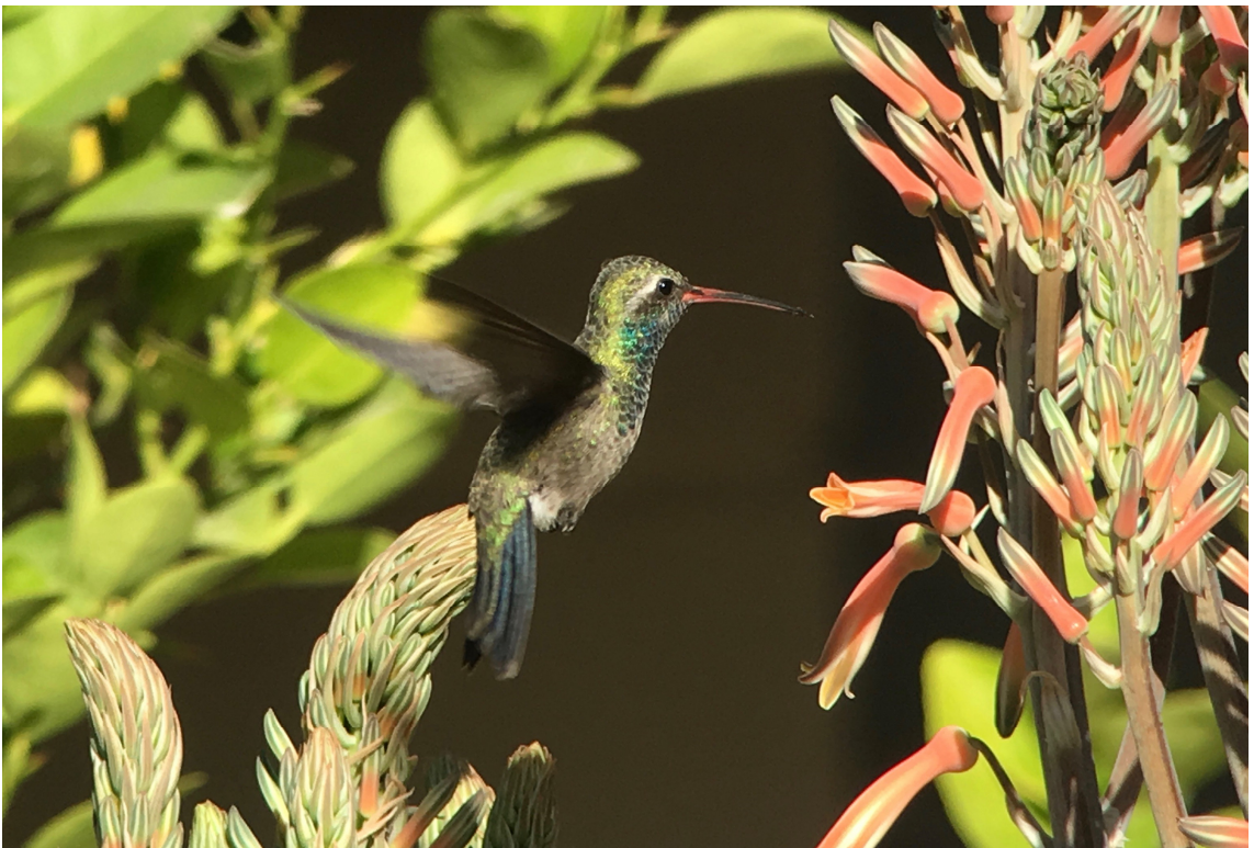
Broad-billed Hummingbird, Tucson, Arizona, January 17, 2018

Violet-crowned Hummingbird ( Amazilia violiceps ) one gorgeous bird at Paton's feeders spotted by Burr; rare in winter