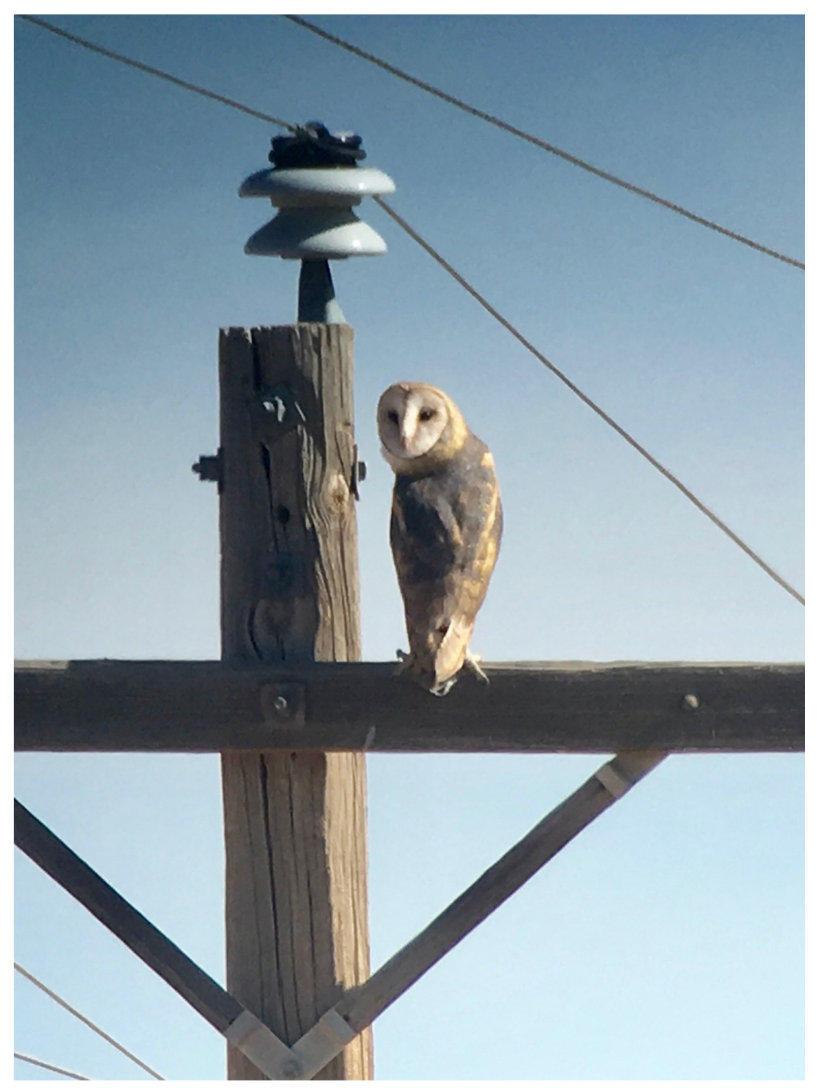
Barn Owl, Kansas Settlement, Arizona, January 19, 2018