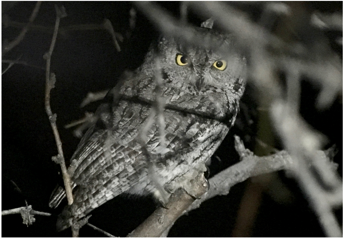
Western Screech-Owl, Madera Canyon, Arizona, January 18, 2018

Day Four found us in the Sulphur Springs Valley south of Willcox. A host of highlights were found, including the likes of Greater White-fronted Goose, a very rare male Eurasian Wigeon, an estimated 15,000 Sandhill Cranes, three more Ferruginous Hawks, another Prairie Falcon, a Barn Owl that magically perched in the open on a telephone pole (voted the favorite bird of the tour), Woodhouse's Scrub-Jay, Crissal Thrasher, another Sage Thrasher, Lark Bunting, Brewer's Sparrow, Lark Sparrow, and a swirling flock of Chestnut-collared Longspurs.