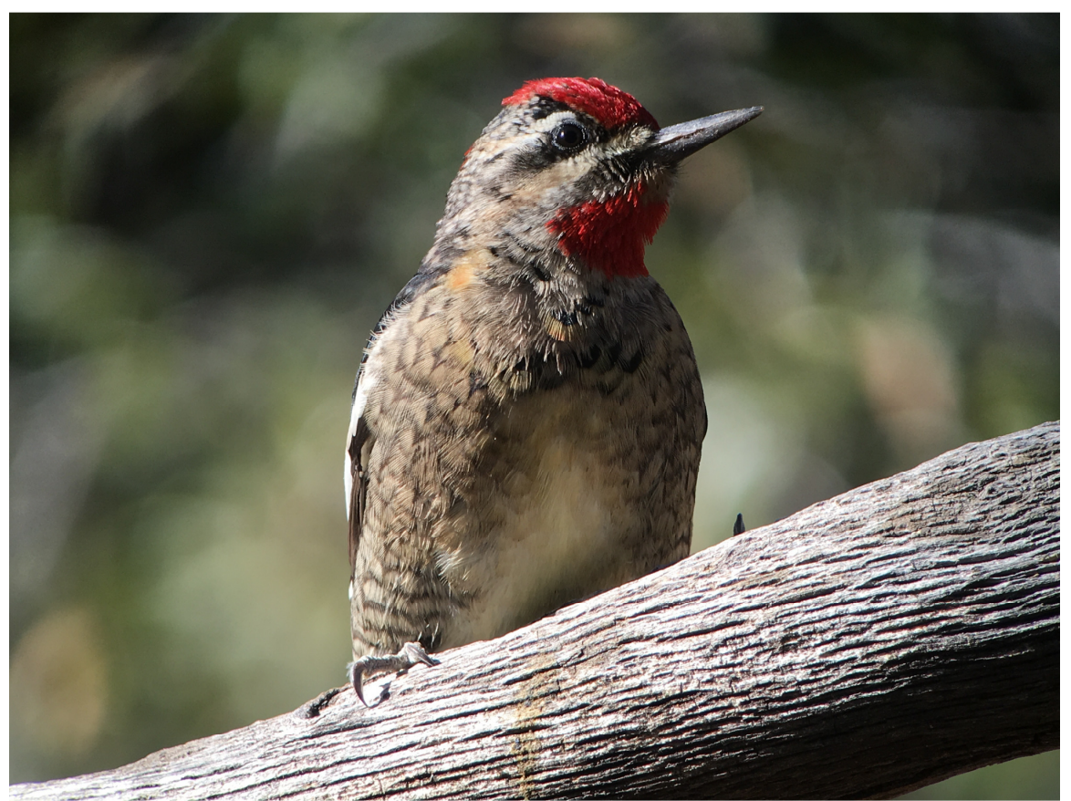
Red-naped Sapsucker, Madera Canyon, Arizona, January 16, 2018

Once again, our Winter Southern Arizona tour was a huge success. We scoured a variety of habitats from the oak-juniper woodlands of Madera Canyon to the riparian habitat along the Santa Cruz River, to the Sonoran desert around Green Valley, and to the agricultural fields and desert scrub of the Sulphur Springs Valley in search of southwestern residents, winter specialties, and Mexican rarities. On all counts our trip was wildly successful.