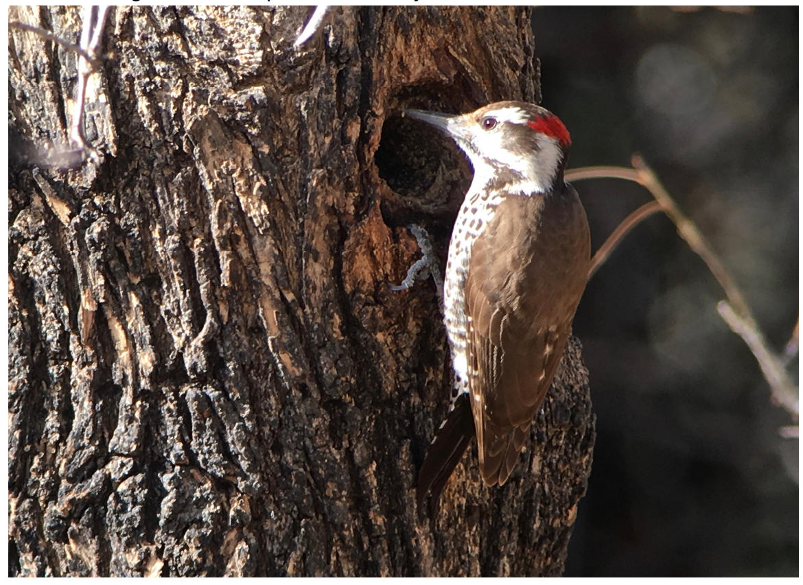
Arizona Woodpecker, Madera Canyon, Arizona, January 16, 2018

Lodge hosted a rare overwintering Rivoli's Hummingbird, the highly sought Arizona Woodpecker, Acorn Woodpecker, two incredibly close Red-naped Sapsuckers, Mexican Jay, Bridled Titmouse, an absolutely stunning Painted Redstart, and a fierce-looking Yellow-eyed Junco among others. Further up canyon, we located a mixed species flock that contained Hutton's Vireo, Brown Creeper, and a snazzy male Townsend's Warbler, while the Procter Road area at the mouth of the canyon yielded White-throated Swift, Ladder-backed Woodpecker, Hammond's Flycatcher, Western Bluebird, and Canyon Wren. All those goodies were packed into Day One of our tour!