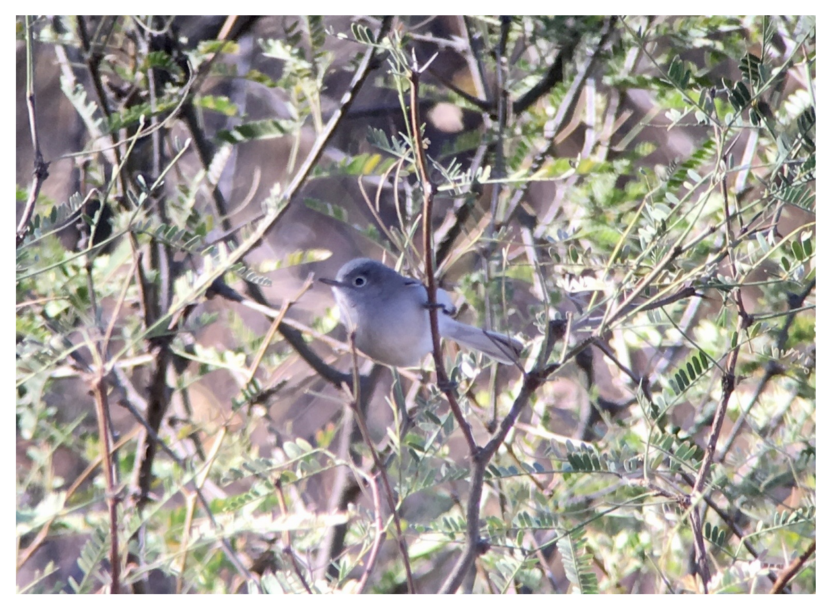
Black-capped Gnatcatcher, Patagonia Lake, Arizona, January 18, 2018

Black-capped Gnatcatcher (Polioptila nigriceps) N---one pair at Patagonia Lake seen very well after some searching; rare resident; great views; tied for third favorite bird of the tour!