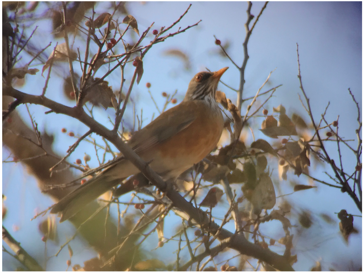
Rufous-backed Robin, De Anza Trail, Arizona, January 18, 2018

Rufous-backed Robin ( Turdus rufopalliatus ) N---three seen at Santa Gerturdis Lane; rare visitor from Mexico