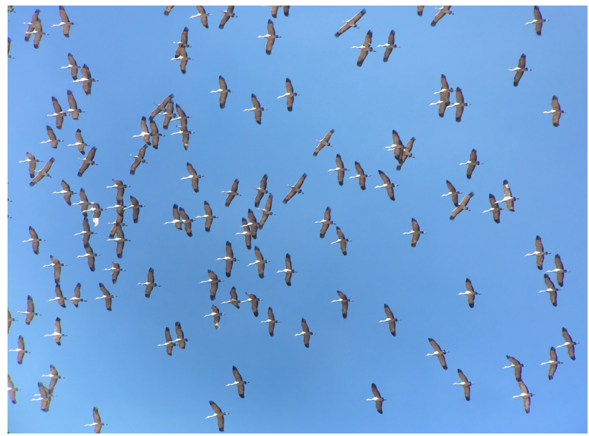
Sandhill Cranes, Whitewater Draw, Arizona, January 19, 2018

In all, we totaled 160 species of birds with loads of raptors and wintering sparrows, many resident southwestern specialties, and a couple of Mexican rarities. Additionally, we enjoyed some of the best weather ever for this trip with high temperatures in the 70s every day except the last! This tour is truly a great winter escape!