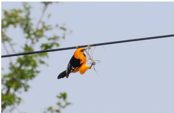
Altamira Oriole starting a nest

We hiked along the wild and seldom-traveled roads once inside the resort. An immature King Vulture was savored as it flew right over our heads! Wedge-billed Woodcreepers and Streak-headed Woodcreepers fed among the tree trunks. An exceptionally cooperative Black-cheeked Woodpecker put on a show for us as it fed nearby. The midday sun was getting toasty, and we headed to the main hummingbird feeding station where we cooled ourselves in the presence of a shaded shelter and gazed at dozens of hummingbird feeders that surrounded us. The small Stripe-throated Hermit visited the feeders sparingly, as did the large and vibrant Green-breasted Mango. Scaly-breasted Hummingbirds showed off their scalloped feathers of dusky-gray as the large Violet Sabrewings tried to steal the show. The hummingbird extravaganza here was spectacular. We tallied ten hummingbird species from this shaded afternoon break!